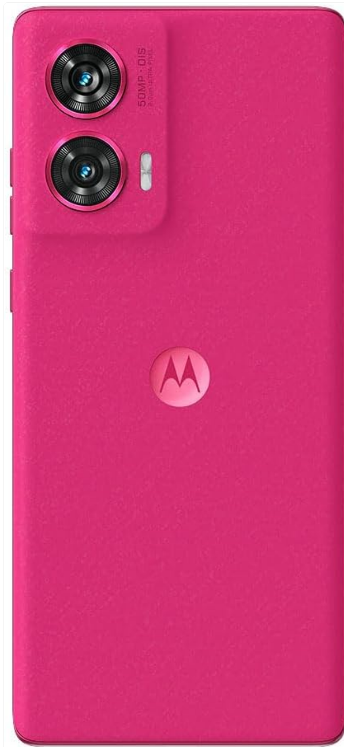
Figure 3: Rear view of the Motorola Moto Edge 50 Fusion 5G, showcasing the dual camera setup.