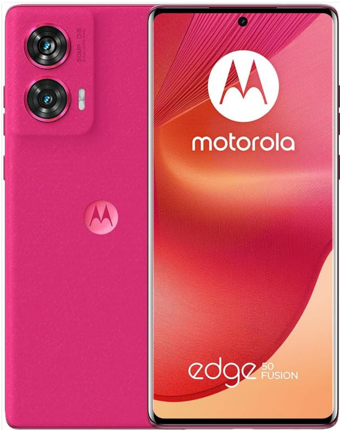
Figure 1: Motorola Moto Edge 50 Fusion 5G smartphone, showcasing its front and back design in pink.