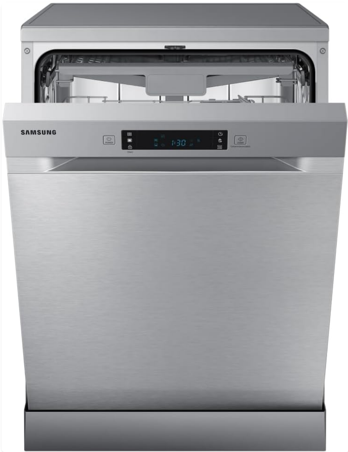
Figure 3: Empty interior of the dishwasher, showing the upper and lower racks ready for loading.