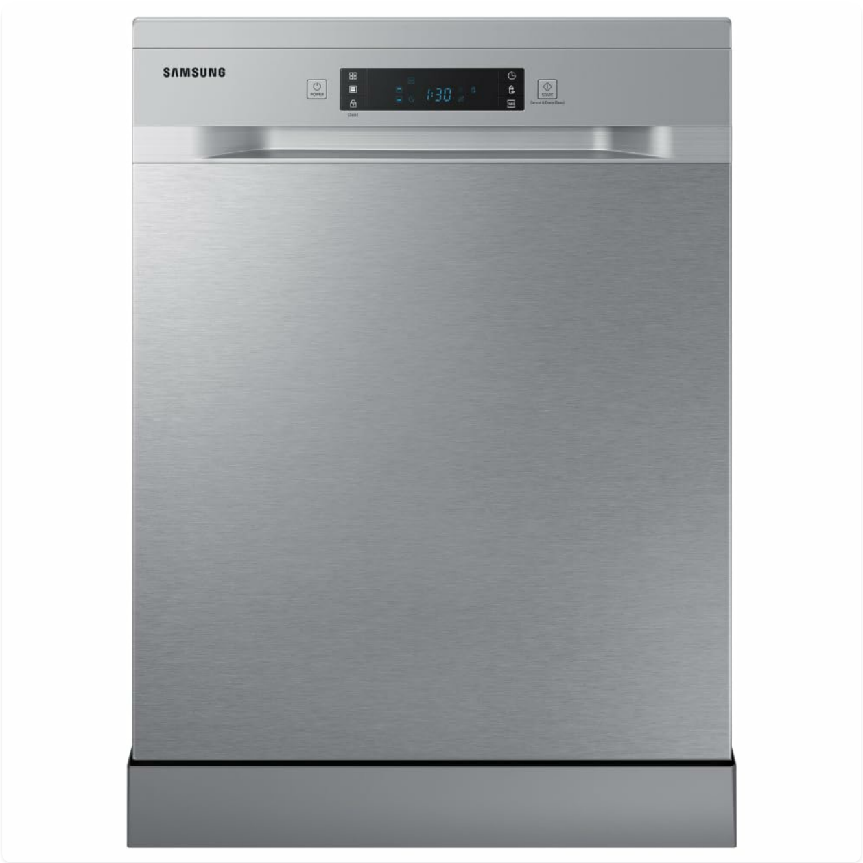
Figure 1: Front view of the Samsung DW60DG550FSRBZ Dishwasher with the door slightly open, revealing the control panel.