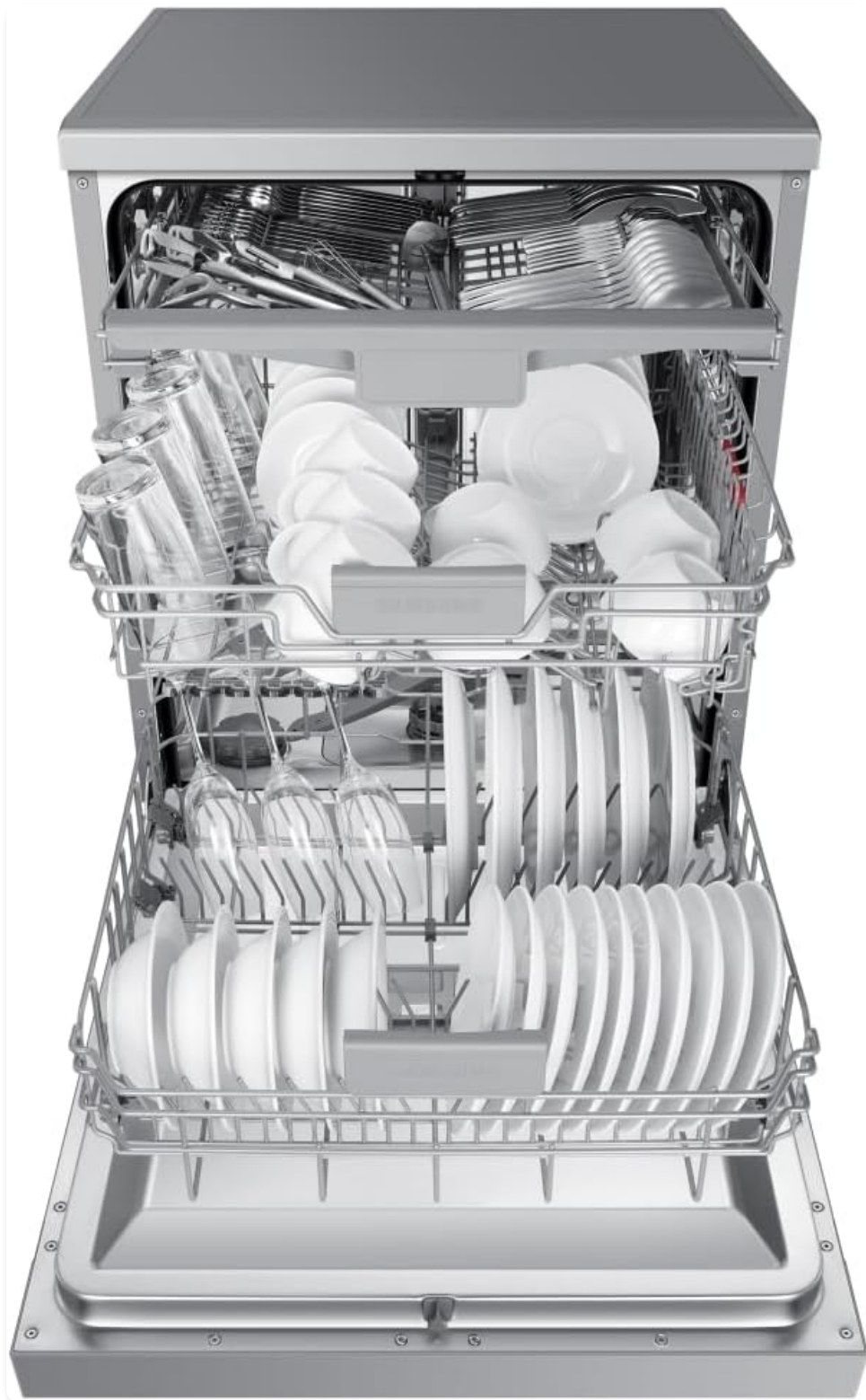
Figure 5: Side view of the dishwasher with racks extended, highlighting the spacious design for easy loading and unloading.