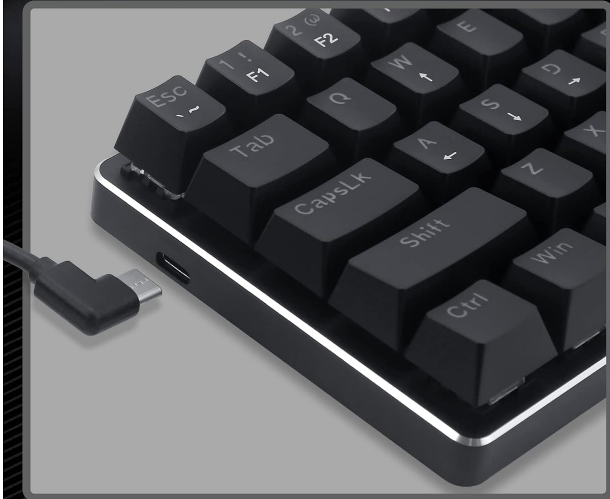
Image showing the detachable USB-C cable connected to the Redragon K613 JAX keyboard, emphasizing its stable connection.