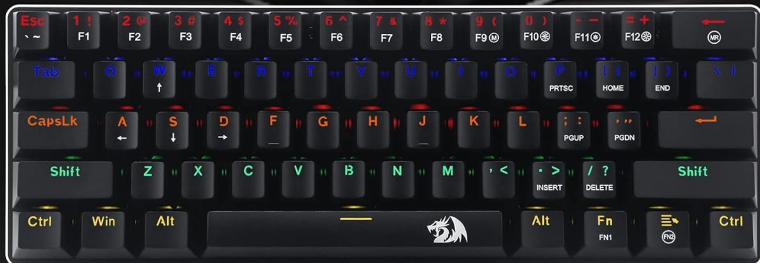
Image showing the compact 60% layout of the Redragon K613 JAX mechanical keyboard, highlighting its space-saving design.