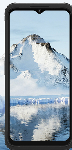
Figure 5: The phone's hardware specifications provide a responsive user experience for various applications.