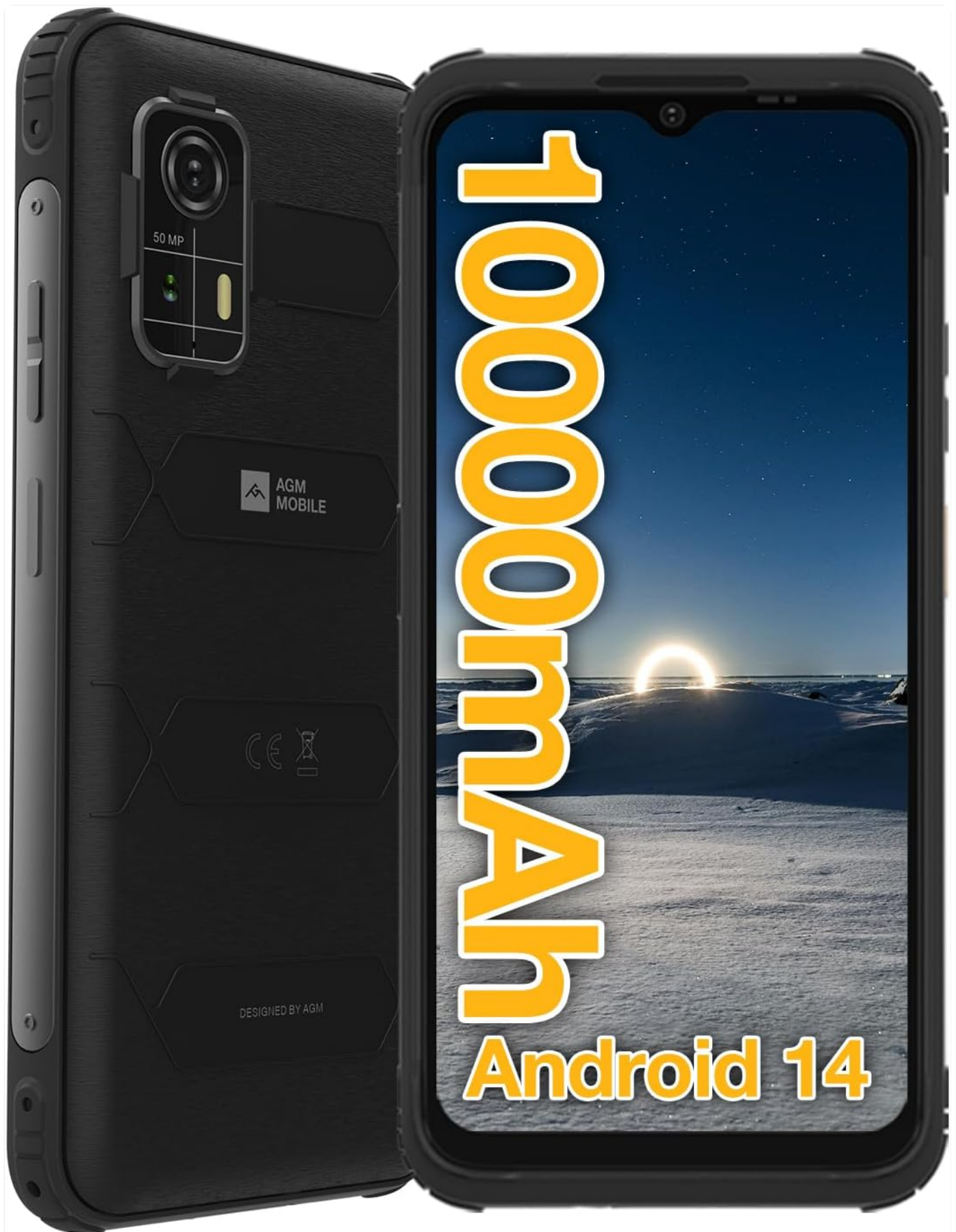
Figure 1: Front and back view of the AGM H MAX Rugged Smartphone, showcasing its robust design and large display.