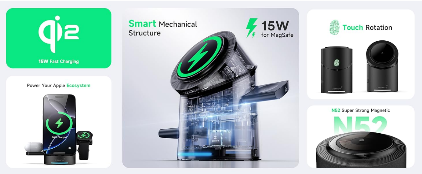
Image: Detailed view of the ZEEHOO 3-in-1 Charging Station's advanced motion mechanism, showing touch rotation and pop-up features.