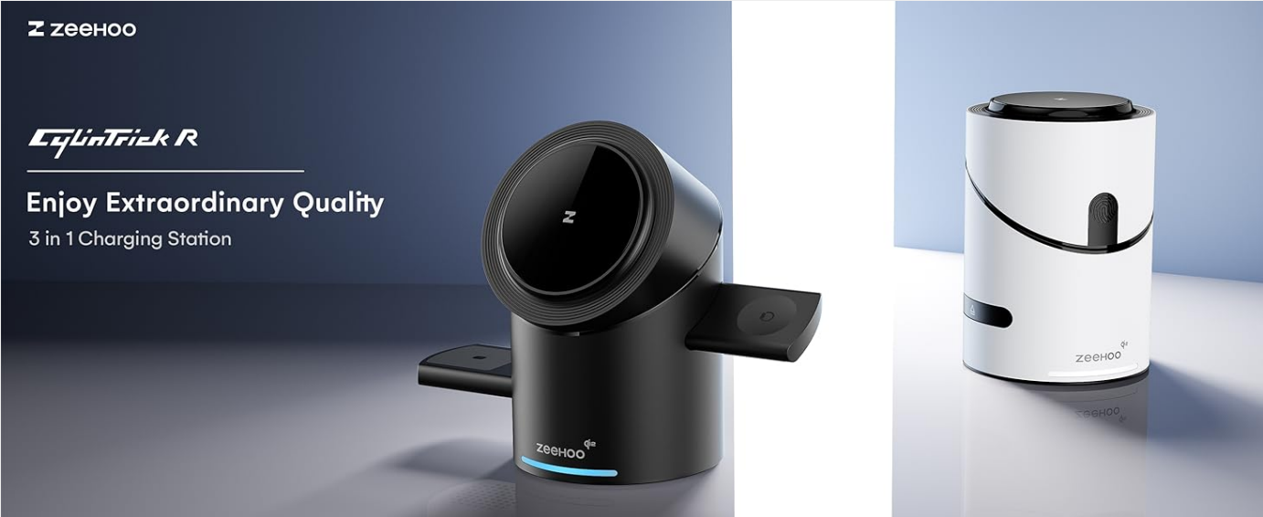
Image: The ZEEHOO 3-in-1 Charging Station highlighting its 15W Qi2 fast charging capability for Apple devices.