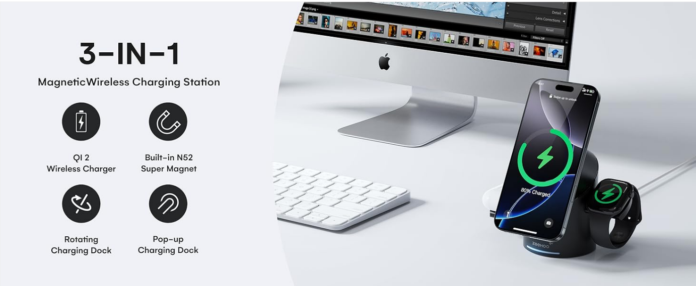
Image: The ZEEHOO 3-in-1 Charging Station simultaneously charging an iPhone, Apple Watch, and AirPods, demonstrating its multi-device capability.