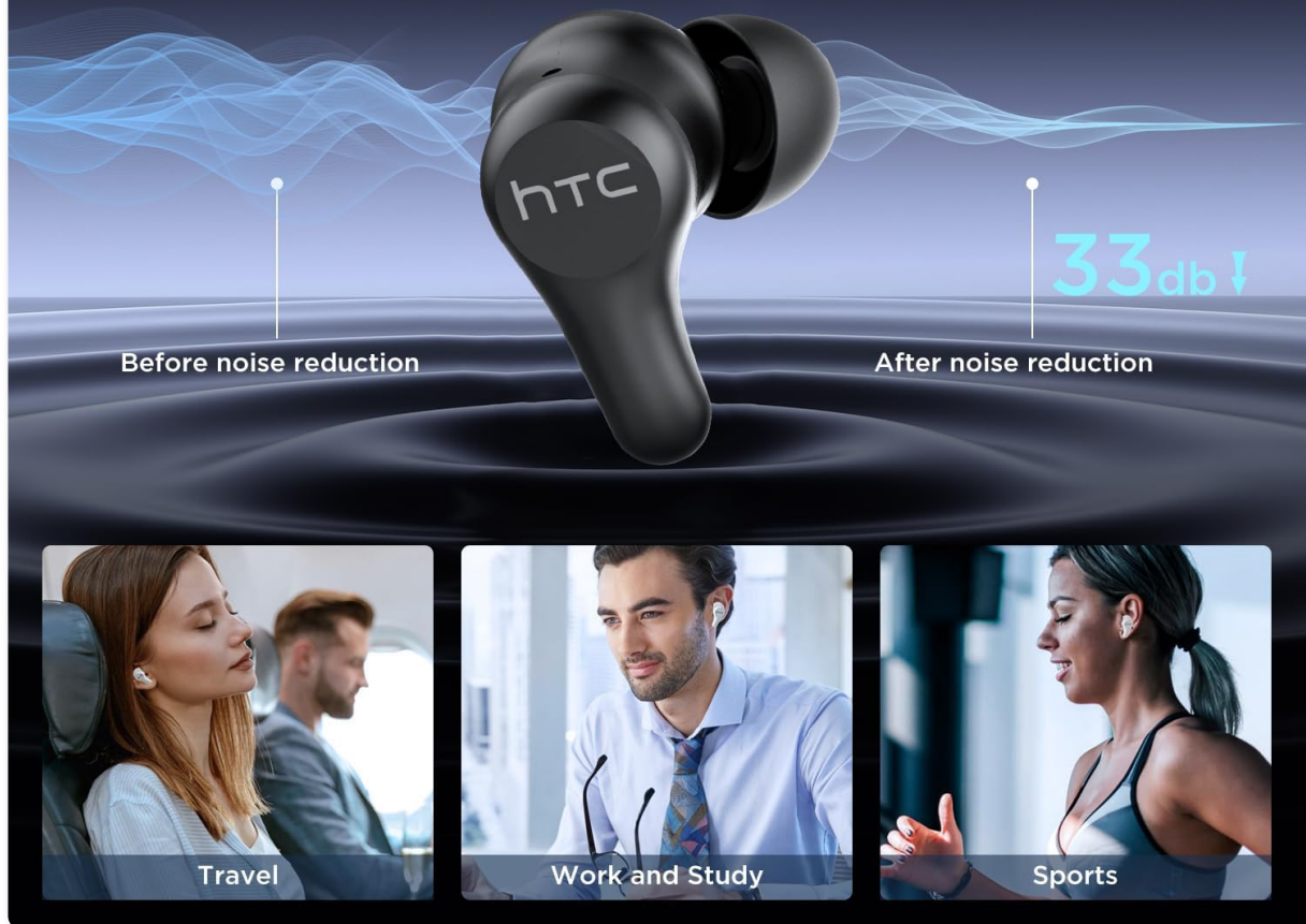
Image: An illustration demonstrating the effectiveness of ANC and ENC noise reduction, showing a 33dB reduction in noise. It highlights scenarios like travel, work/study, and sports where noise cancellation is beneficial.

Dual ANC+ENC noise reduction smarter and quieter