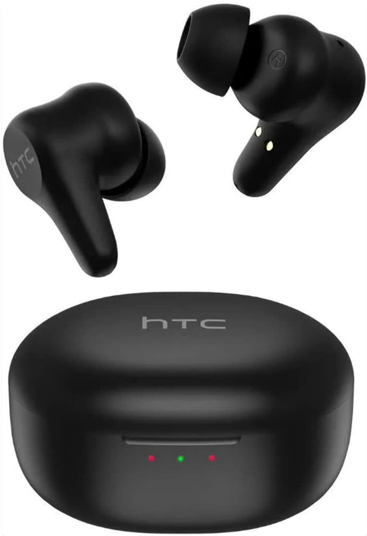
Image: HTC True Wireless Earbuds Plus and their charging case.