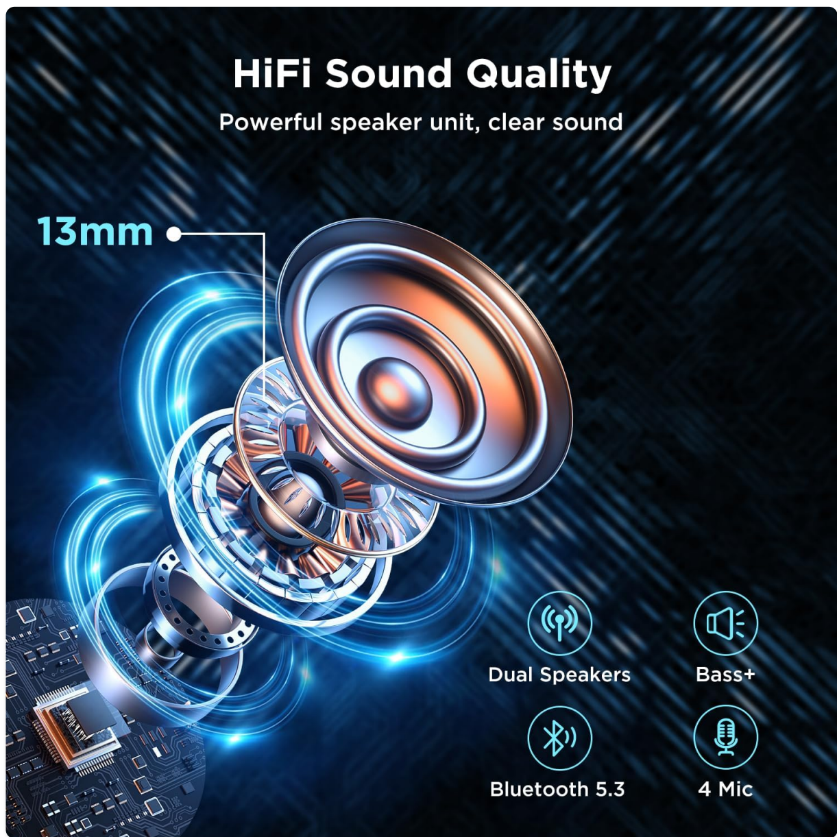
Image: A detailed diagram illustrating the 13mm dynamic driver and its components, emphasizing the powerful speaker unit, dual speakers, enhanced bass, Bluetooth 5.3, and 4-mic system for HiFi sound quality.