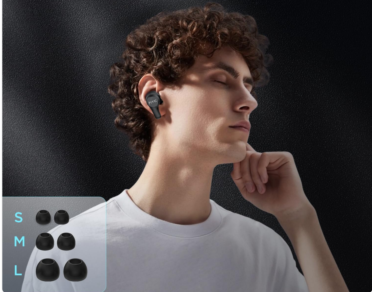
Image: A man wearing the earbuds, with an inset showing the three available ear tip sizes (S, M, L) for comfortable wear.

3 sizes of earplugs for more comfortable use