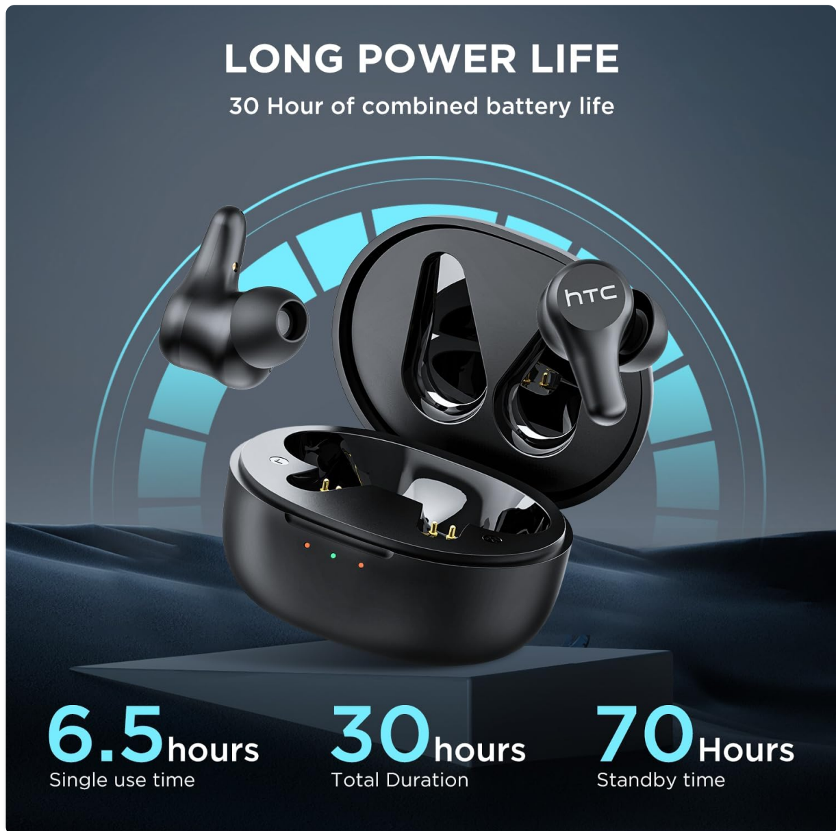
Image: Illustration of the earbuds and charging case with battery life indicators. The earbuds offer 6.5 hours of single use time, with a total of 30 hours of combined battery life from the charging case, and 70 hours of standby time.

Before first use, fully charge the earbuds and charging case. Connect the provided USB-C cable to the charging port on the case and to a power source. The indicator lights on the case will show the charging status. A full charge takes approximately 1.5 hours.