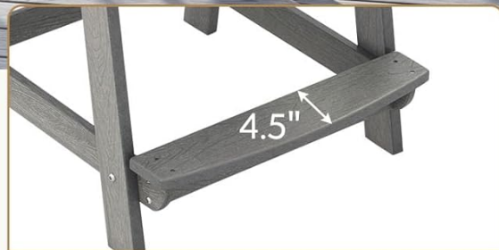
4.5" Wide Footrest

HDPE material ensures durability and easy maintenance in various weather conditions.