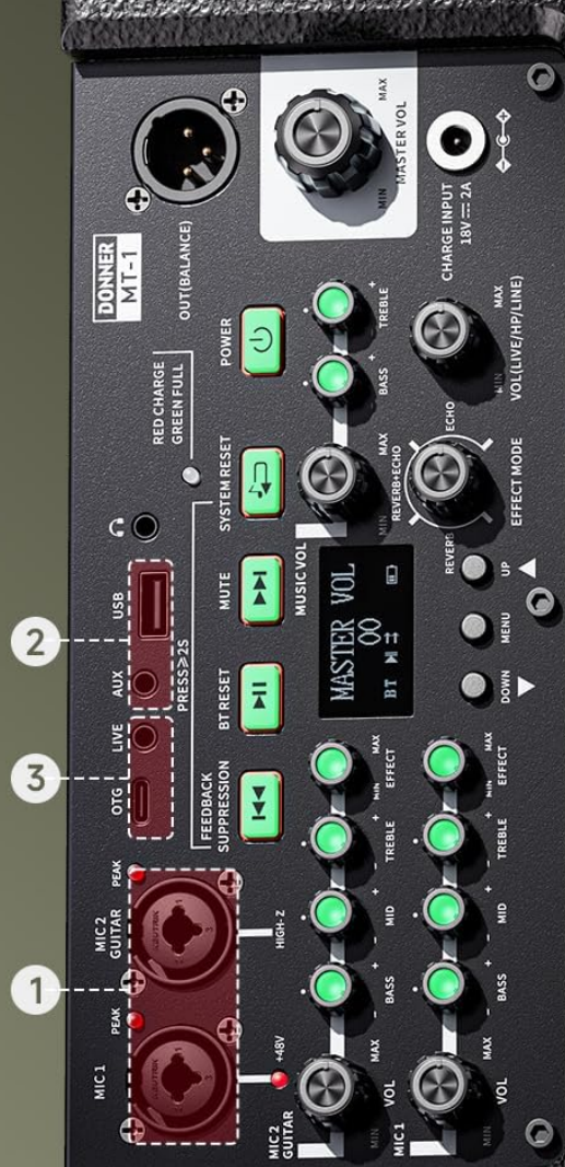
Figure 3: Control Panel with Multiple Input Options