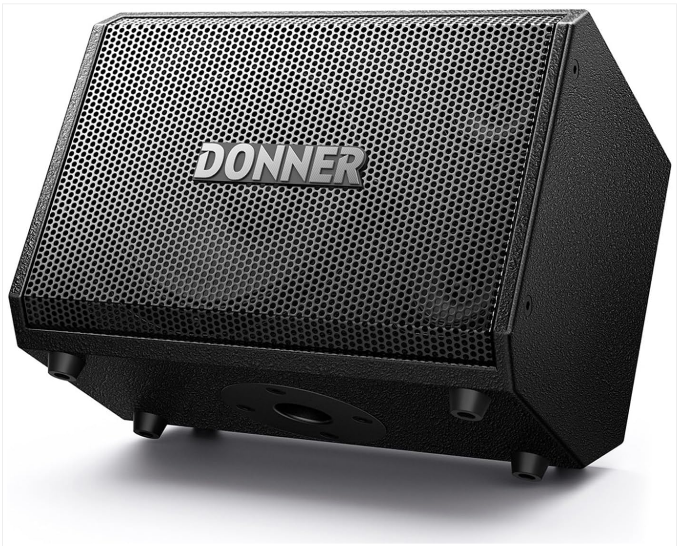
Figure 1: Donner MT-1 Portable PA System