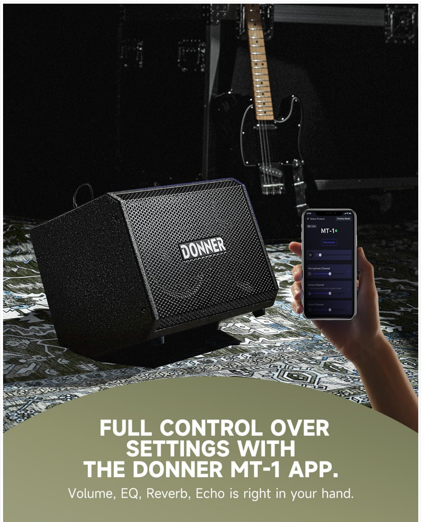
Figure 5: Remote Control via Donner MT-1 App