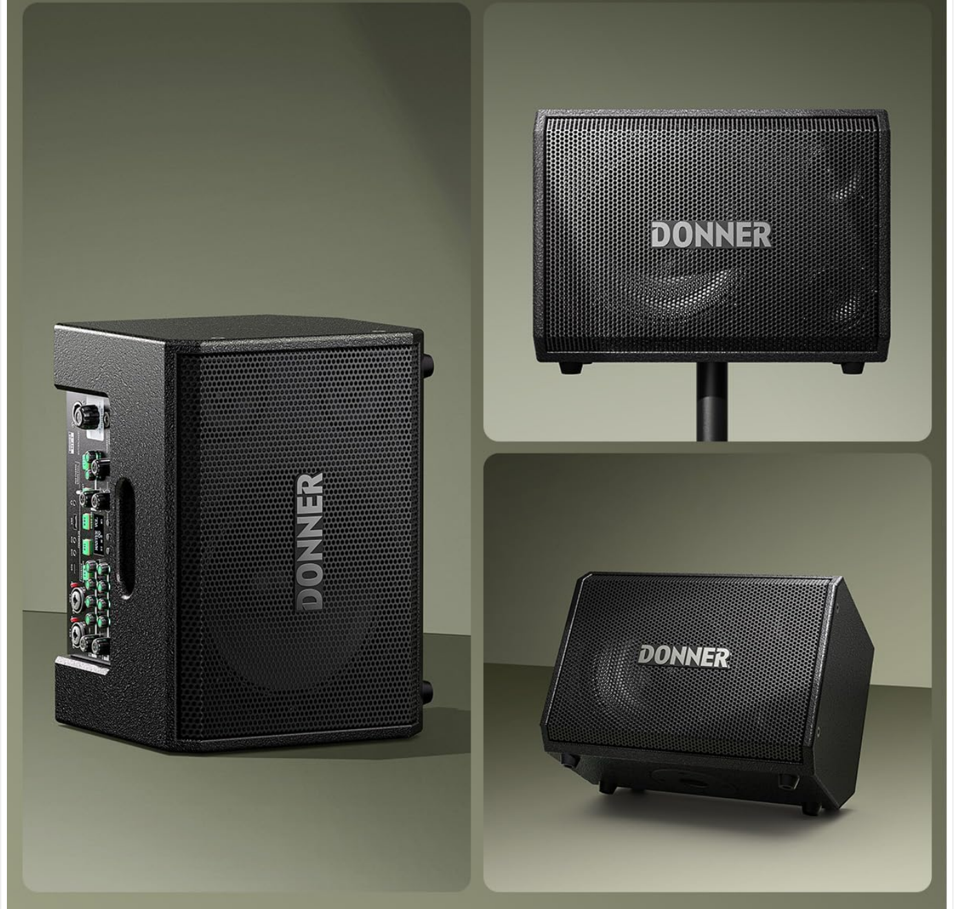
Figure 6: Three Positioning Options for the MT-1

Mounted on Stand, Vertically on Table, Monitor Mode