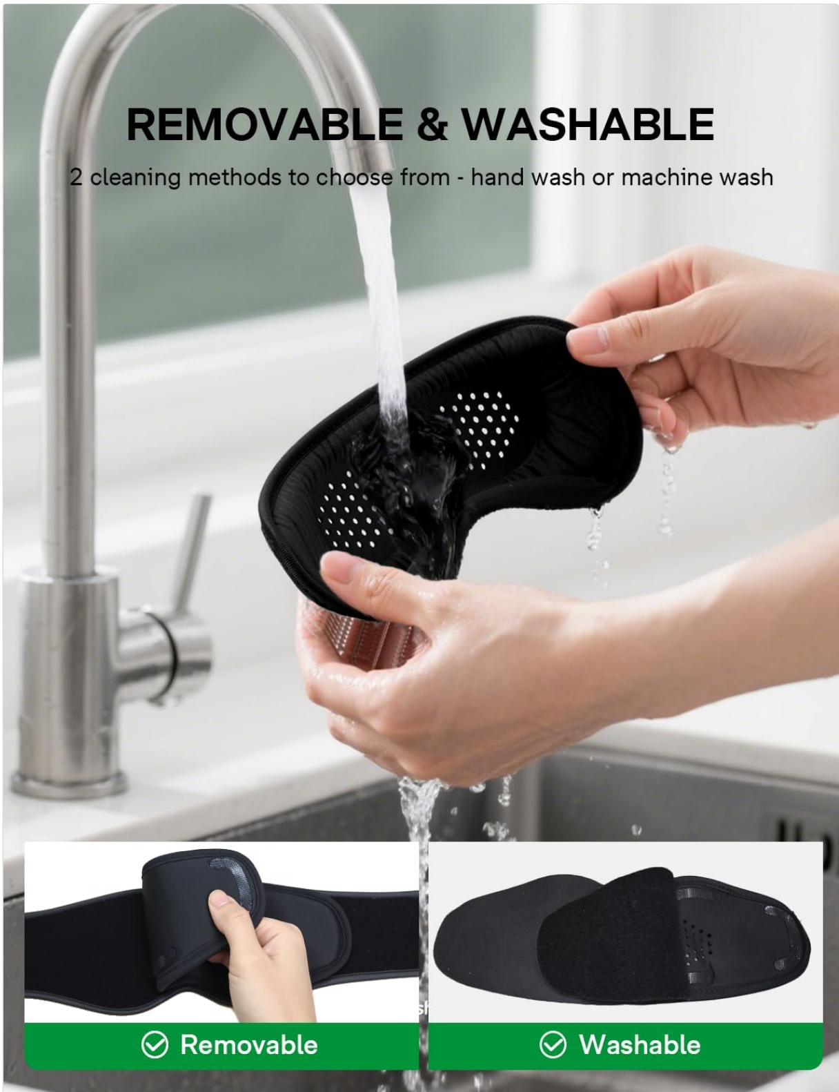
Figure 6.1: Removable and Washable Cover.

2 cleaning methods to choose from - hand wash or machine wash