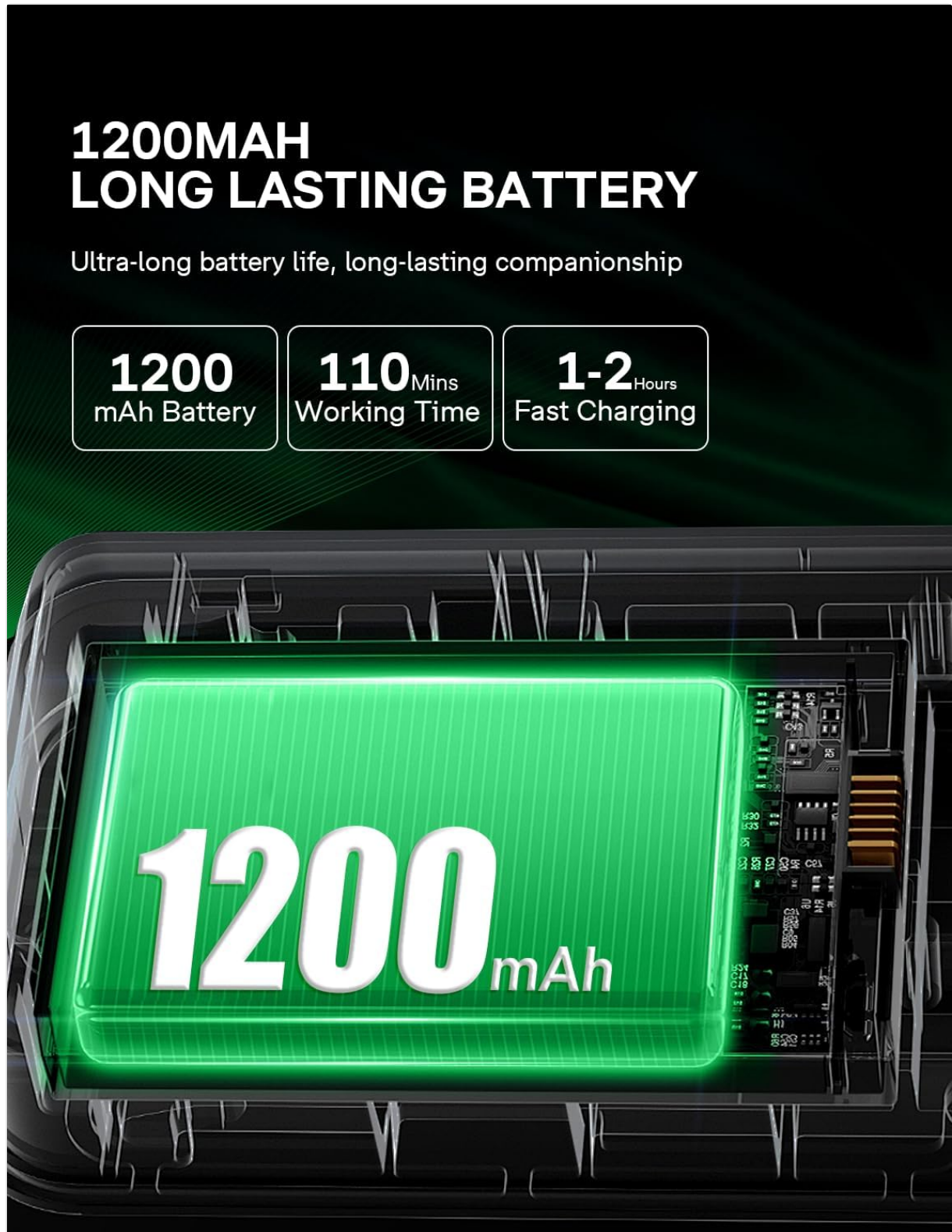
Figure 4.1: Battery specifications and charging time.

Before first use, fully charge the eye mask. Connect the supplied USB-C charging cable to the charging port on the mask and to a compatible USB power adapter (not included). The charging indicator light will show the charging status. A full charge typically takes 1-2 hours.