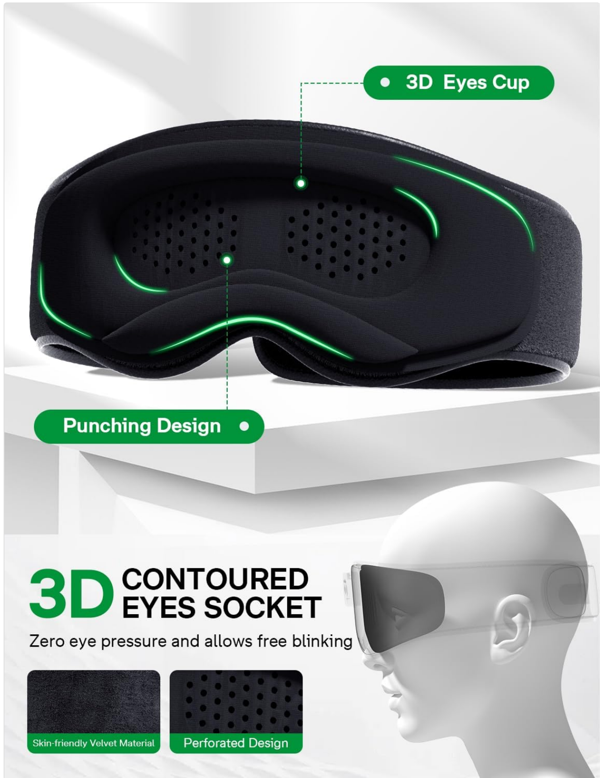
Figure 4.3: 3D Contoured Eye Socket Design.

The image demonstrates how to adjust the eye mask using its Velcro strap. It also provides key dimensions: eye mask length (28.3 inches), Velcro length (3.8 inches), and eye mask width (4.1 inches).