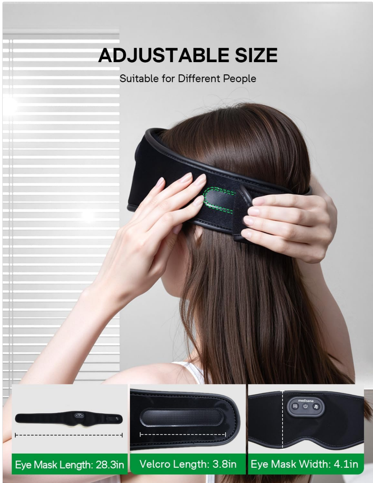
Figure 4.2: Adjusting the eye mask for a comfortable fit.