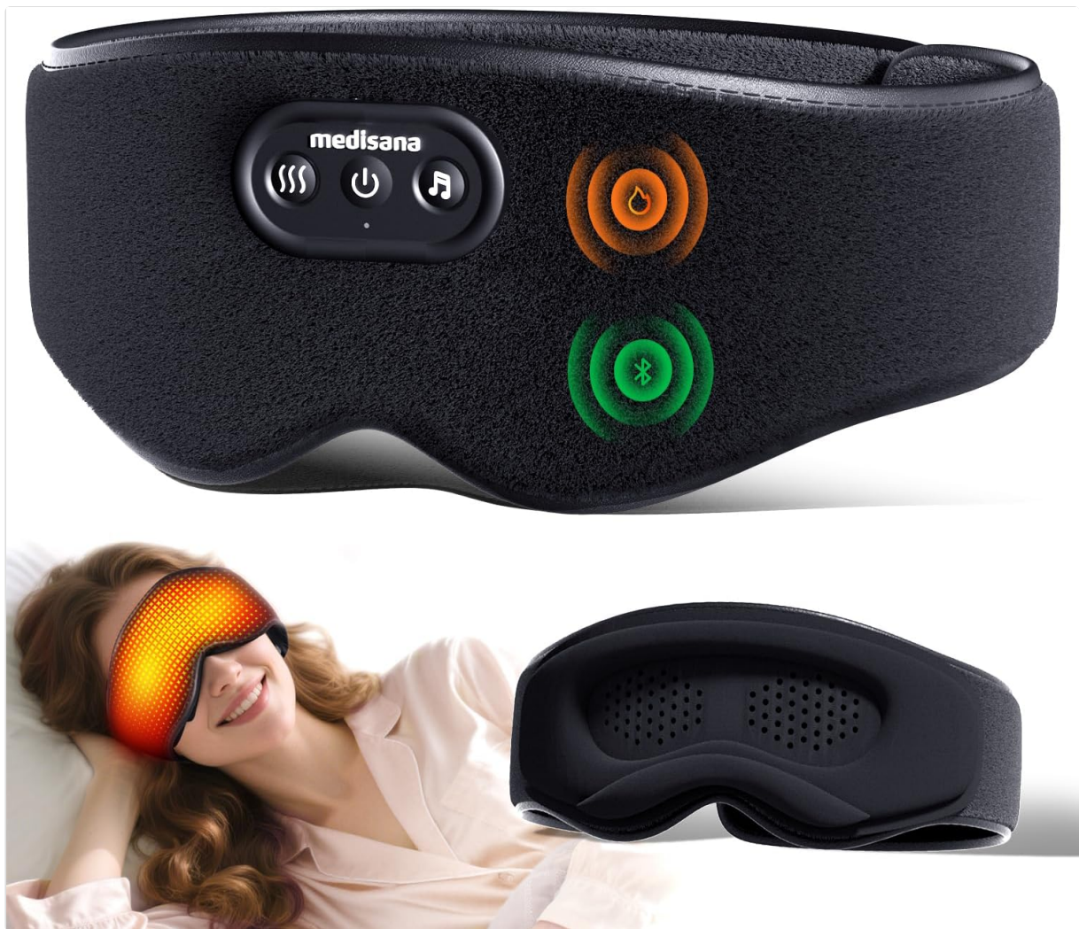
Figure 5.1: Medisana Eye Mask with Control Panel.

This image provides an overview of the Medisana eye mask, clearly showing the control buttons for heat, power, and music functions on the top surface. A person is also depicted wearing the mask, demonstrating its intended use.