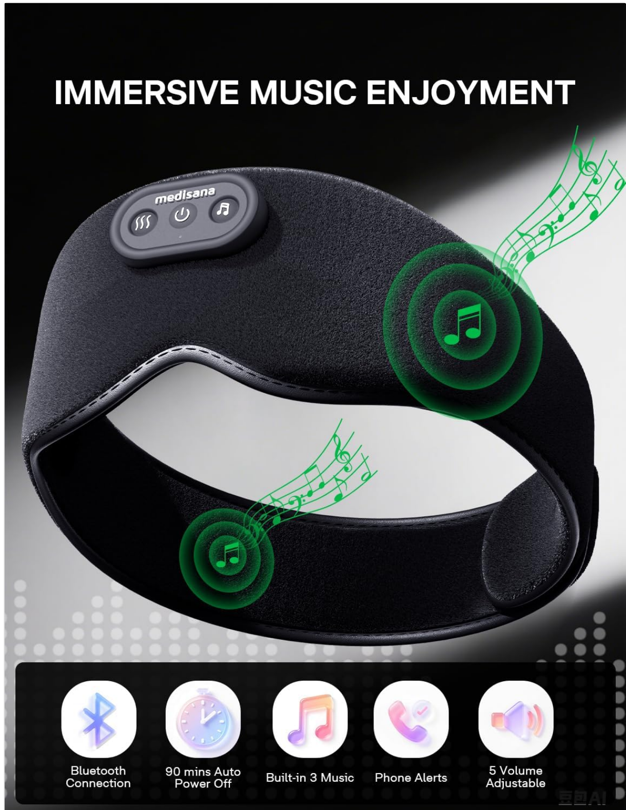
Figure 5.3: Immersive Music Enjoyment Features.

This image illustrates the audio capabilities of the eye mask, including Bluetooth connectivity, a 90-minute