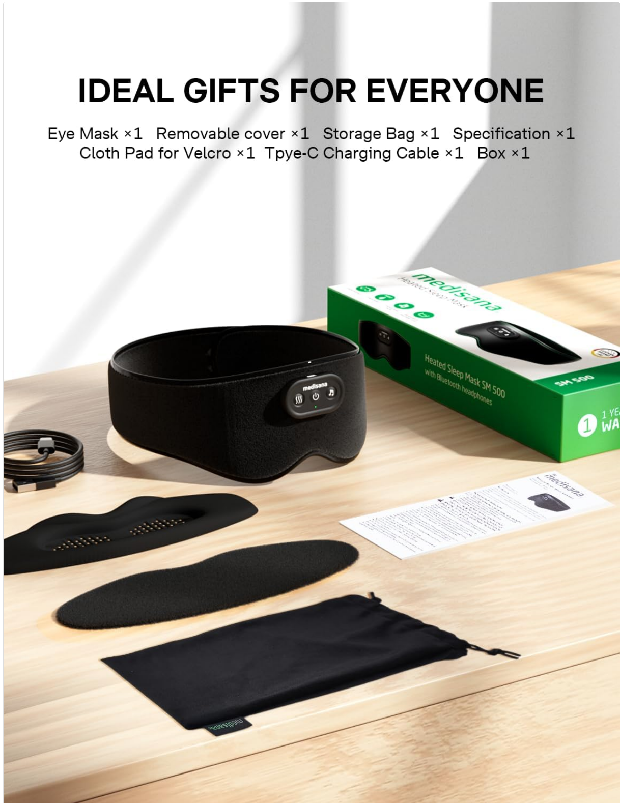
Figure 3.1: Package contents of the Medisana SM 500 Heated Eye Mask.

Eye Mask ×1 Removable cover ×1 Storage Bag ×1 Specification ×1 Cloth Pad for Velcro ×1 Tpye-C Charging Cable ×1 Box ×1