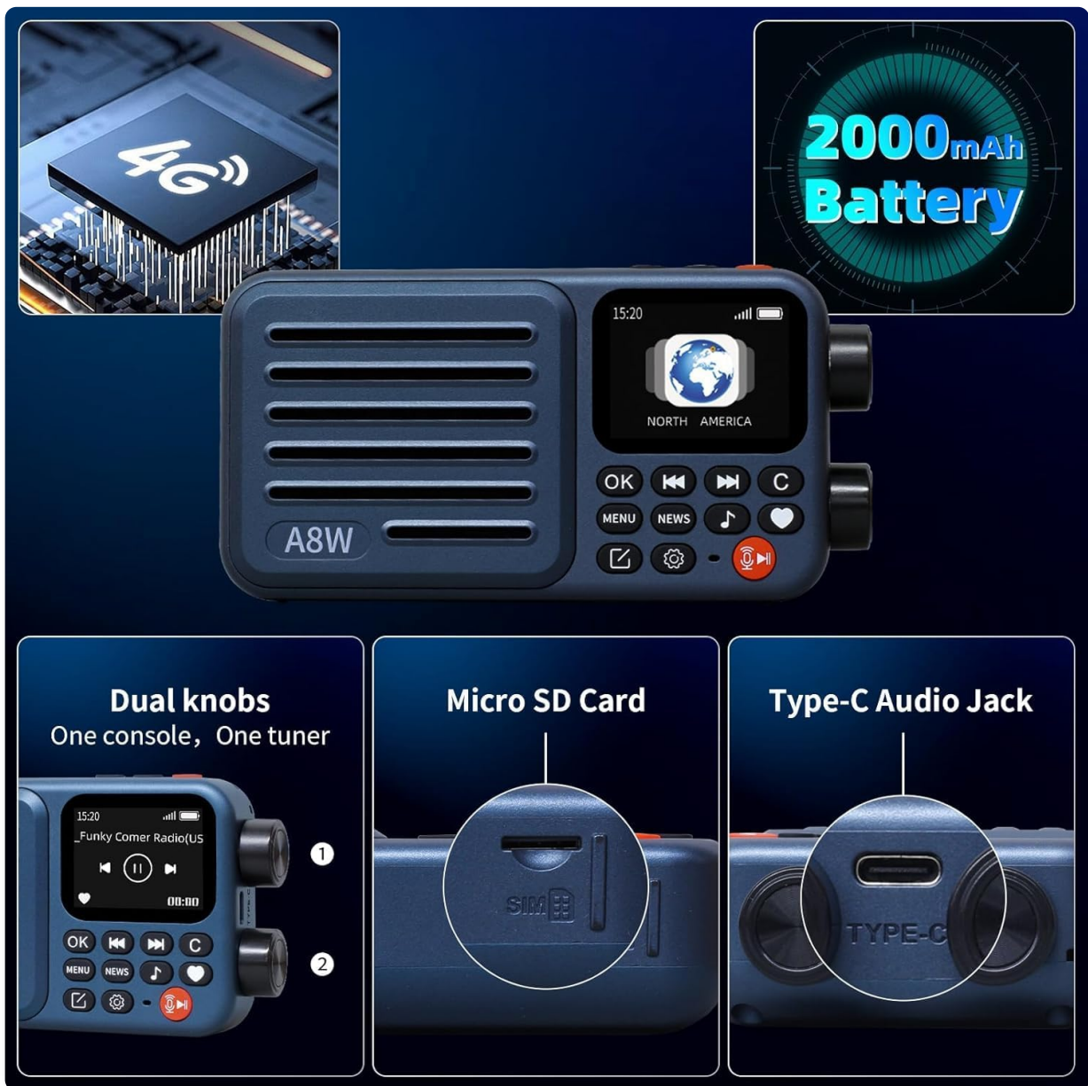
Figure 3: Top and side view of the radio, highlighting the dual control knobs, Micro SD card slot, and Type-C audio jack.