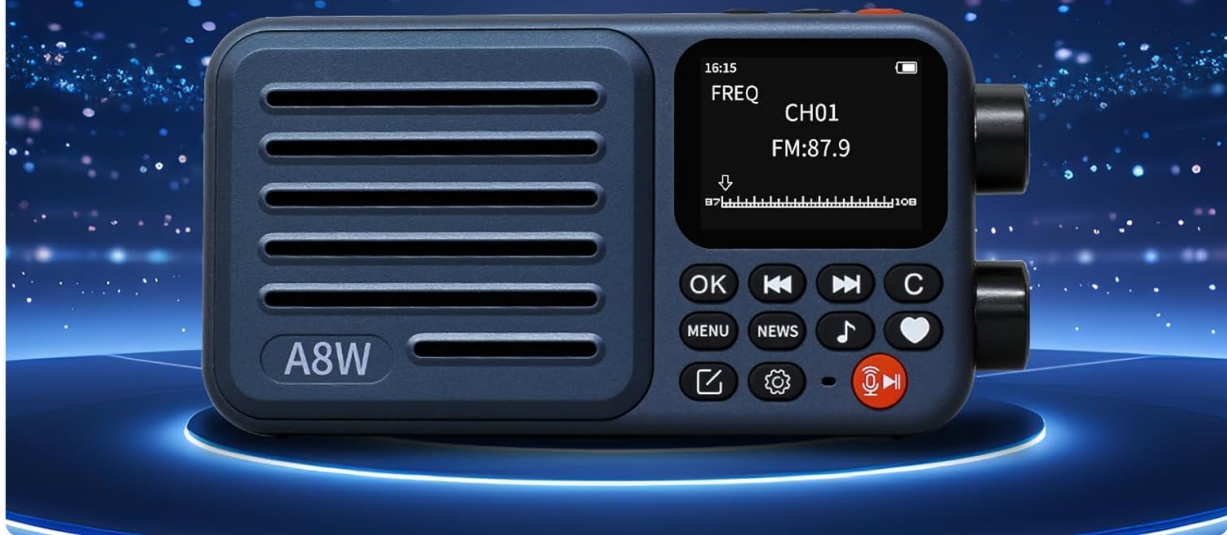
Figure 6: The radio's display showing FM radio mode and frequency information.

Switchable VF/VM mode Supports automatic station saving