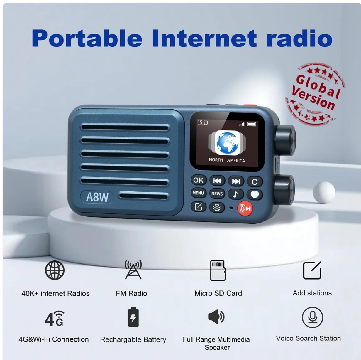
Figure 2: The CHOYONG A8W Internet Radio showcasing its portable design and key features including 40K+ internet radios, FM radio, Micro SD card, 4G/Wi-Fi connection, rechargeable battery, full-range multimedia speaker, and voice search station.