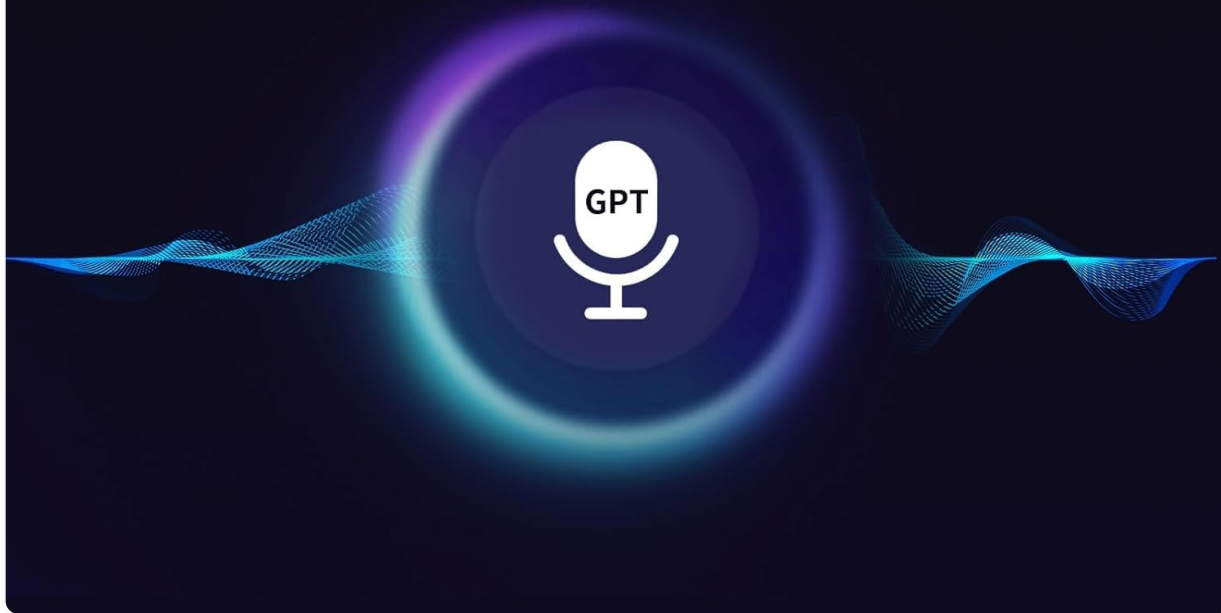
Figure 5: Visual representation of the voice search function on the radio.