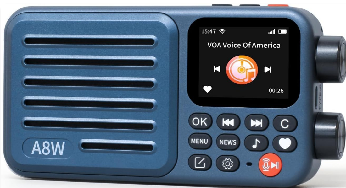
Figure 1: Front view of the CHOYONG A8W Internet Radio, showing the speaker grille, display, and control buttons.

The CHOYONG A8W is a portable smart internet radio receiver designed for global radio access via Wi-Fi or 4G connectivity. It features a compact design, a clear display, and intuitive controls, offering access to over 40,000 internet radio stations, FM radio, and local media playback via TF card.