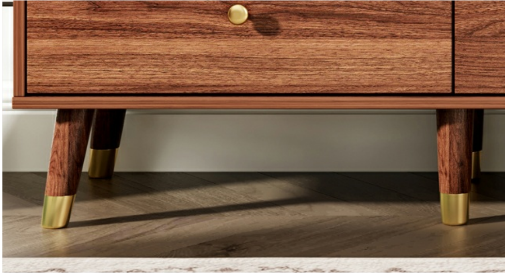
Image: A close-up view highlighting key components: smooth drawer rails, exquisite golden handles, and wooden legs with brass caps. These are essential parts for the dresser's functionality and appearance.