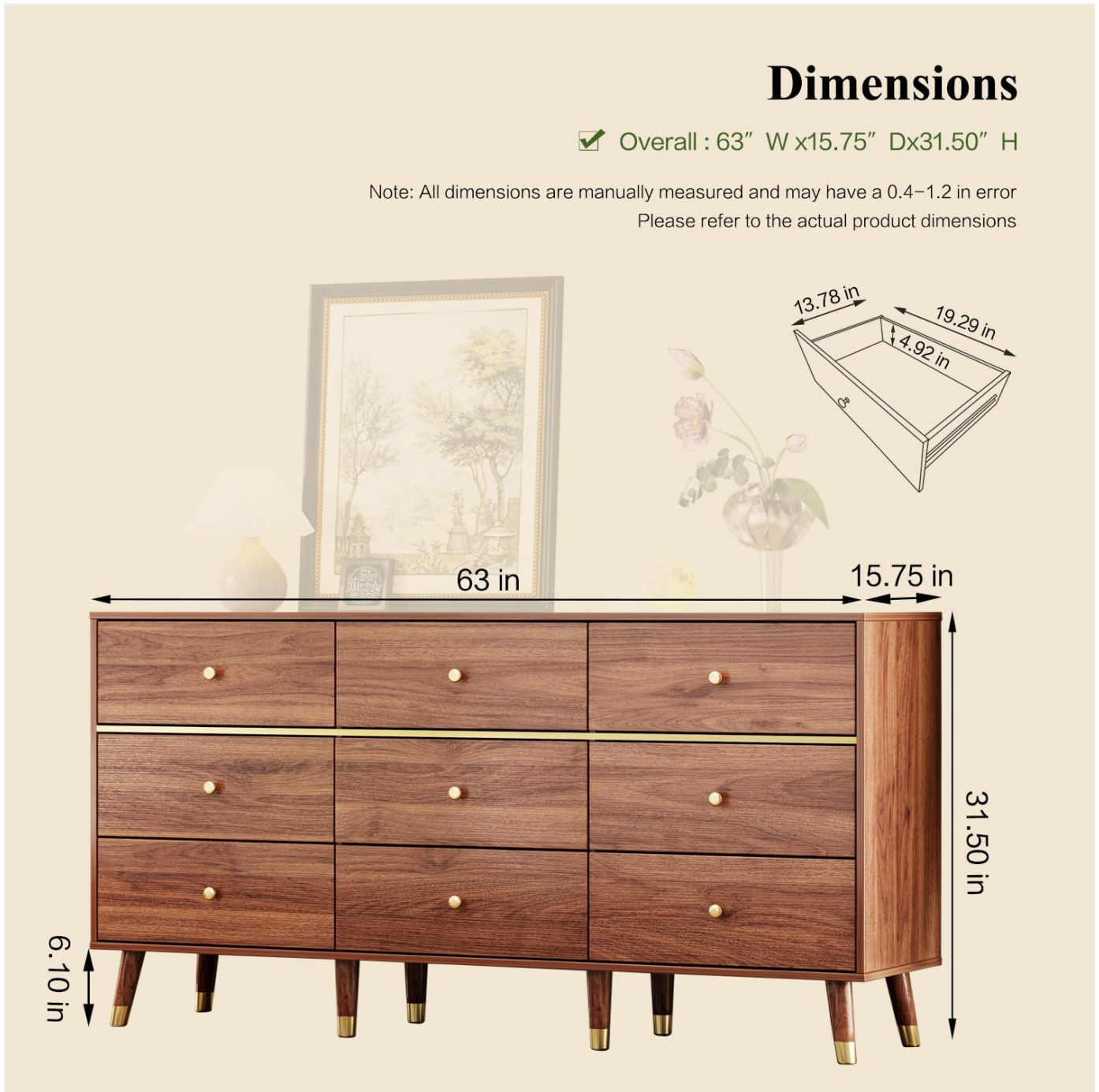
Image: A diagram illustrating the overall dimensions of the dresser: 63 inches wide, 15.75 inches deep, and 31.50 inches high. It also shows the height of the legs at 6.10 inches and a small inset diagram of a drawer's internal dimensions.

Note: All dimensions are manually measured and may have a 0.4–1.2 in error Please refer to the actual product dimensions