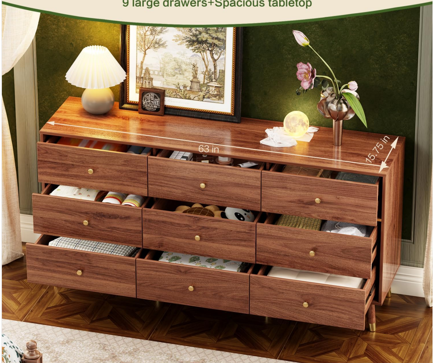
Image: The dresser with all nine drawers partially open, demonstrating the spacious storage capacity for various items like clothes, shoes, and accessories.