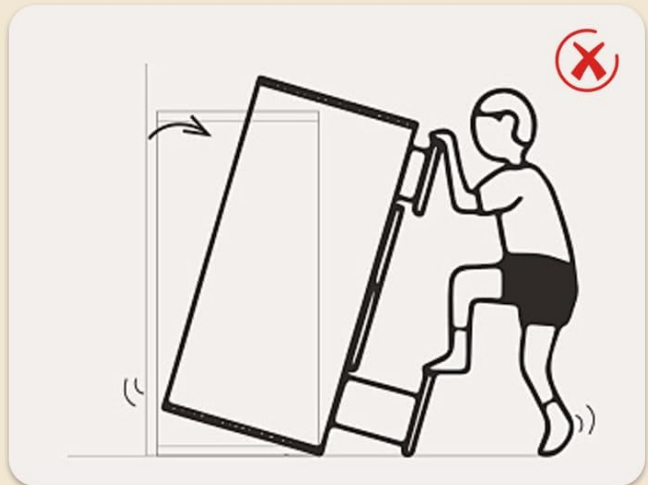
Image: Illustration of the anti-tipping device installation and a warning against climbing on the dresser. The left panel shows a person securing the dresser to the wall, marked with a checkmark. The right panel shows a child climbing on an unsecured dresser, marked with an 'X', indicating danger.