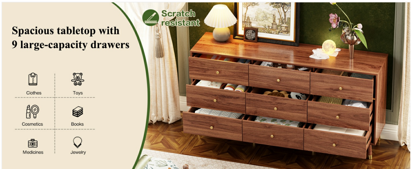
Image: The Chrangmay dresser positioned in a bedroom, serving as both a storage unit and a surface for decorative items, highlighting its versatile use.