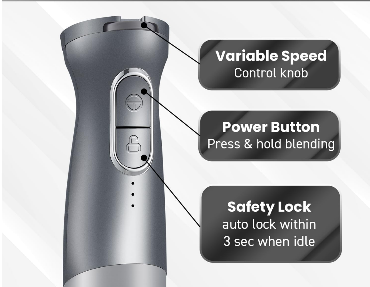
Figure 2: Control panel featuring variable speed dial, power button, and safety lock.