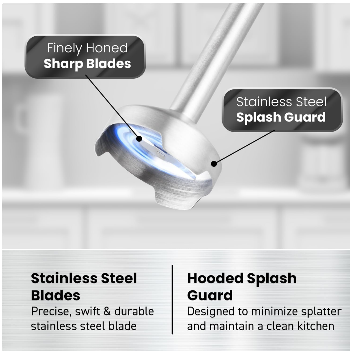
Figure 7: Stainless steel blades and splash guard for effective blending and easy cleaning.

4. Drying: Ensure all parts are completely dry before reassembling or storing.