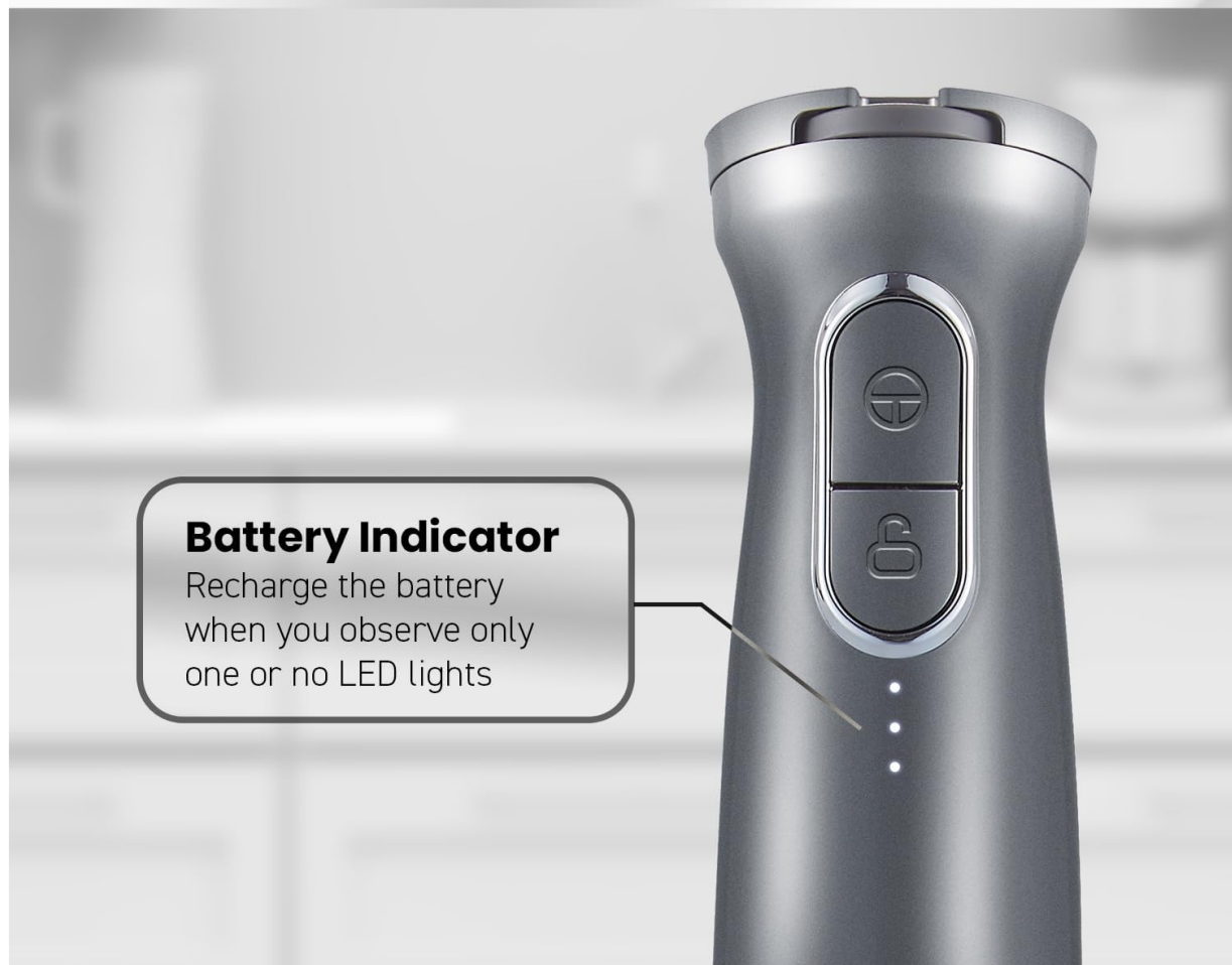
Figure 4: Battery indicator lights on the motor unit.

Rechargeable Li-ion 2000mAh Power Source