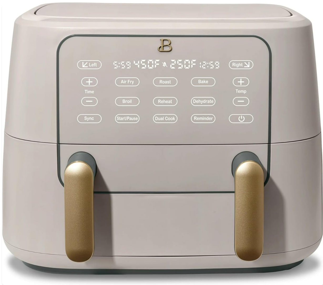
Image: The Beautiful 9 QT TriZone Air Fryer, showcasing its sleek design and touch-activated display.