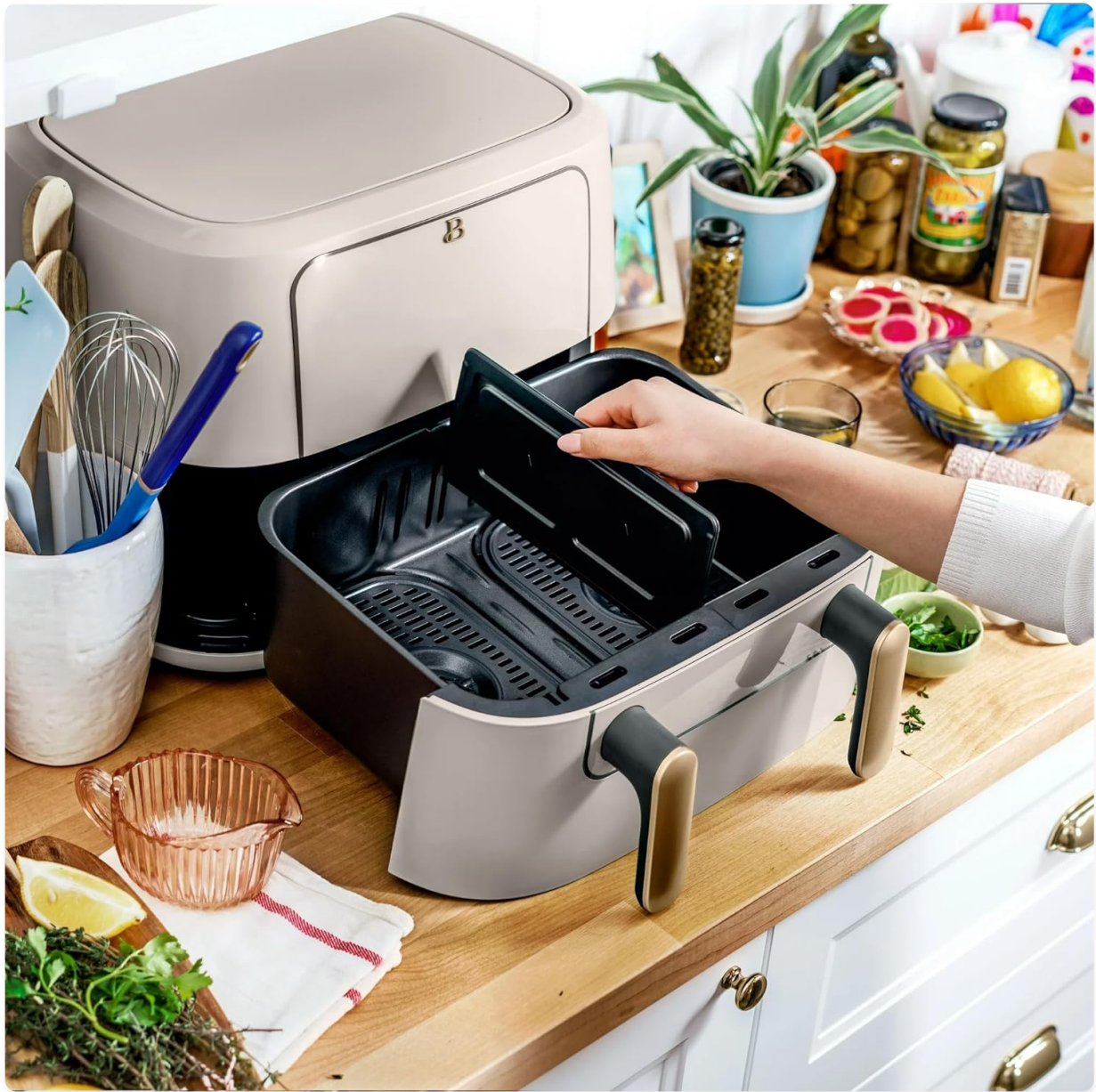
Image: The removable divider and crisping trays, highlighting their ease of removal for cleaning.