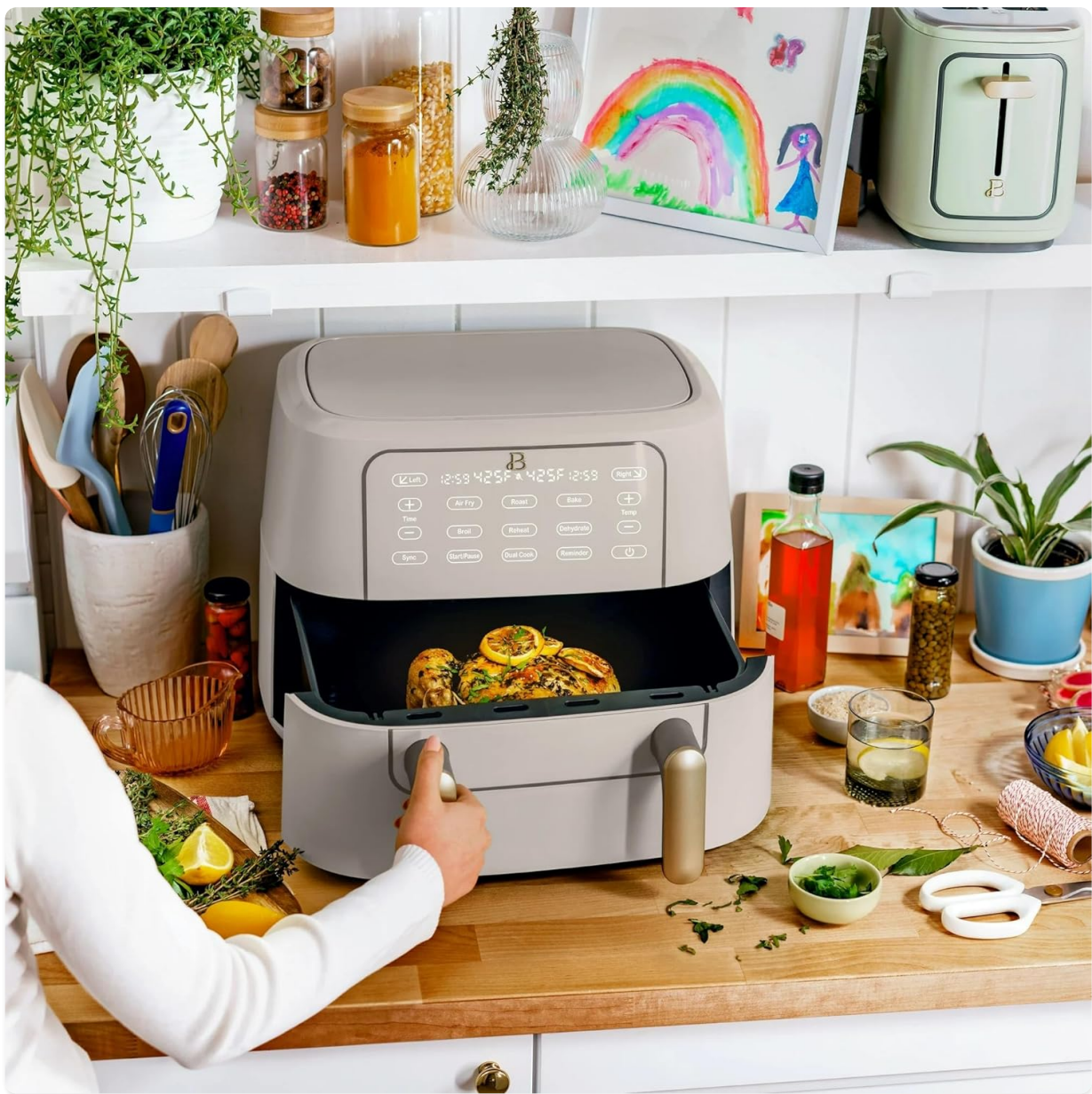
Image: The air fryer's basket with the removable divider, illustrating its dual cooking zone capability.