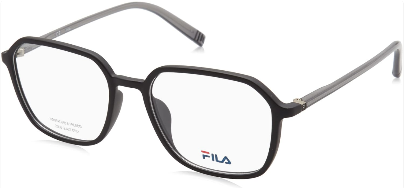
Image: Front view of the FILA Unisex Sunglasses, Model VFI202, showcasing the matt black frame and clear lenses. The Fila logo is visible on the lower right lens.

This manual provides essential information for the proper use, care, and maintenance of your FILA Unisex Sunglasses, Model VFI202. Please read this manual thoroughly before using your new eyewear to ensure optimal performance and longevity.