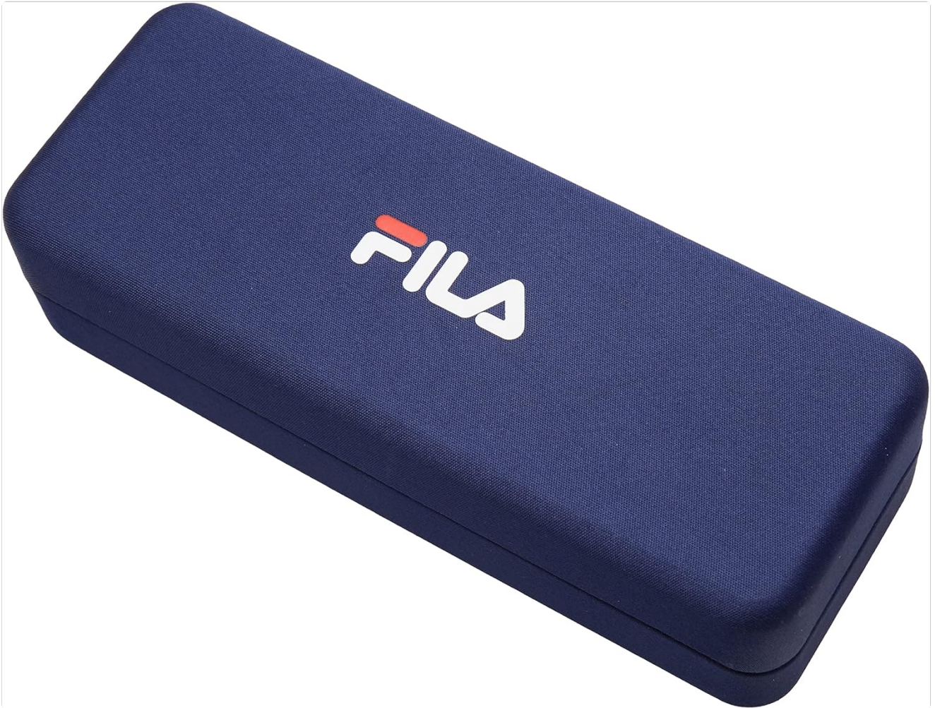
Image: The protective blue case for FILA sunglasses, featuring the Fila logo on the lid. This case is designed to keep your eyewear safe when not in use.