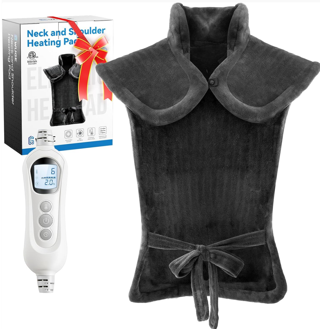
Figure 1: WUGE Heating Pad, Controller, and Packaging