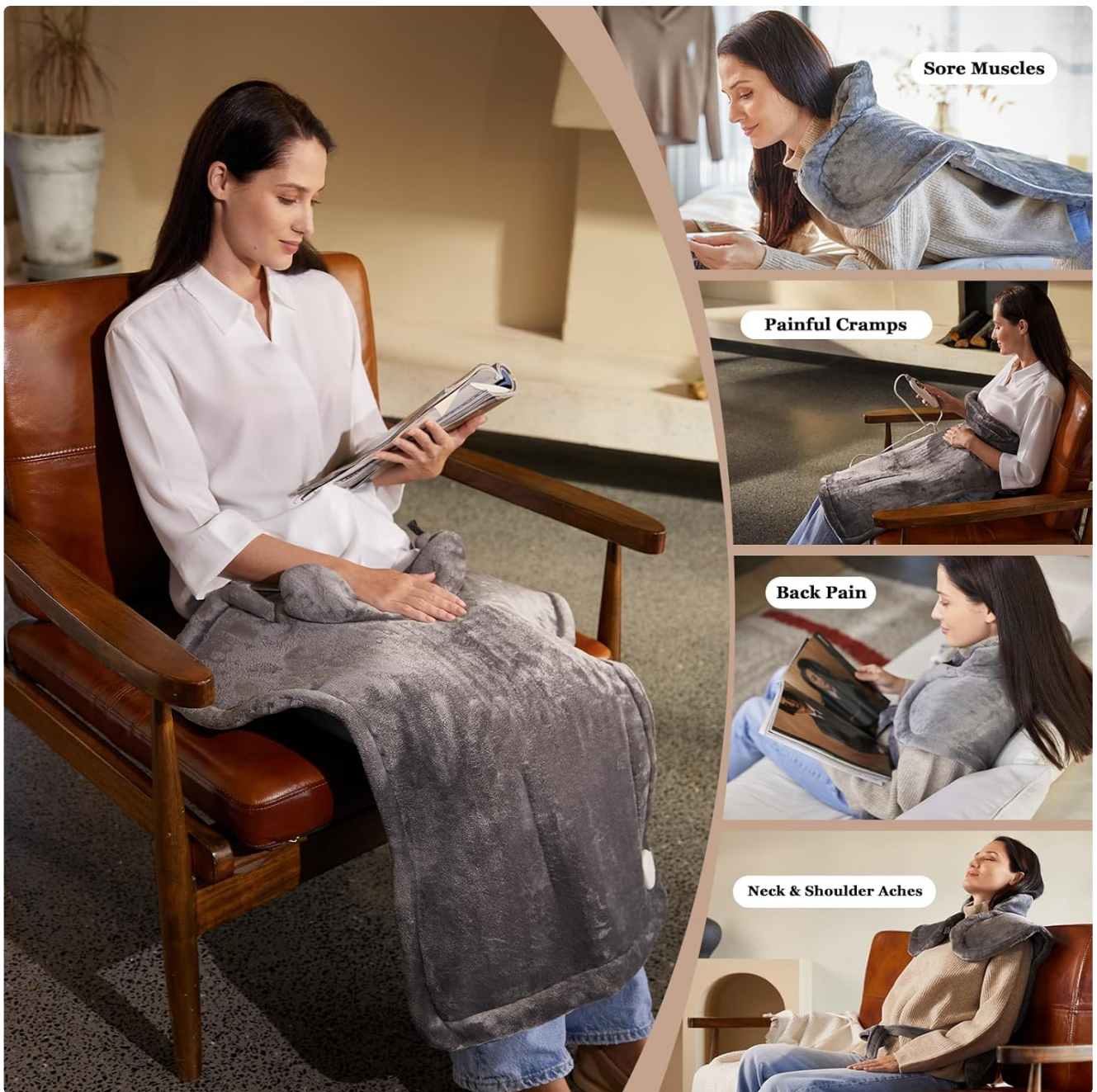
Figure 6: Comfortable and Form-Fitting Design