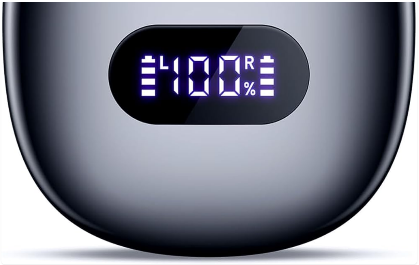
Image: The bmani Wireless Bluetooth Earbuds in their charcoal charging case, displaying a digital battery percentage.

Your browser does not support the video tag.