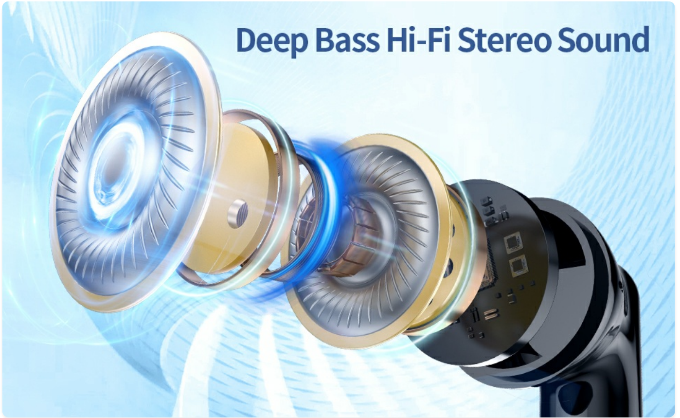
Image: An exploded diagram showcasing the intricate components of the earbud's audio driver, designed for deep bass and high-fidelity stereo sound.