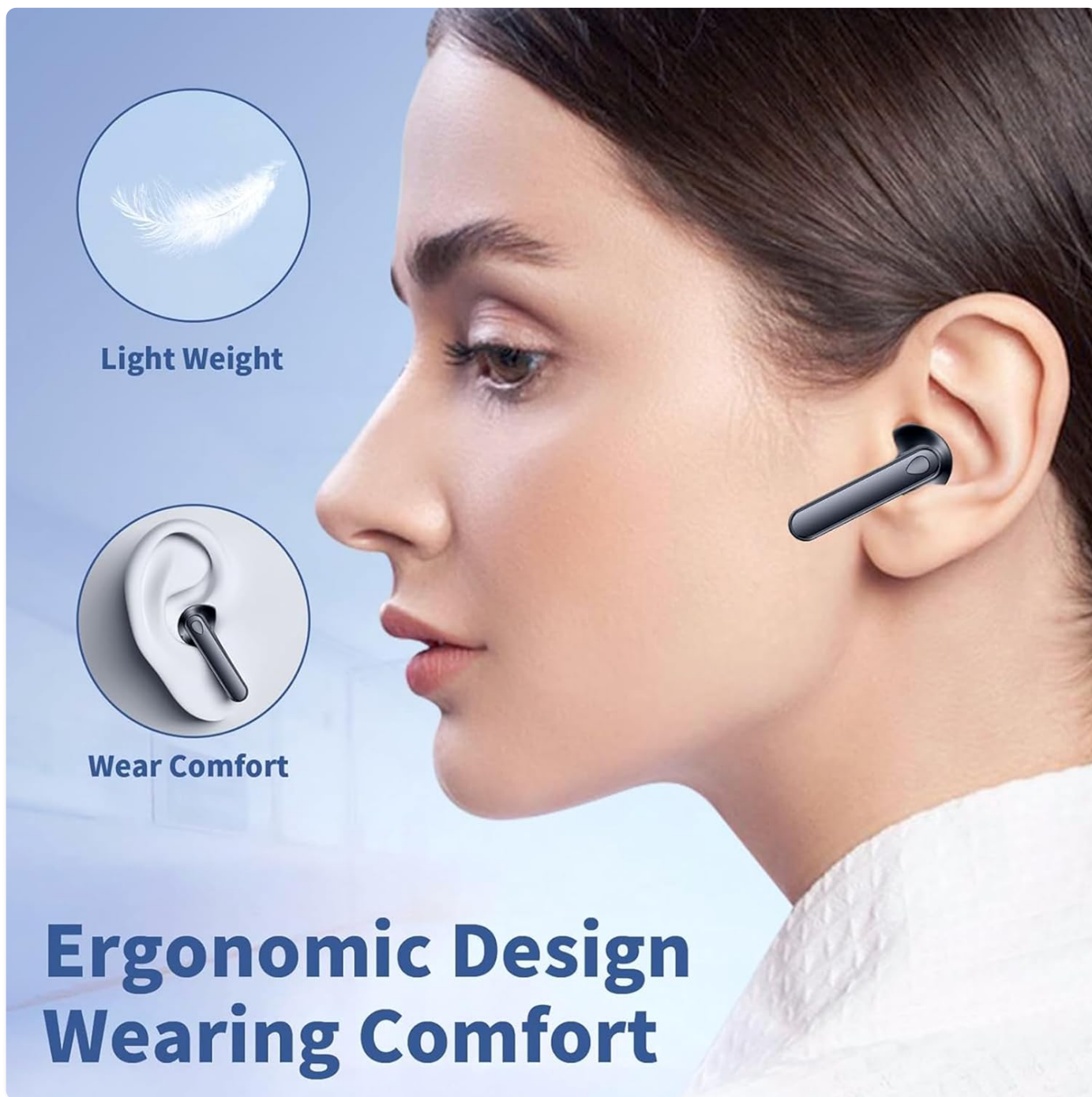
Image: A woman wearing a bmani earbud, highlighting its lightweight nature and ergonomic design for comfortable wear.