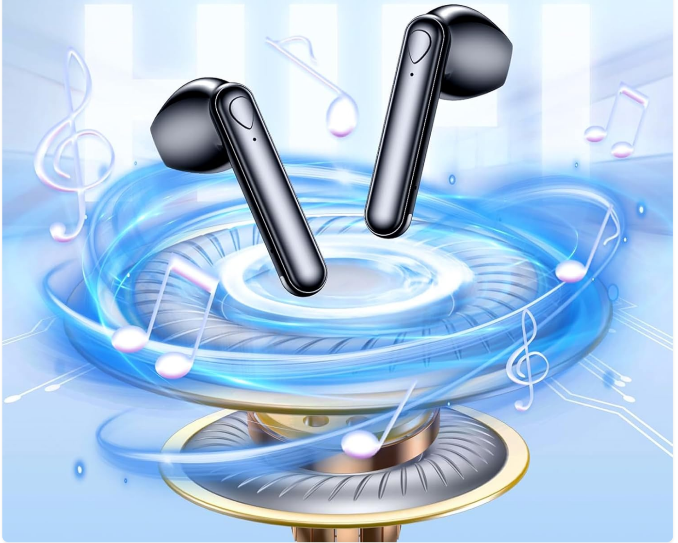
Image: Illustration of the earbuds' internal components, emphasizing the 13mm dynamic driver for deep bass and crystal treble, delivering HiFi Stereo Sound.

13mm dynamic driver produce deep bass & crystal treble