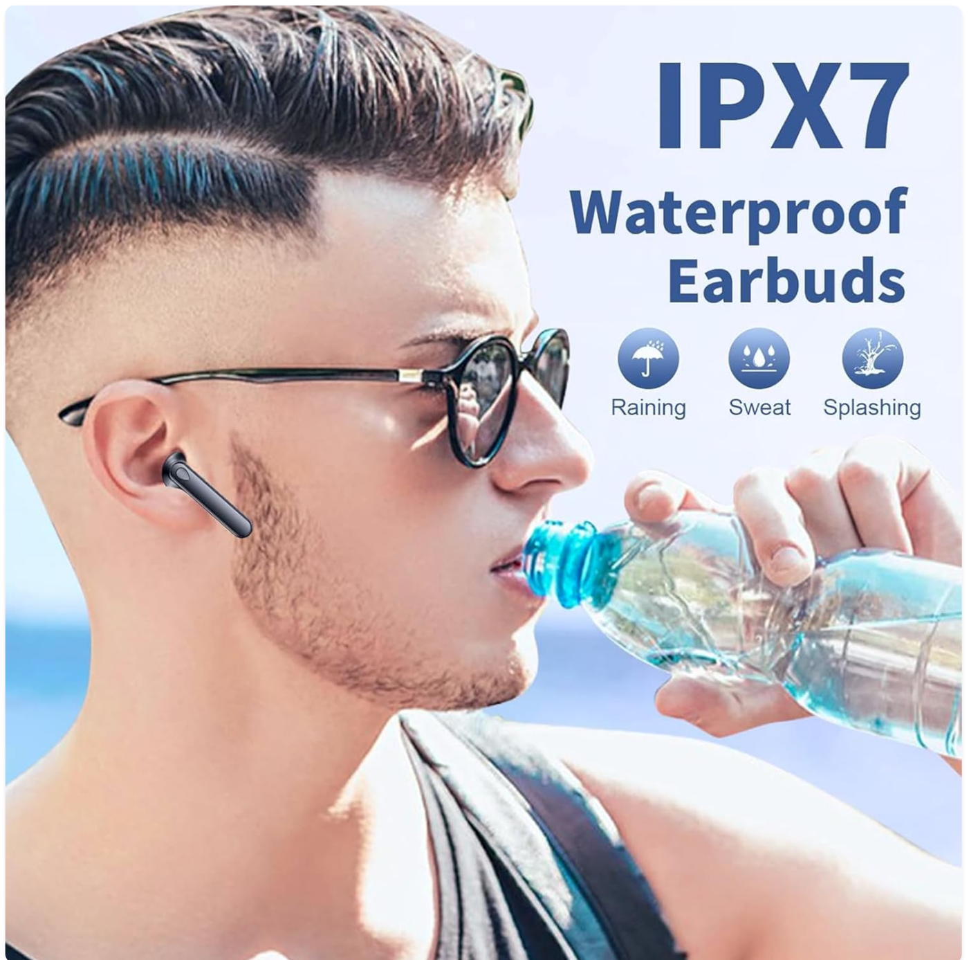
Image: A man wearing the earbuds while engaging in an activity, demonstrating their IPX7 waterproof capability against rain, sweat, and splashing.