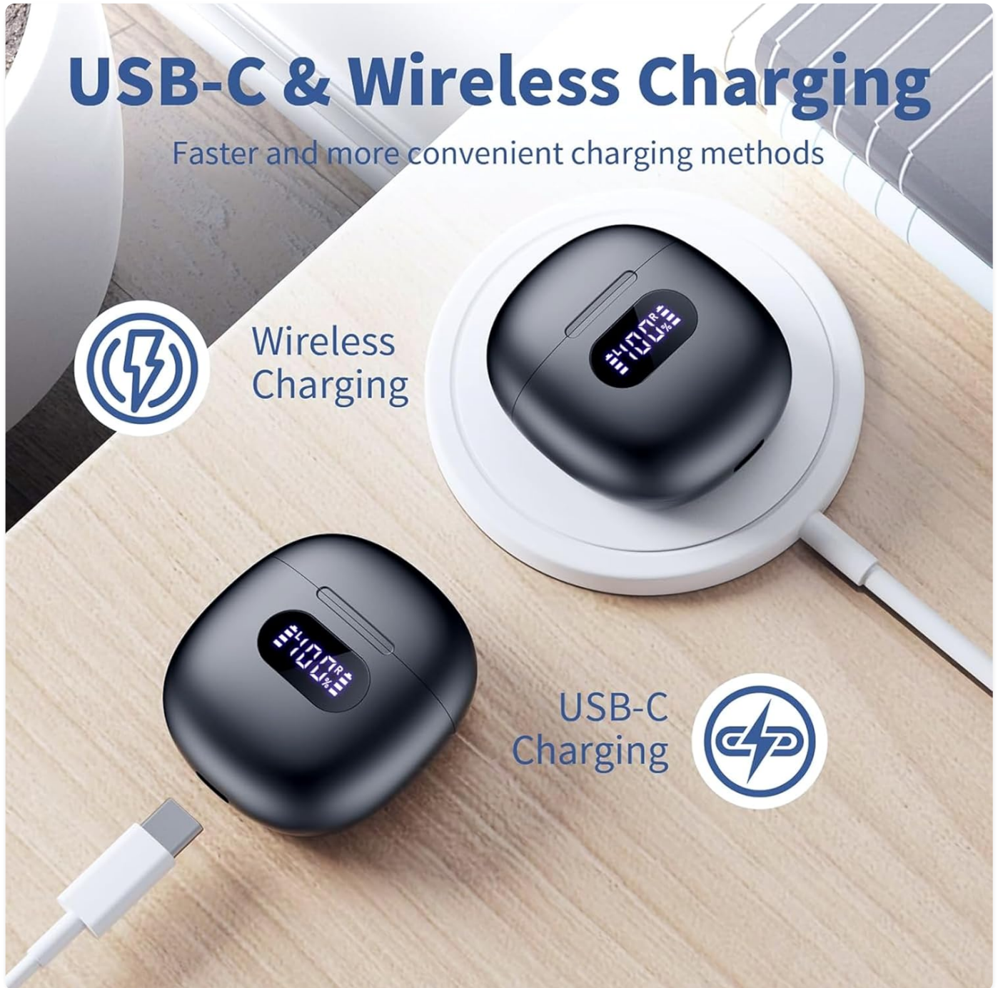
Image: The bmani earbud charging case being charged via a USB-C cable and simultaneously on a wireless charging pad, demonstrating both charging methods.