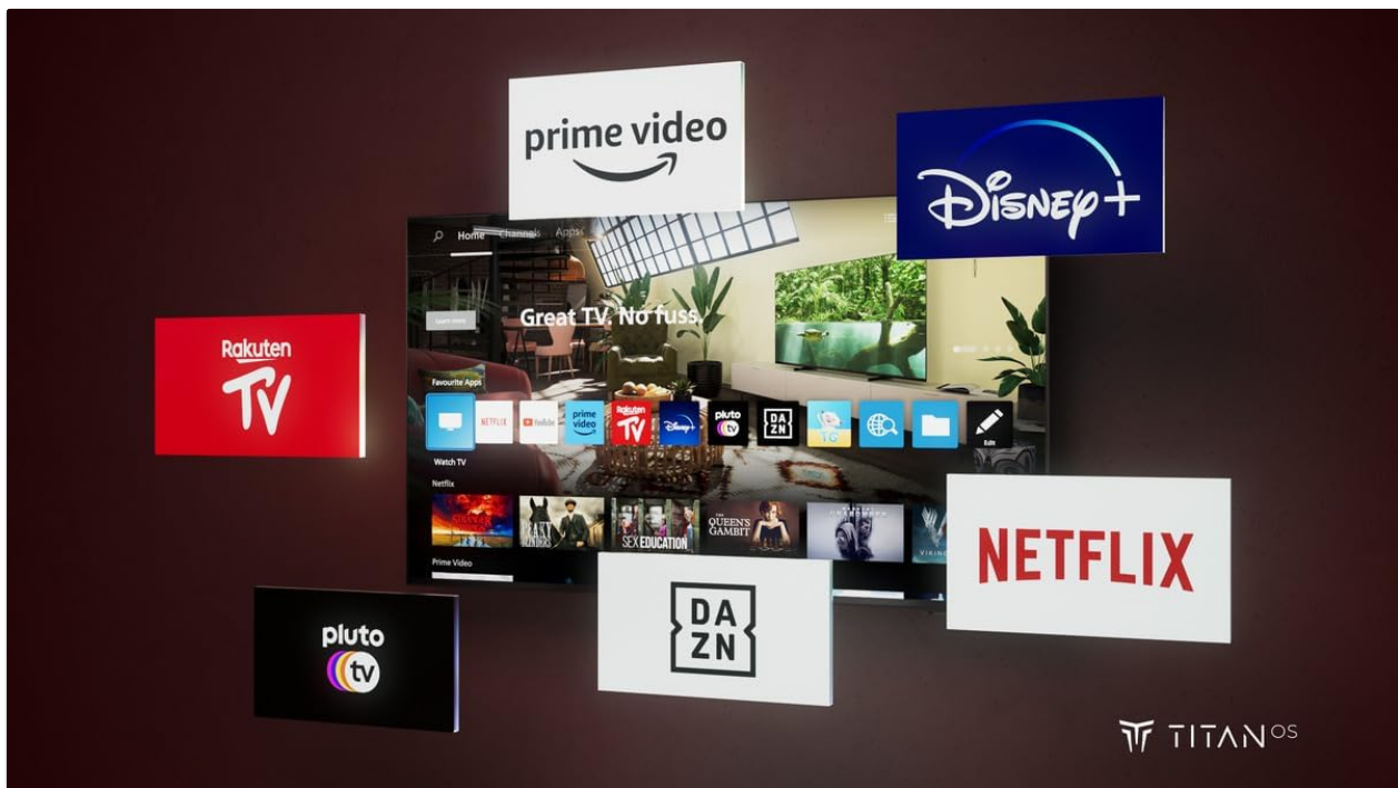
Image: The Titan OS smart TV interface, displaying logos of popular streaming applications such as Netflix, Prime Video, Disney+, Rakuten TV, Pluto TV, and DAZN.