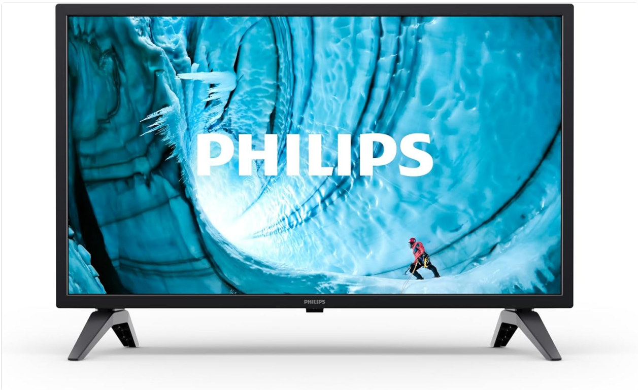
Image: Front view of the Philips 24PHS6019 Smart HD LED TV, showcasing its slim black bezel and the Philips logo at the bottom center.