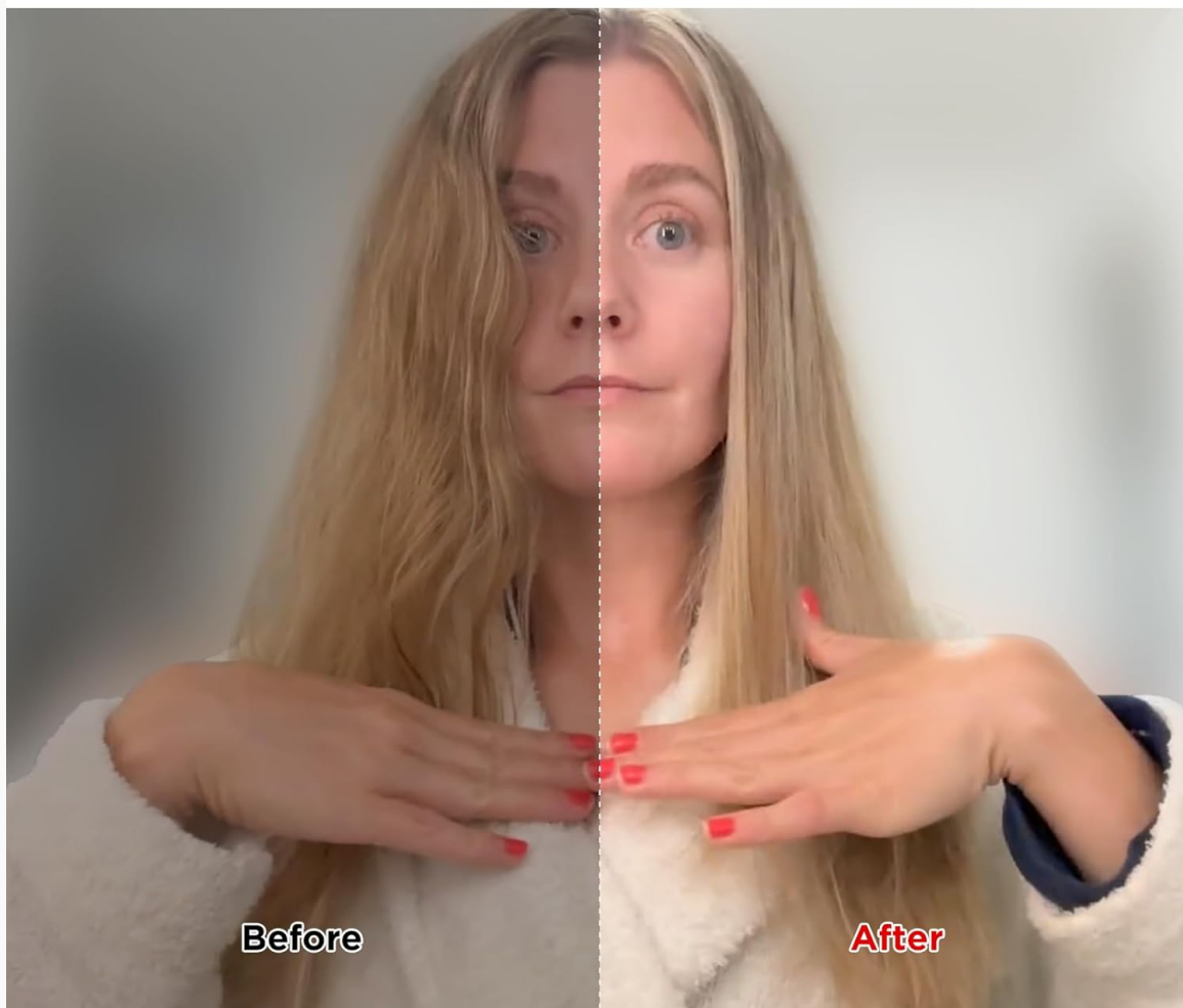
Image: A split image showing hair before and after using the IG INGLAM Air Straight, demonstrating a naturally straight blow-out with reduced frizz.

Say goodbye to frizz and hello to effortlessly sleek hair