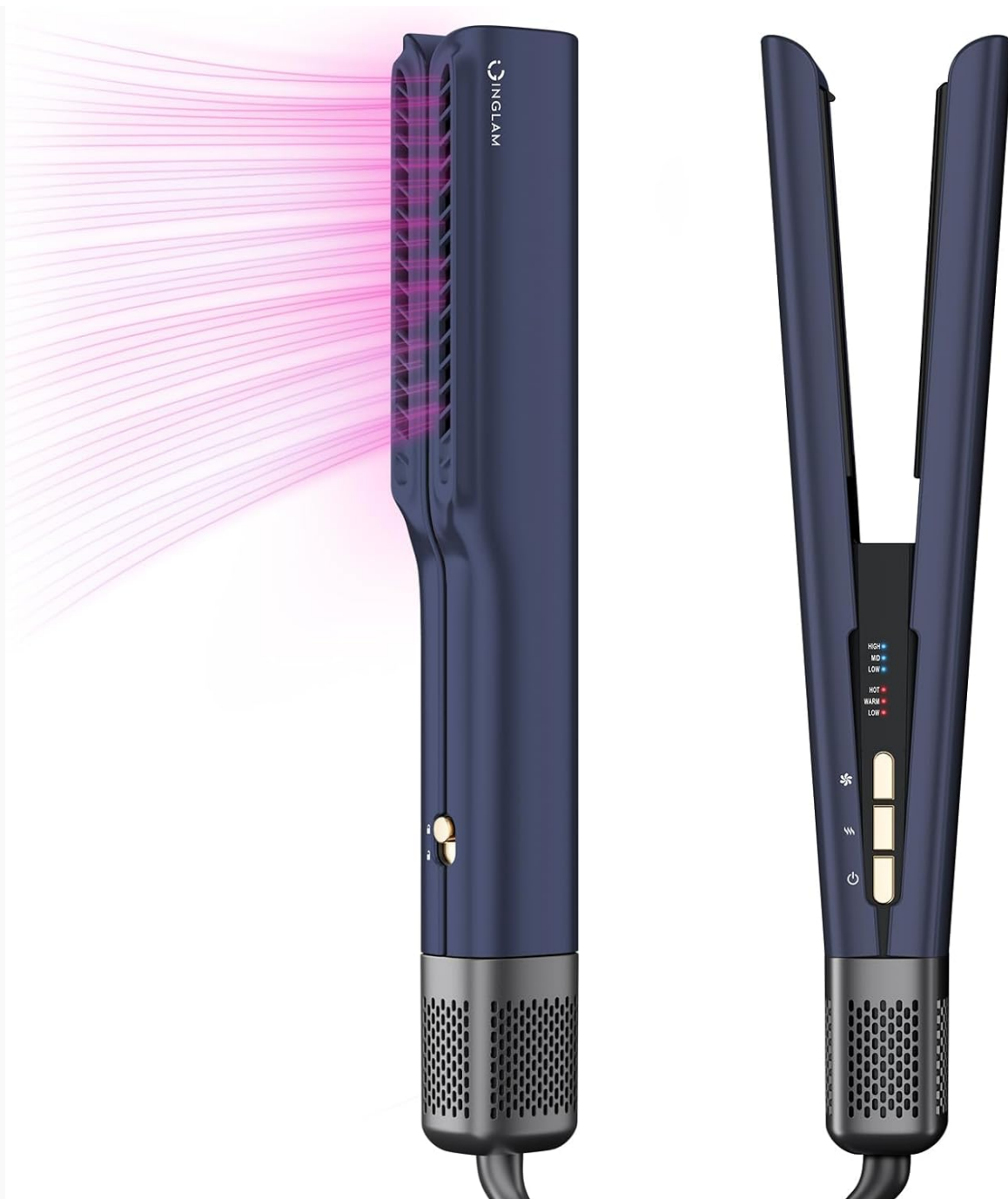
Image: The IG INGLAM Air Straight device, showcasing its unique design and airflow vents.