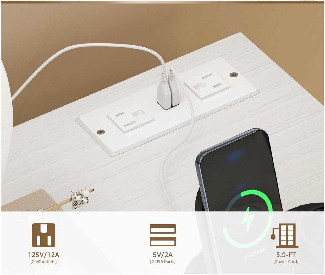
Image: Close-up view of the built-in power strip, highlighting the AC outlets and USB ports.