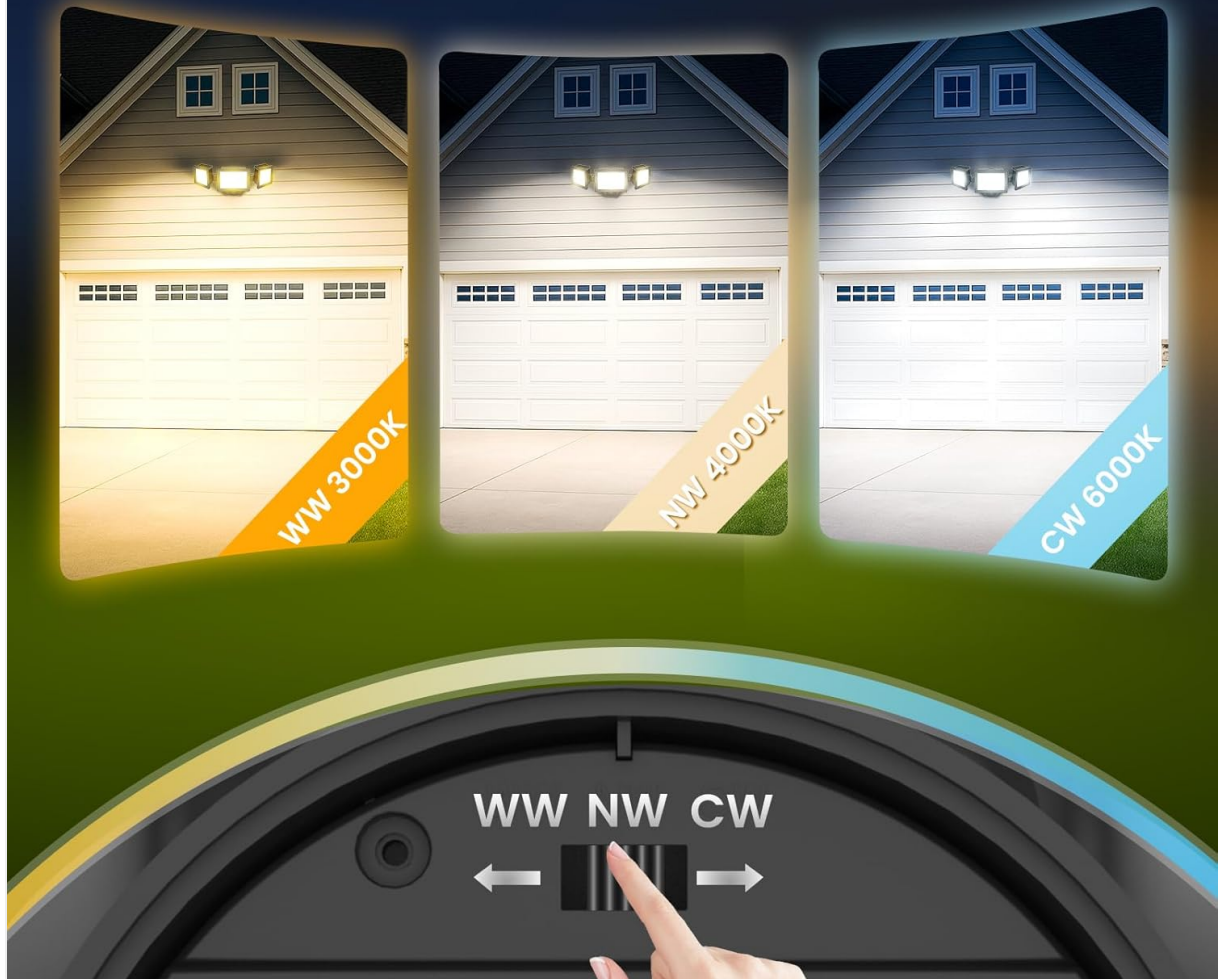
Image: Adjusting the color temperature switch on the light fixture.