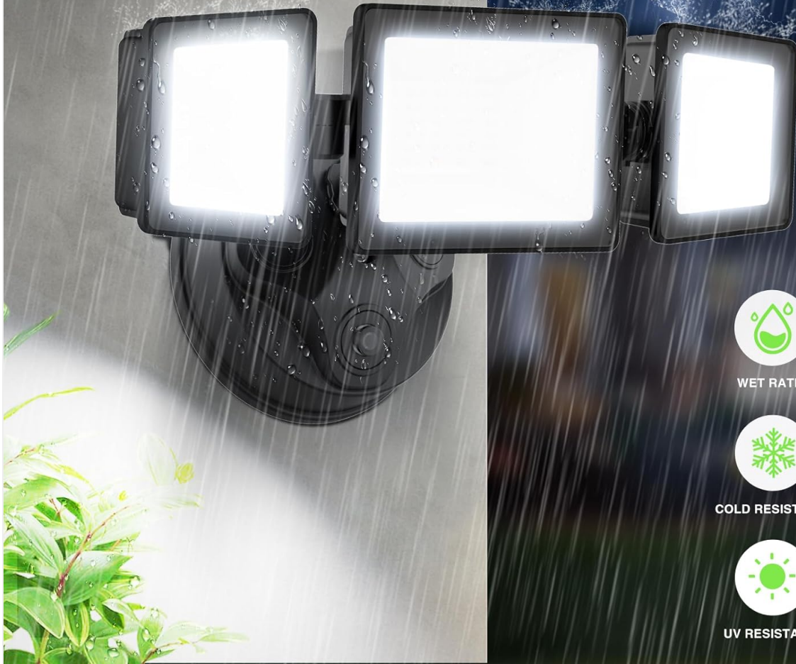
Image: The adjustable light heads allow for precise direction of illumination and motion detection.