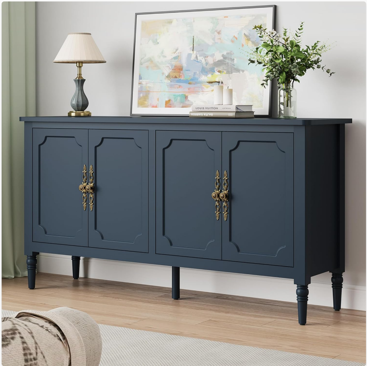
Image 1.1: The RoyalCraft Large Sideboard Buffet Cabinet, showcasing its elegant design and navy blue finish.

Constructed with premium MDF and solid wood, the cabinet is designed for durability and stability. The exterior is finished with lead-free P2 paint, ensuring water resistance and easy maintenance. It features adjustable shelves for customizable storage and a 5.5-inch clearance at the base for effortless cleaning.