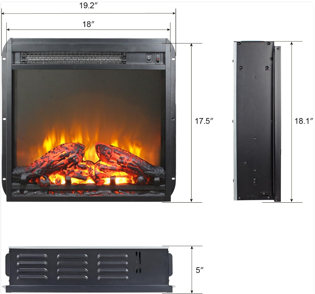
Detailed dimensions of the fireplace insert, including width, height, and depth, to assist with installation planning.