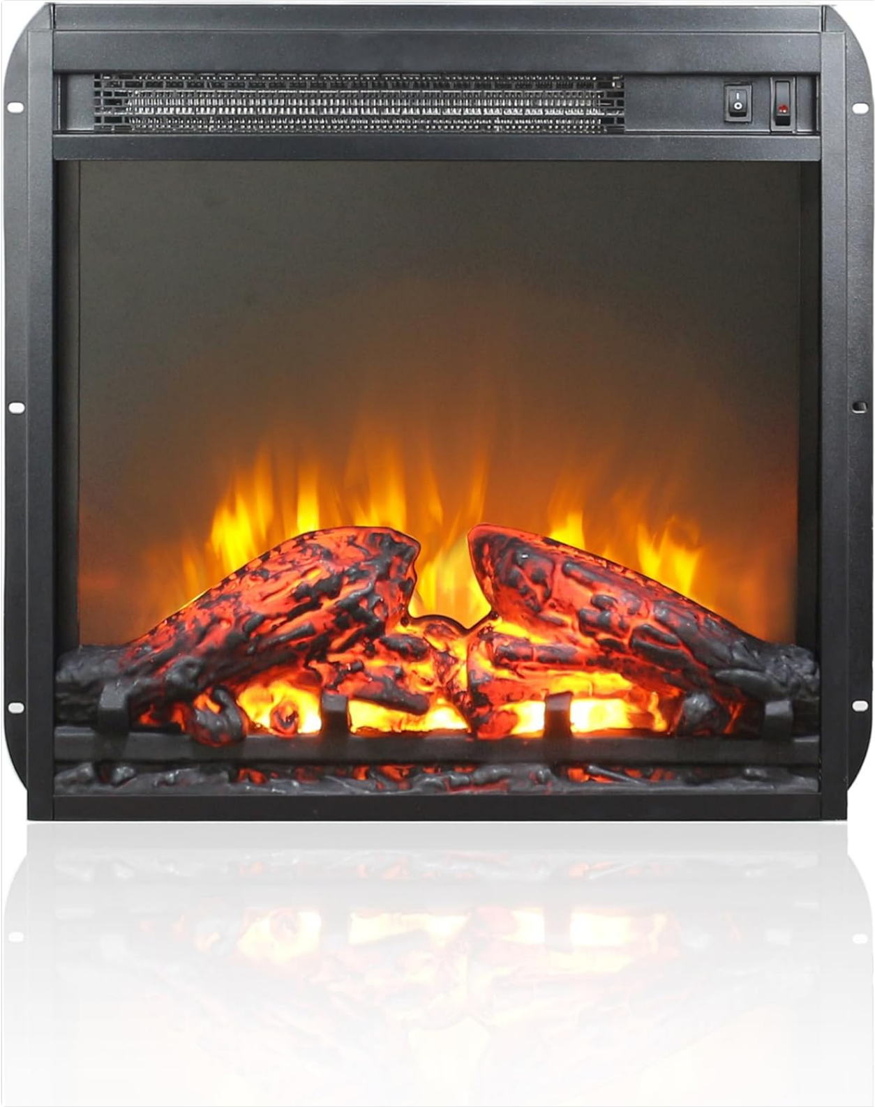
Front view of the WAQINBR 18-Inch Electric Fireplace Insert, showcasing the realistic flame effect and log set.