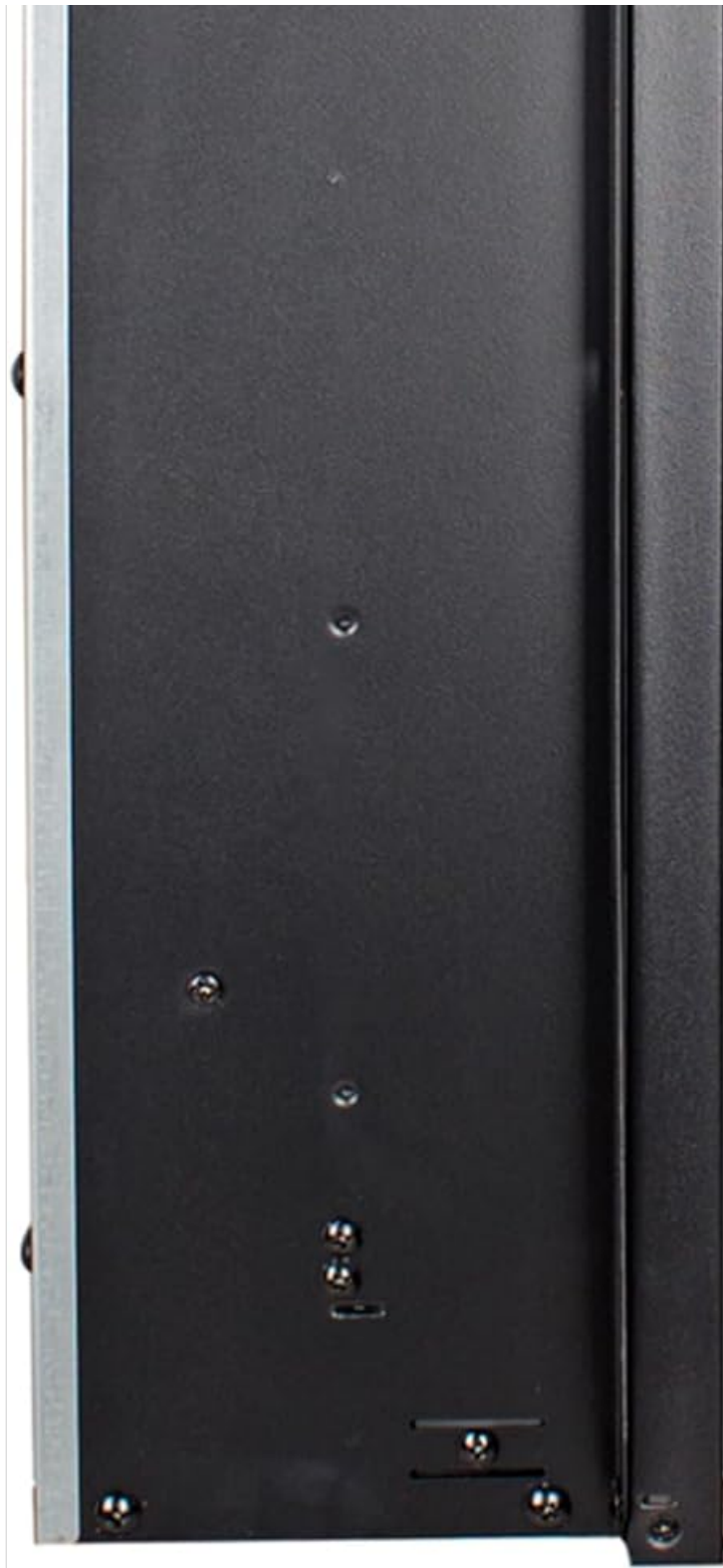
Side profile of the fireplace insert, highlighting the power cord and its connection point.