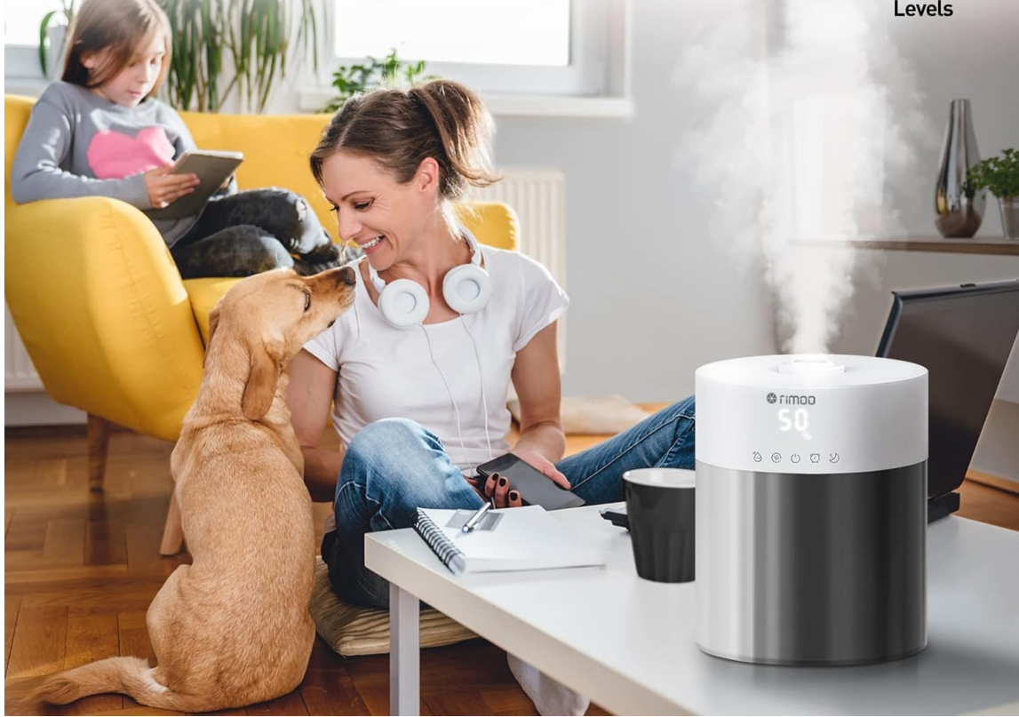
Image: RIMOO humidifier operating in a room, highlighting its quiet operation and mist output.