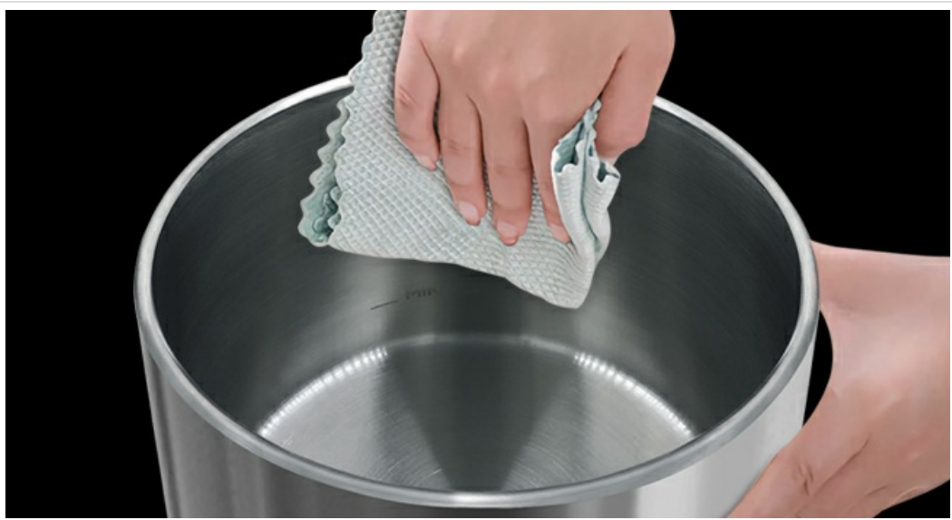
Image: A hand cleaning the interior of the wide-mouth stainless steel tank, emphasizing ease of access.