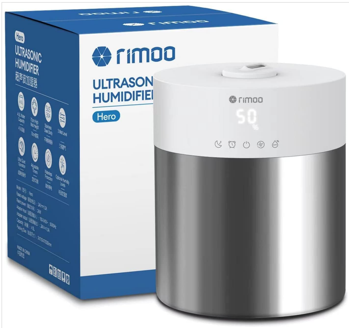
Image: RIMOO 4.5L Stainless Steel Humidifier and its packaging.