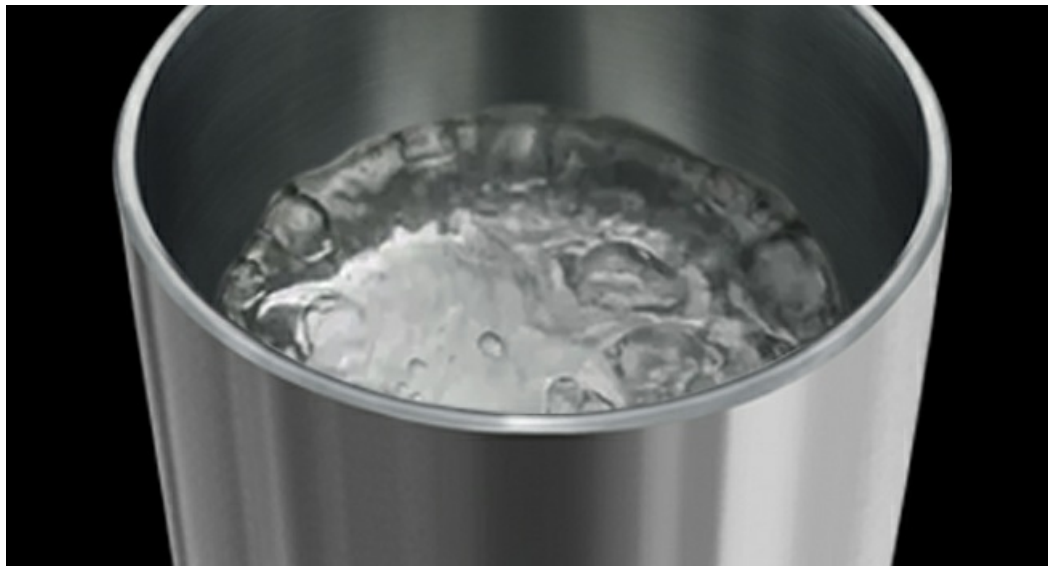
Image: Demonstrates the boiled cleaning method for the stainless steel water tank.