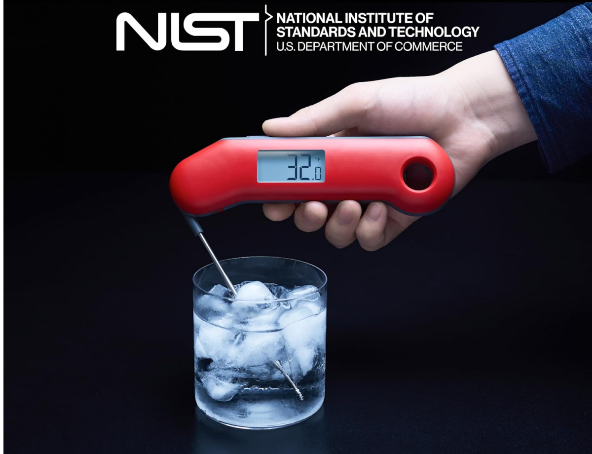
Figure 4: Unfolding the probe to activate the thermometer.

NIST NATIONAL INSTITUTE OF STANDARDS AND TECHNOLOGY U.S. DEPARTMENT OF COMMERCE