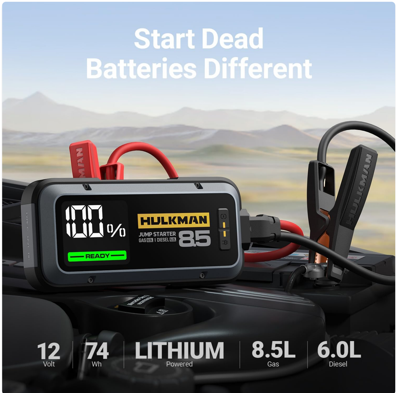
Image: The Hulkman Alpha85 jump starter displaying its readiness to start a vehicle, highlighting its capability for various engine types and its clear digital interface.

The Alpha85 is a powerful portable jump starter designed to safely and efficiently start vehicles with up to 8.5L Gas or 6.0L Diesel engines. It features a user-friendly 3.3-inch smart screen that provides real-time information on operational status, battery level, and potential errors, making the jump-starting process straightforward.