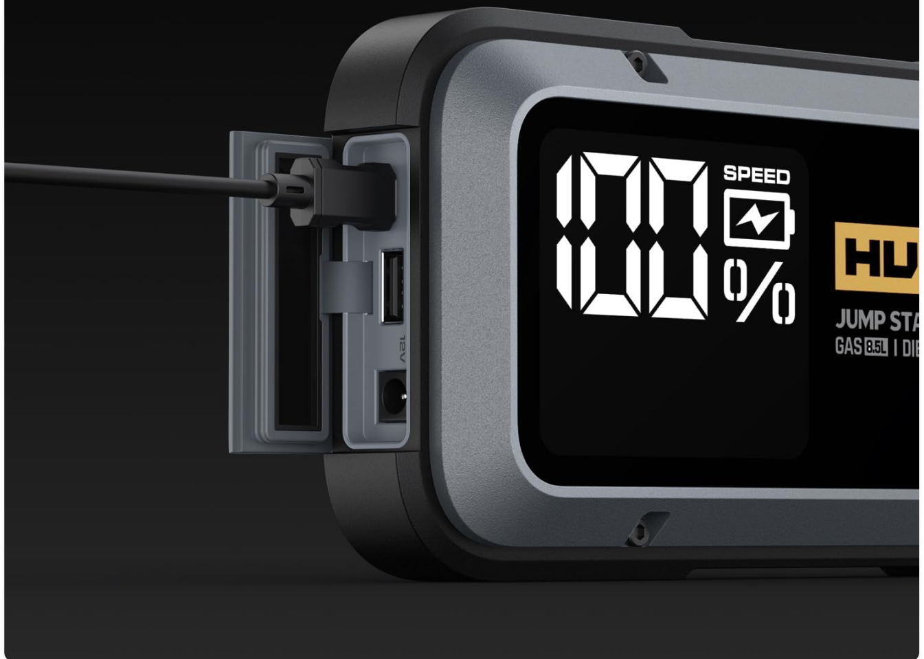
Image: The charging port of the Alpha85 jump starter, illustrating how to connect the charging cable for a full recharge, with the display showing charging status.