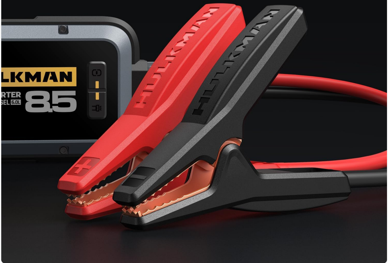
Image: The premium, heavy-duty clamps of the Alpha85 jump starter, designed for secure and safe connection to battery terminals.