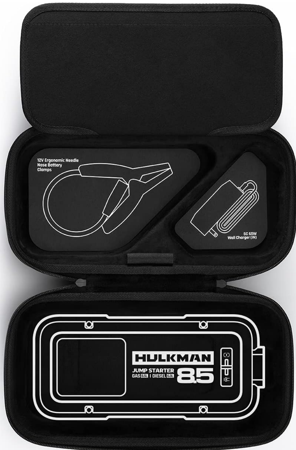
Image: Contents of the Hulkman Alpha85 and Sigma 5 package, including the jump starter, battery charger, and protective EVA case, showing how they fit together.