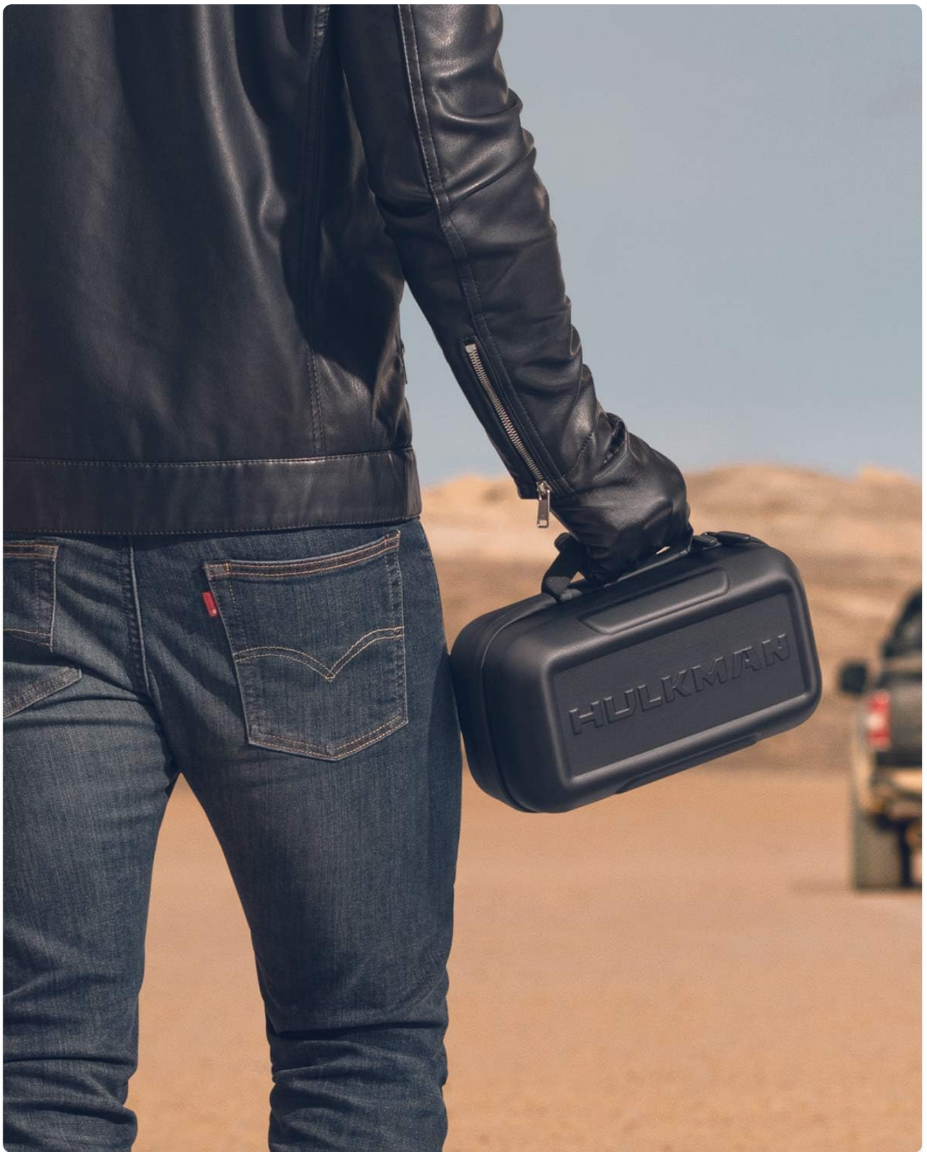
Image: The durable EVA protection case, ideal for storing and transporting your Hulkman devices, offering robust protection.