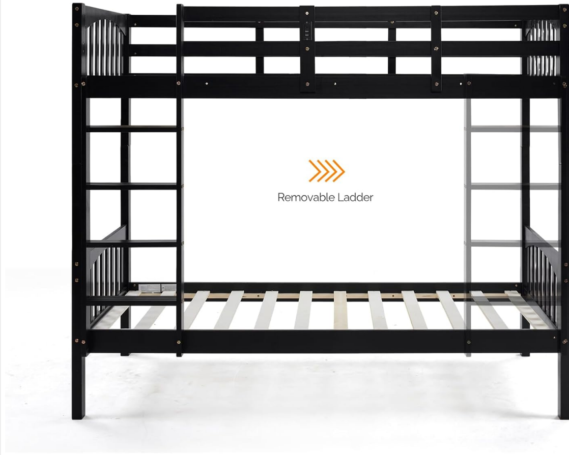
Image: The bunk bed demonstrating the removable ladder feature, which can be positioned on either the left or right side.