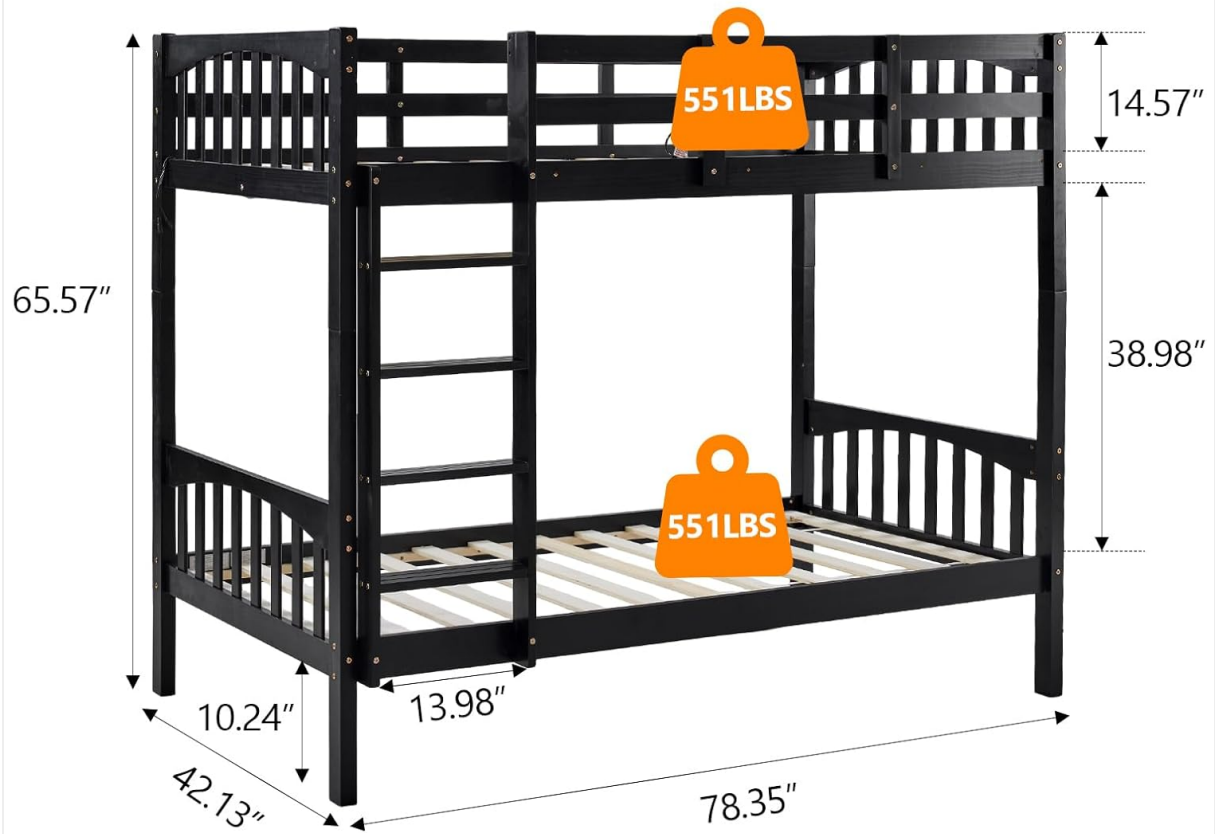
Image: Overall view of the VINGLI Twin Over Twin Bunk Bed in black finish, highlighting its compact design.