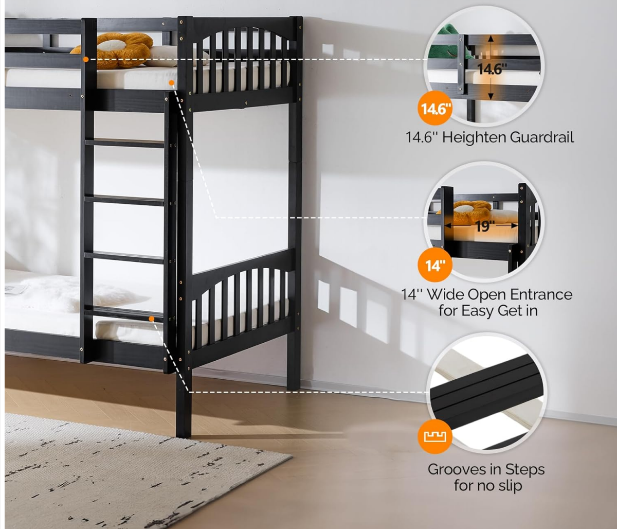
Image: Diagram illustrating safety features such as the 14.6-inch guardrail height and 14-inch wide open entrance for the ladder, with grooved steps for no-slip access.