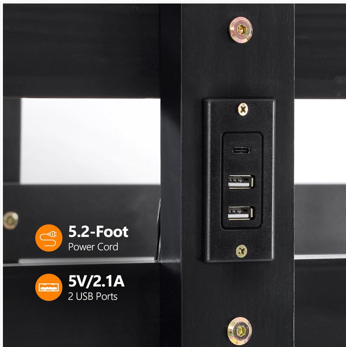
Image: Close-up of the integrated charging station on the bunk bed frame, featuring two USB ports and indicating a 5.2-foot power cord.