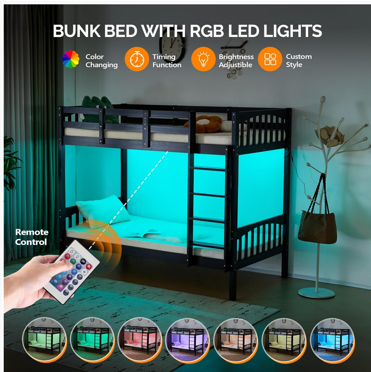
Image: The bunk bed illuminated with blue RGB LED lights, showing a hand holding a remote control to adjust settings.