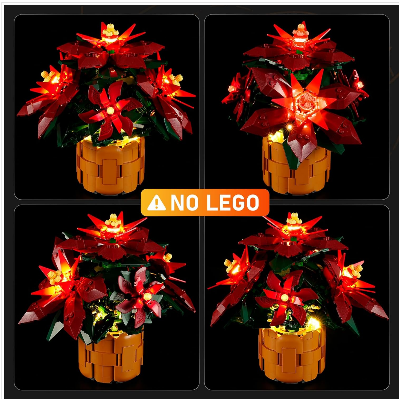
Image: A different angle of the lit LEGO Poinsettia, demonstrating the even distribution of light across the model.