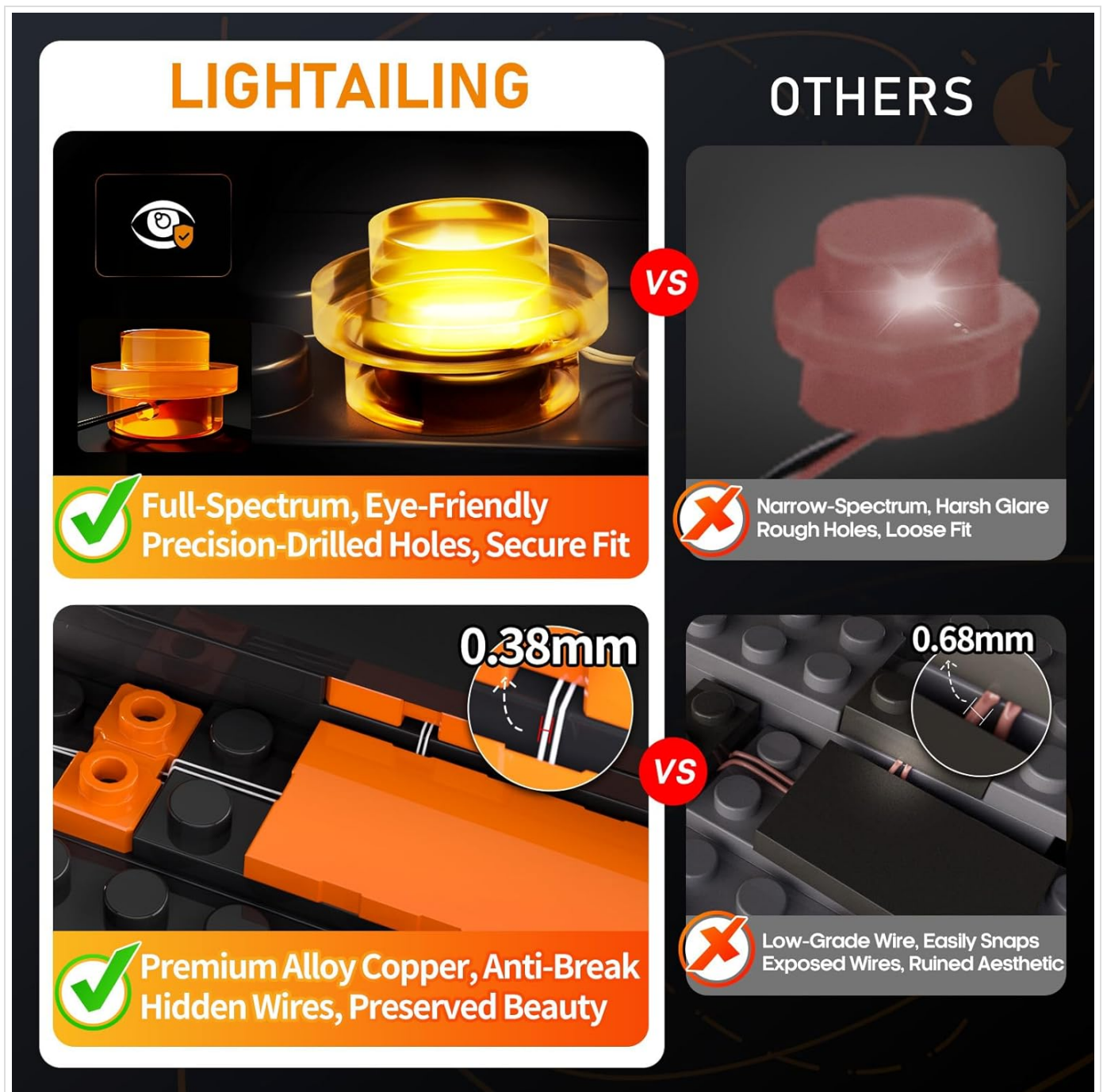
Image: A detailed comparison highlighting LIGHTAILING's full-spectrum, eye-friendly lights with precision-drilled holes and 0.38mm premium alloy copper wires, designed for secure fit and hidden integration.