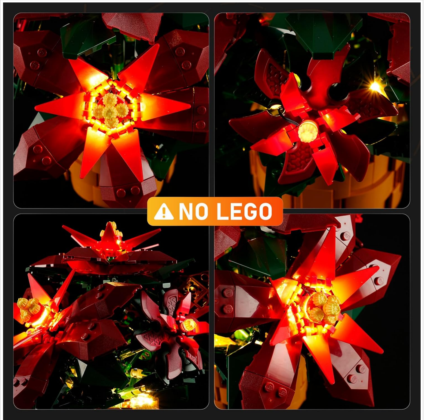
Image: A close-up view of the illuminated LEGO Poinsettia, showcasing the bright LED lights integrated into the flower's design.