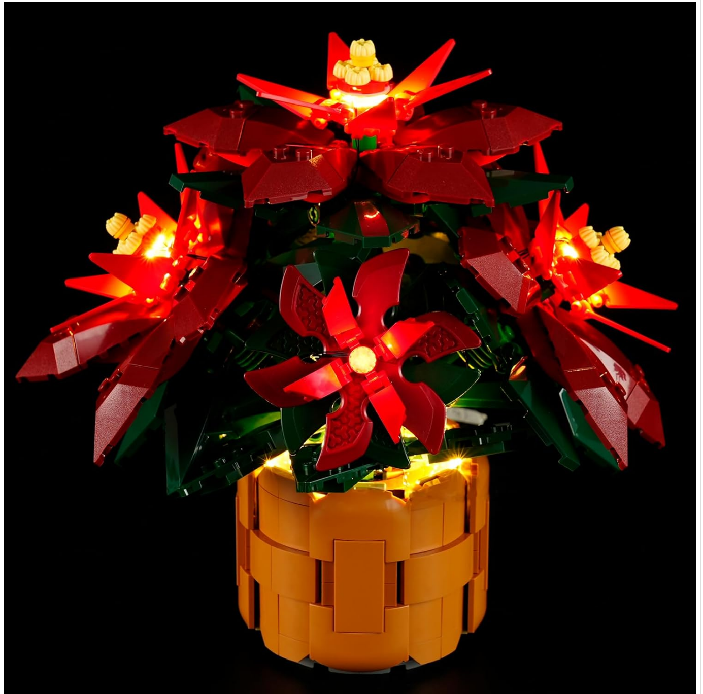
Image: The LIGHTAILING LED Lighting Kit illuminates the LEGO 10370 Poinsettia model, highlighting the red petals and yellow centers with vibrant light.

Follow the detailed step-by-step instructions provided in the paper manual. For visual guidance, an online installation video is also available.