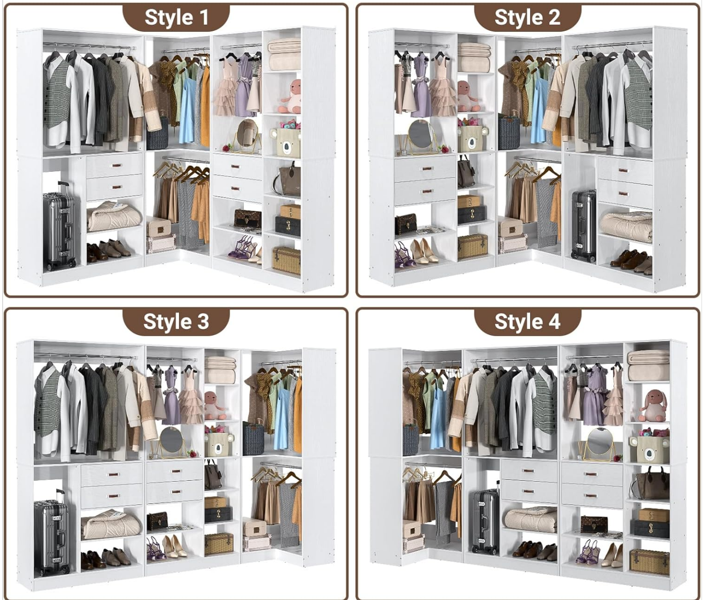
Figure 2: Various installation methods, illustrating how the modular units can be arranged.

Can be set up as a one multifunctional wardrobe or as 3 separate closet system