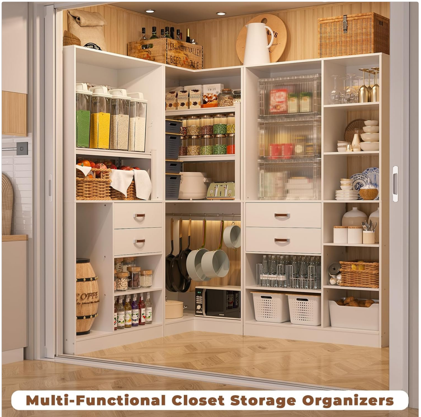
Figure 5: Example of the system's versatility, demonstrating its use as a multi-functional storage organizer.