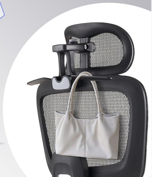
Image: A close-up of the chair's backrest, illustrating the built-in non-slip coat hangers with a small bag hanging from one.