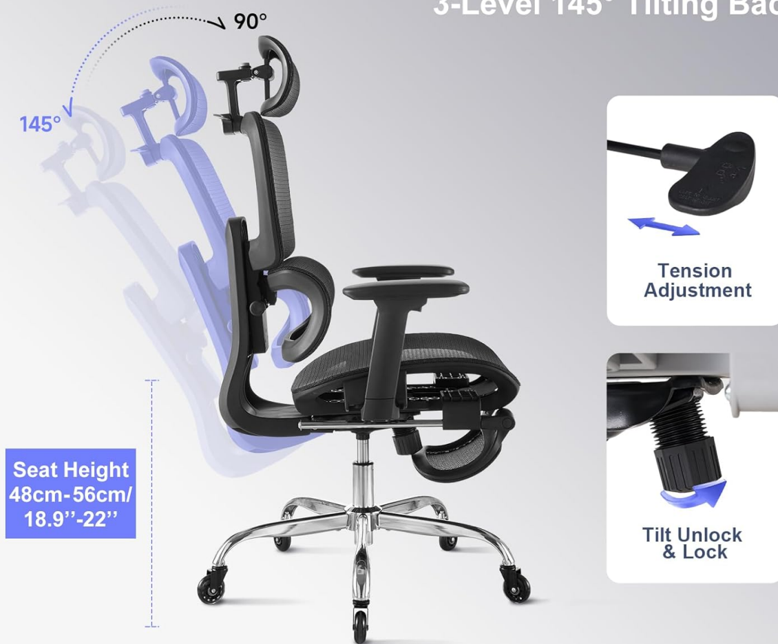
Image: The seat height adjustment lever and the tilt lock/unlock mechanism are visible on the underside of the seat. The image also illustrates the chair tilting back to 145 degrees.