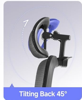
Image: Close-up of the headrest, illustrating its ability to move up/down, forth/back, and tilt, providing comprehensive neck support.