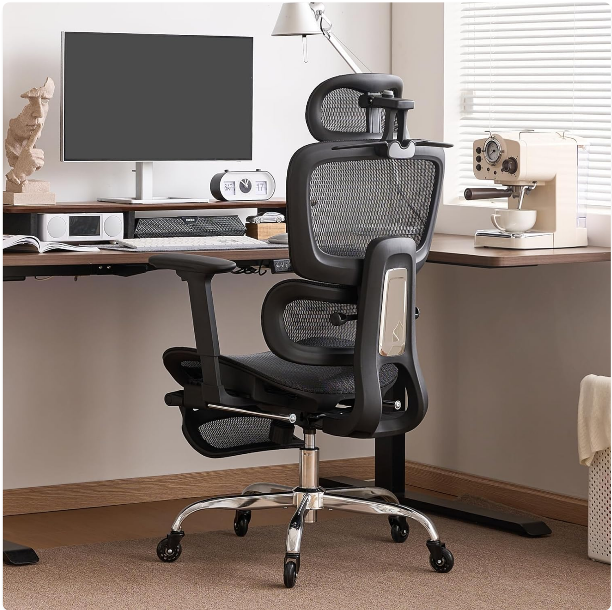
Image: The LarkLeaves L10-Pro-BK ergonomic office chair positioned at a desk in a modern office environment.