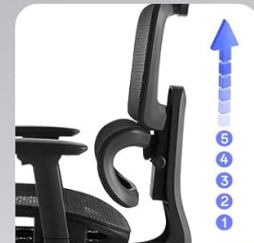
5-Level Height Adjustable Backrest