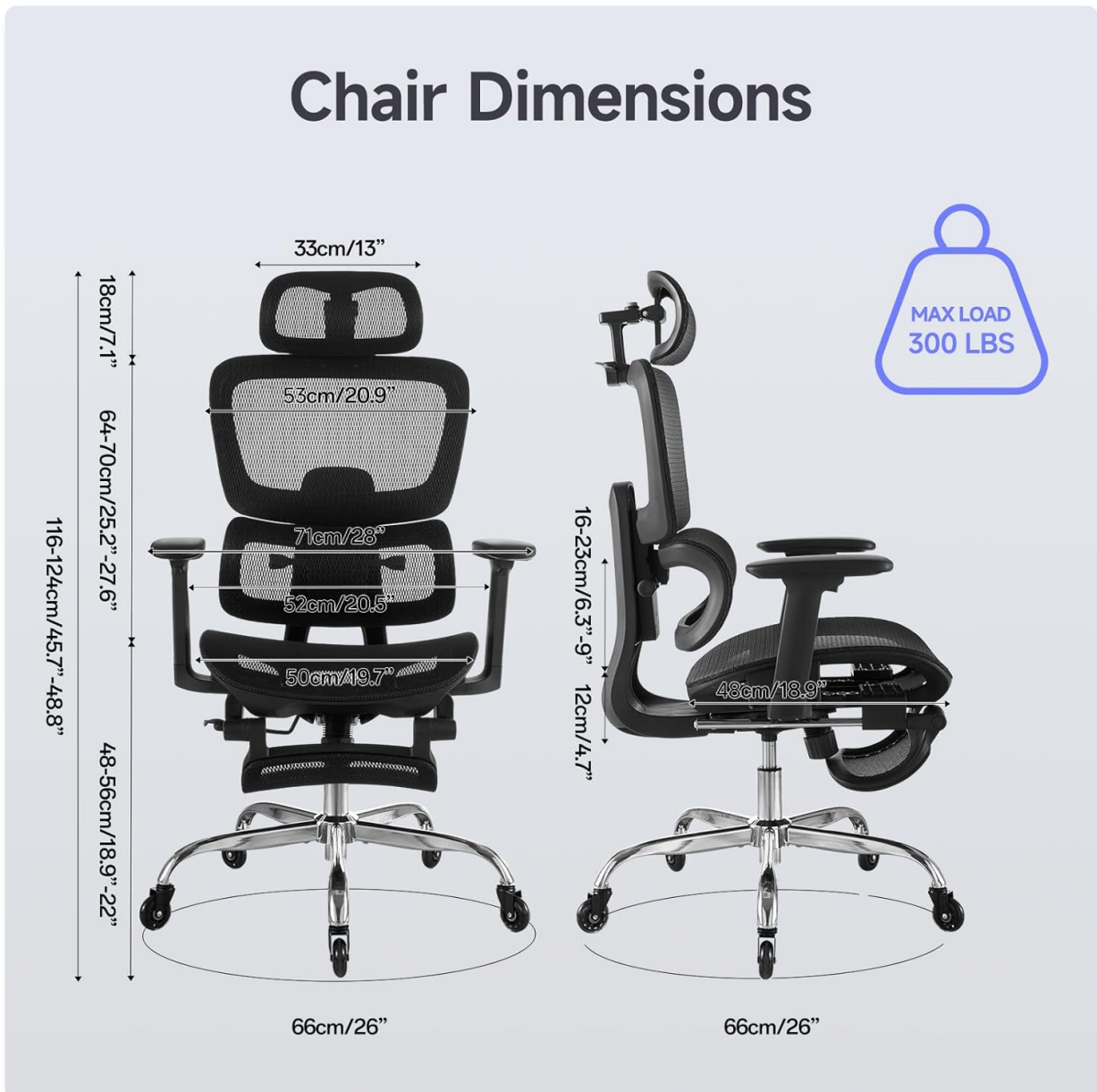
Image: A technical diagram illustrating the various dimensions of the chair, including seat height, backrest height, and overall width and depth, along with the maximum weight capacity.