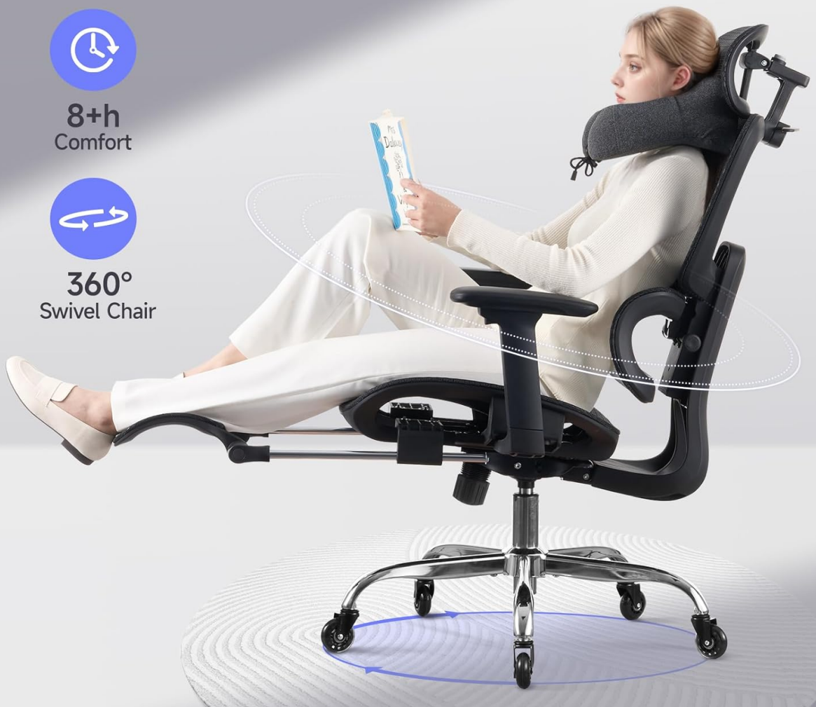
Image: A user reclining in the chair with the footrest extended, demonstrating the chair's comfort for extended periods and its 360-degree swivel capability.