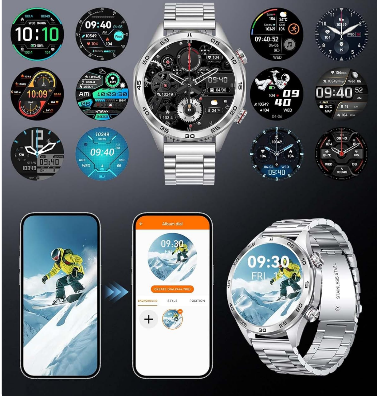
Image: A collection of diverse watch faces displayed on the smartwatch, demonstrating the variety of styles available. An illustration of the companion app interface shows how users can customize and apply new watch faces.