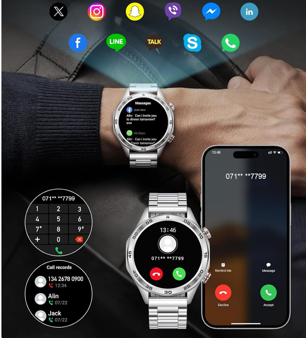
Image: A close-up of the smartwatch displaying an incoming call and a message notification. Various social media and communication app icons are shown above, indicating notification support.