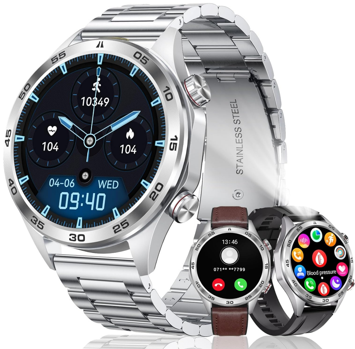
Image: The MEGALITH Smart Watch i118 displayed with its three interchangeable strap options: stainless steel, silicone, and leather. The watch face shows time, date, steps, and heart rate.