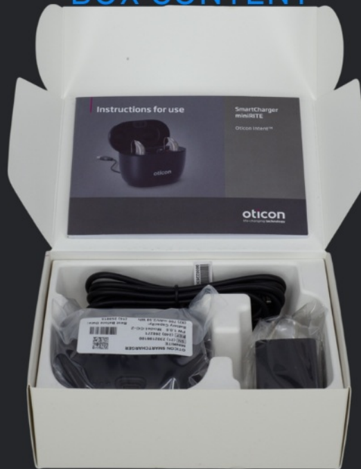
Figure 3.1: Contents of the Oticon Intent Smart Charger package.