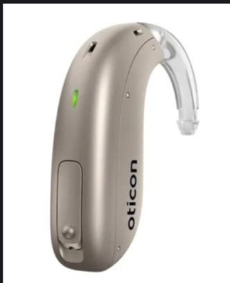
OTICON INTENT BTE HEARING AID

1- Oticon intent BTE is not compatible this intent desk charger 2-Oticon Real, More, Play ,Zircon, Opn S, Ruby and Opn Play rechargeable hearing aids is not compatible this intent desk charger