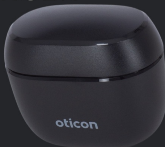
INTENT SMART CHARGER