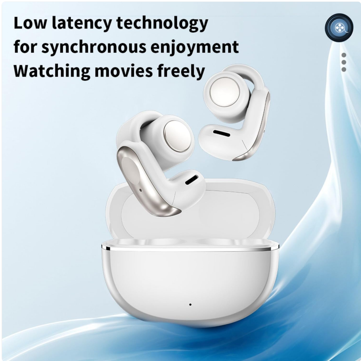
Image: The YX31 Open Ear Clip Wireless Earbuds shown inside their charging case.