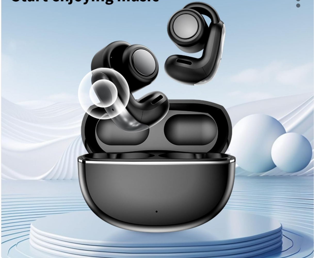
Image: The black YX31 earbuds in their charging case, highlighting the touch-sensitive surface for controls.