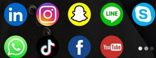
Figure 7: Bluetooth Call & Message Alerts