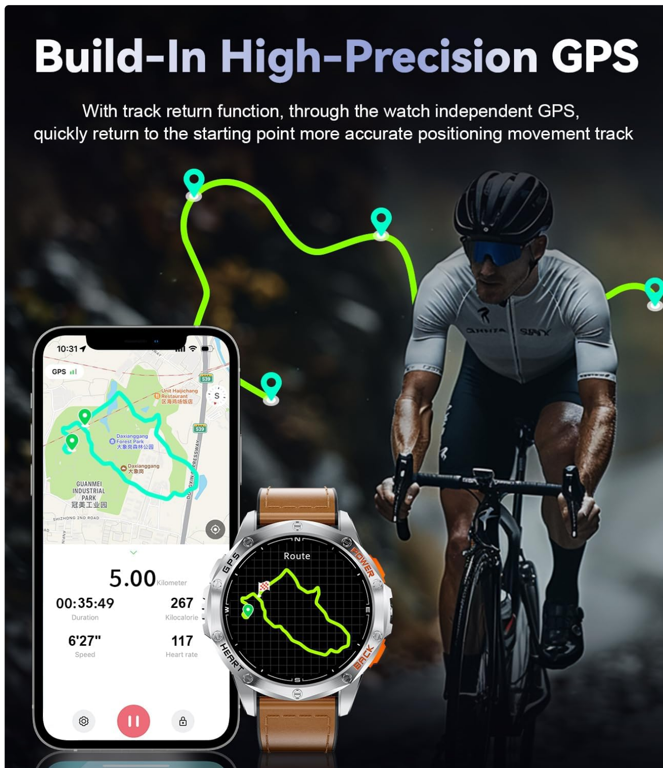
Figure 4: High-Precision GPS Tracking

The smartwatch includes built-in GPS and supports multiple satellite systems (GLONASS, Beidou, Galileo, NAVIC, QZSS) for accurate route tracking during outdoor activities. It also features a compass and barometric altimeter for enhanced navigation and environmental data.