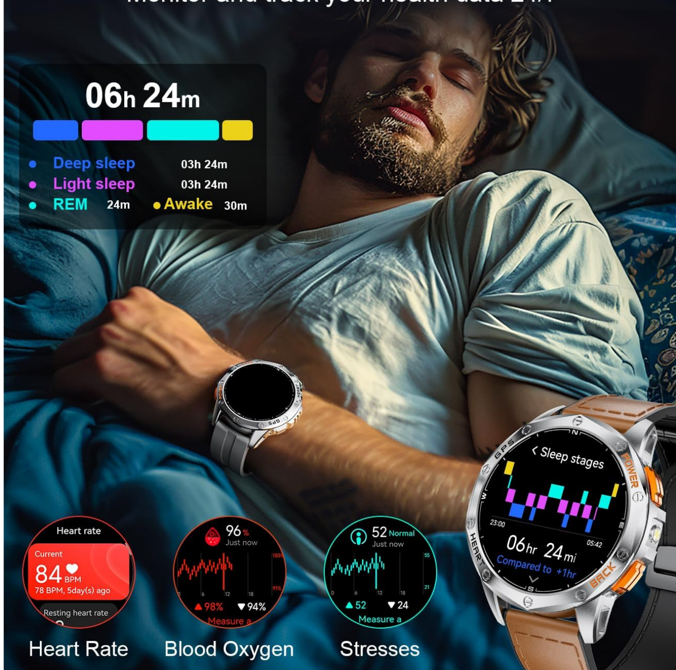
Figure 6: 24-Hour Health Management