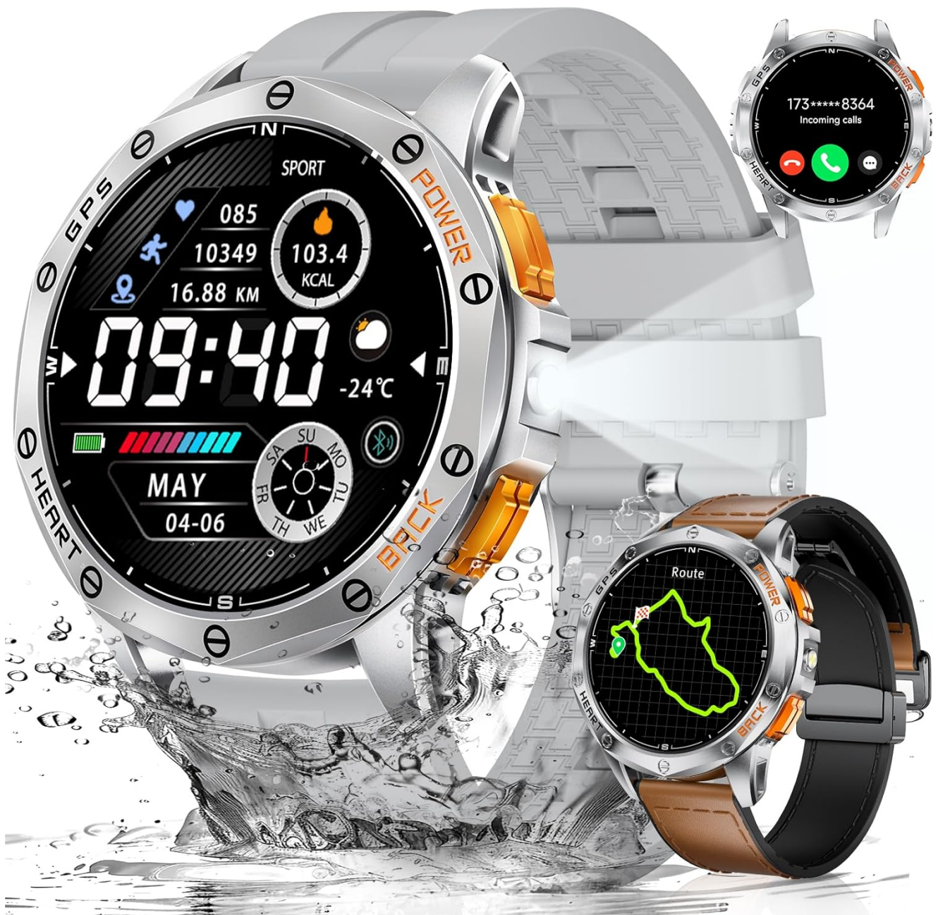
Figure 1: LIGE GPS Military Smart Watch (DM1-D-XY-US-JQ)