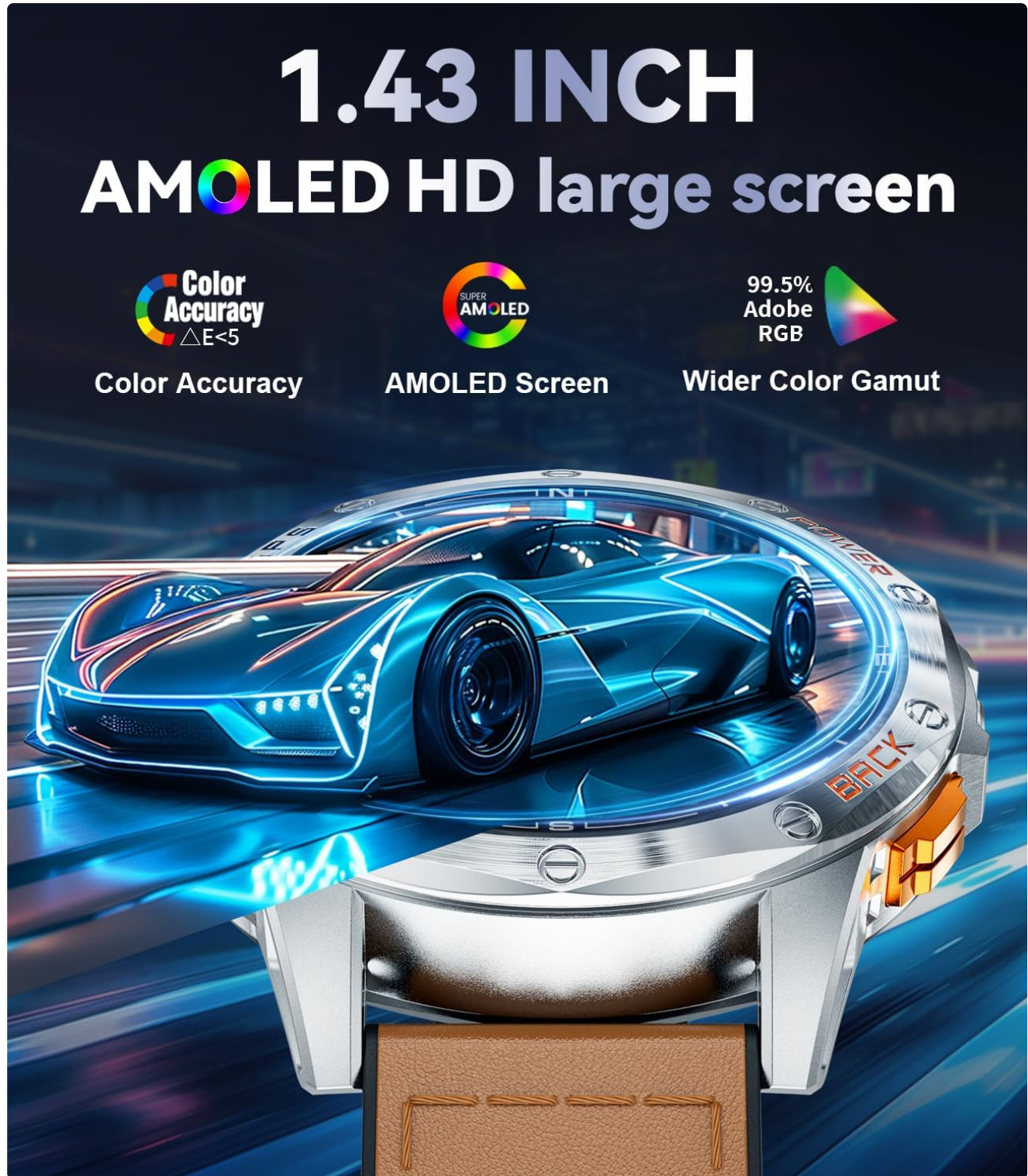
Figure 3: 1.43-inch AMOLED HD Screen

The LIGE DM1 features a 1.43-inch AMOLED touchscreen with 466*466 pixel resolution, offering clear visuals and responsive touch. Swipe and tap to navigate through menus and functions.