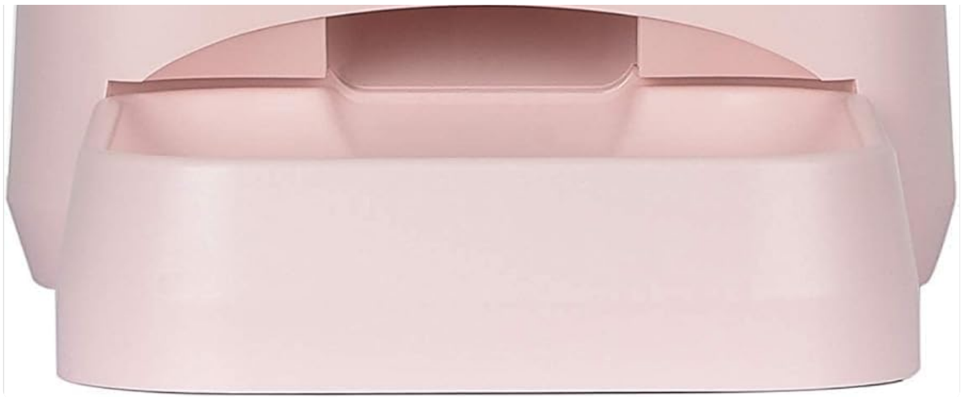
Front view of the DOGNESS 6L Smart Feeder, illustrating the main components including the food hopper lid, indicator lights, manual feed button, and detachable food tray.