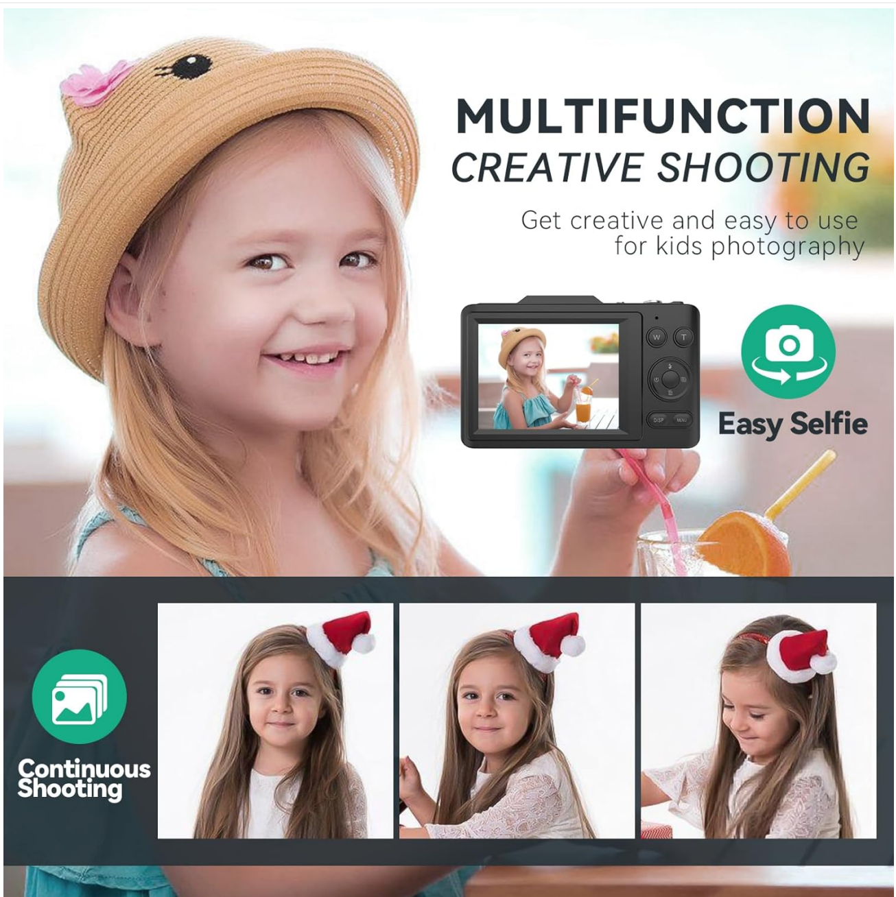
Image: A young girl smiling, illustrating the camera's 'Easy Selfie' function. Below, three sequential photos of a child demonstrate the 'Continuous Shooting' mode, capturing a series of moments.