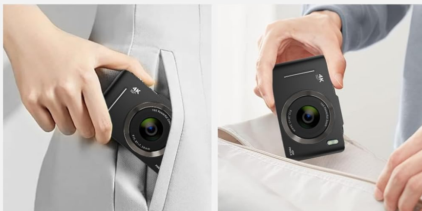
Image: The Bemkia H16 camera, showcasing its compact size (104mm x 66mm) and 2.8-inch IPS screen, alongside a smartphone for scale. This image highlights the camera's portability and ease of carrying.