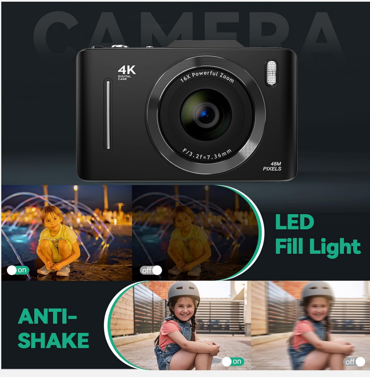
Image: Demonstrates the effect of the LED Fill Light in a dark environment, showing a brighter image when 'on' compared to 'off'. Also illustrates the Anti-Shake function, comparing a blurry image (off) with a clear image (on) during movement.