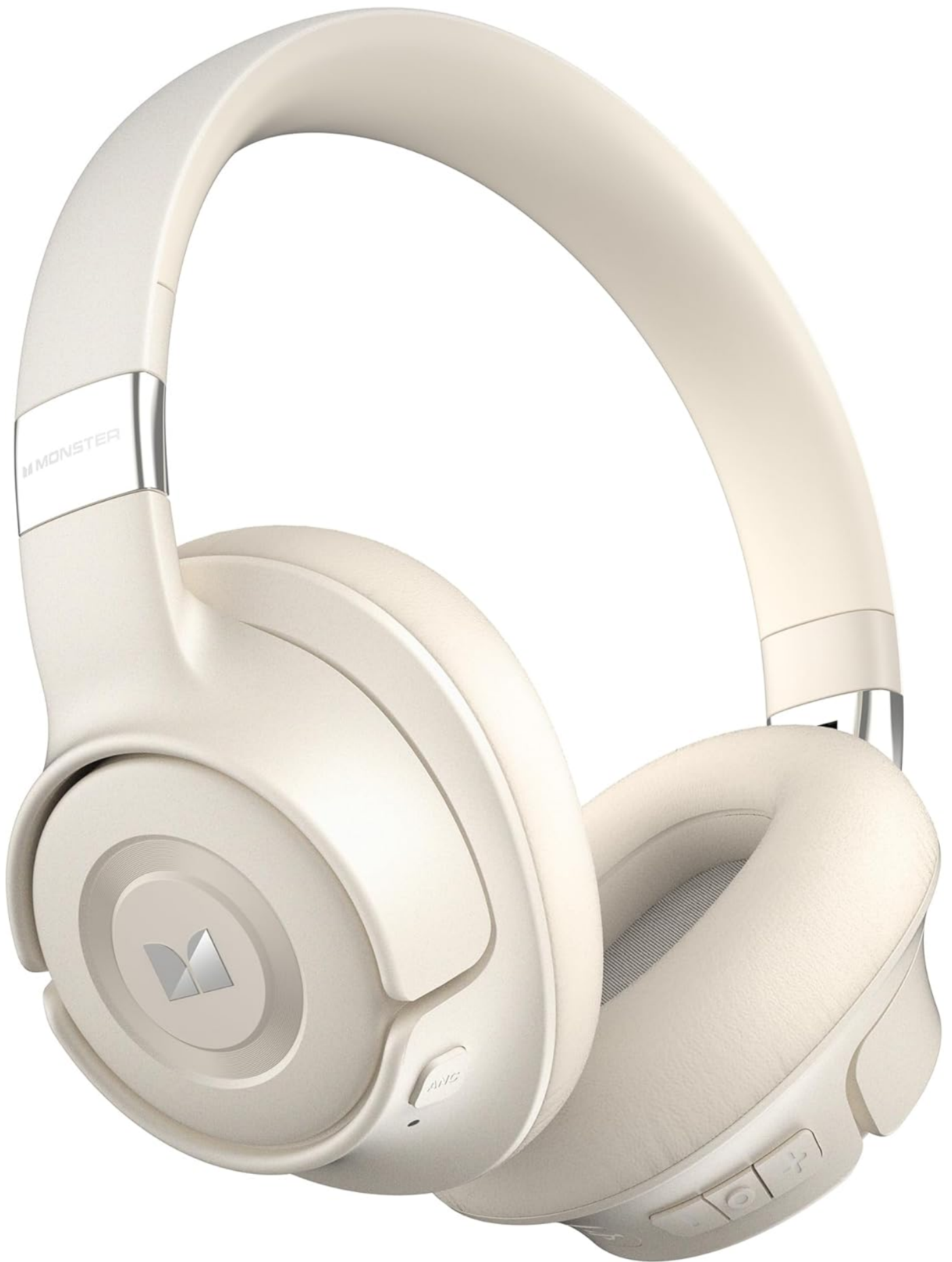
Image: Monster Persona SE ANC Headphones, showcasing their sleek white design.