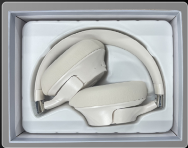
3. Store in Case