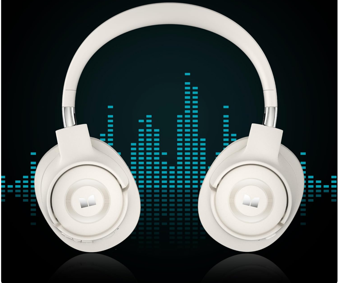
Image: A visual representation of deep bass, with sound equalizer bars behind the Monster Persona SE ANC headphones, emphasizing the powerful bass output.