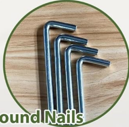
4 Ground Nails