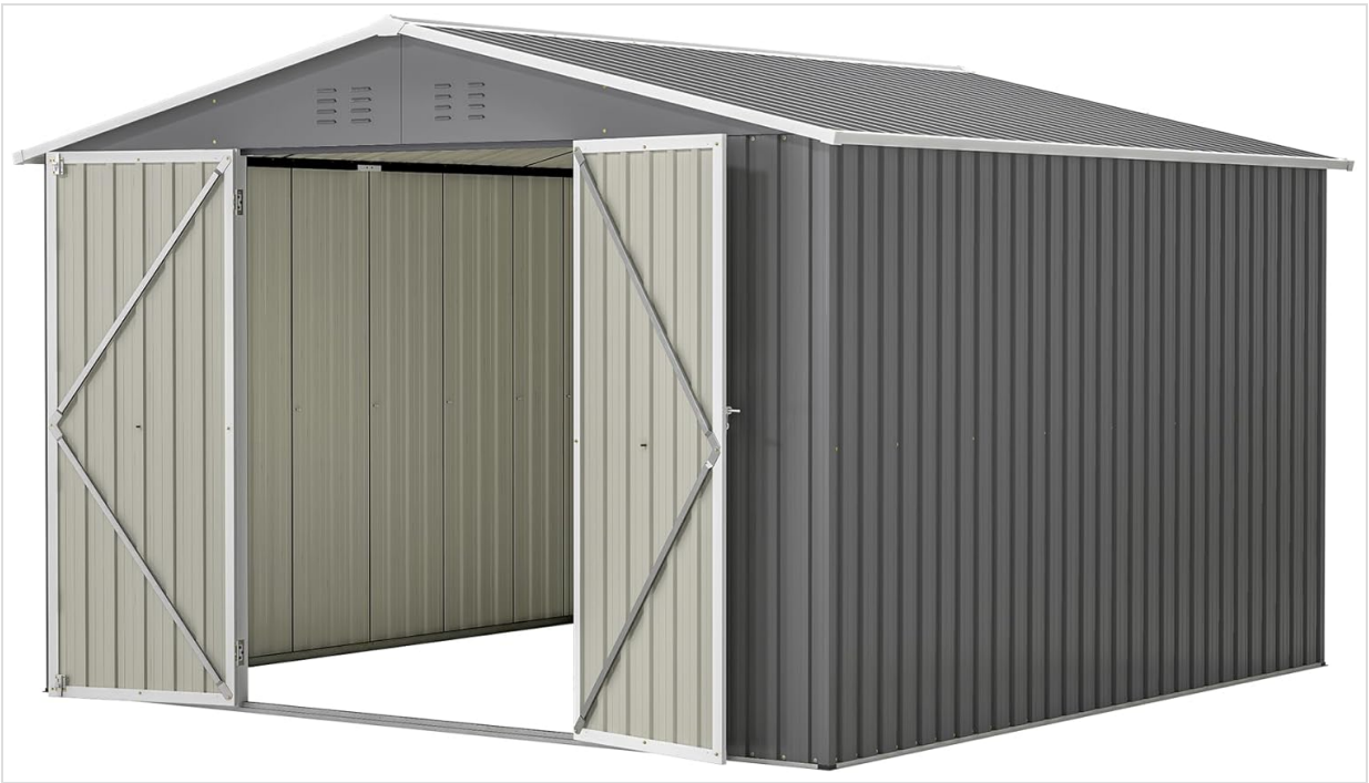
Image: The shed with its double doors fully open, showcasing the interior space and accessibility for larger items.