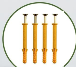
4 Expansion Screws