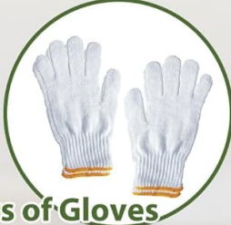
2 Pairs of Gloves