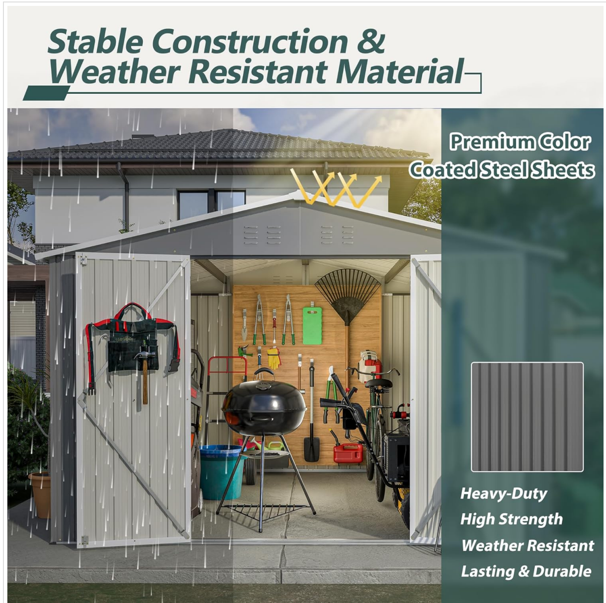
Image: The shed standing firm during rainfall, illustrating its stable construction and weather-resistant material designed for lasting durability.

The shed is constructed from durable, weather-resistant metal, requiring minimal maintenance. Periodically check all screws and bolts to ensure they remain tight. Clean the exterior with mild soap and water as needed to maintain its appearance. Ensure proper ventilation to prevent moisture buildup inside the shed.