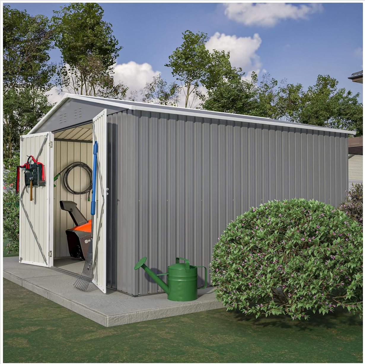
Image: The LZBEITEM 10x10 Ft Metal Outdoor Storage Shed with its double doors open, revealing a spacious interior suitable for storing various items.