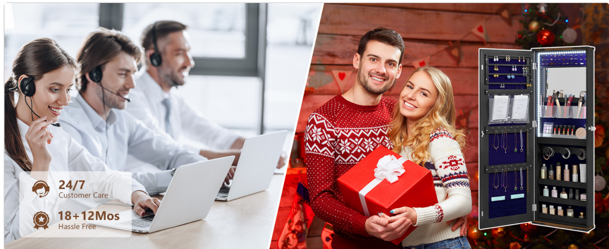
Figure 9.1: Customer Support and Warranty Information.

For any questions, concerns, or support needs, please contact Dystler Customer Care. Our support team is available 24/7 to assist you.