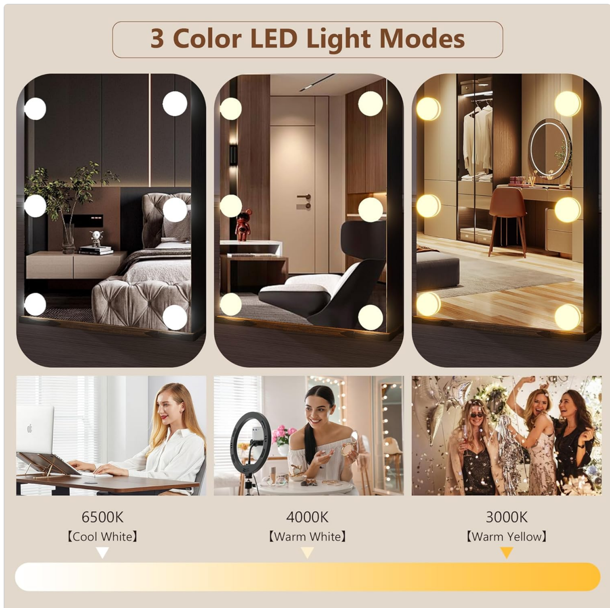
Figure 5.1: 3 Color LED Light Modes.

4. Brightness Adjustment: Long press the touch button to dim or brighten the lights. Release when the desired brightness is achieved.