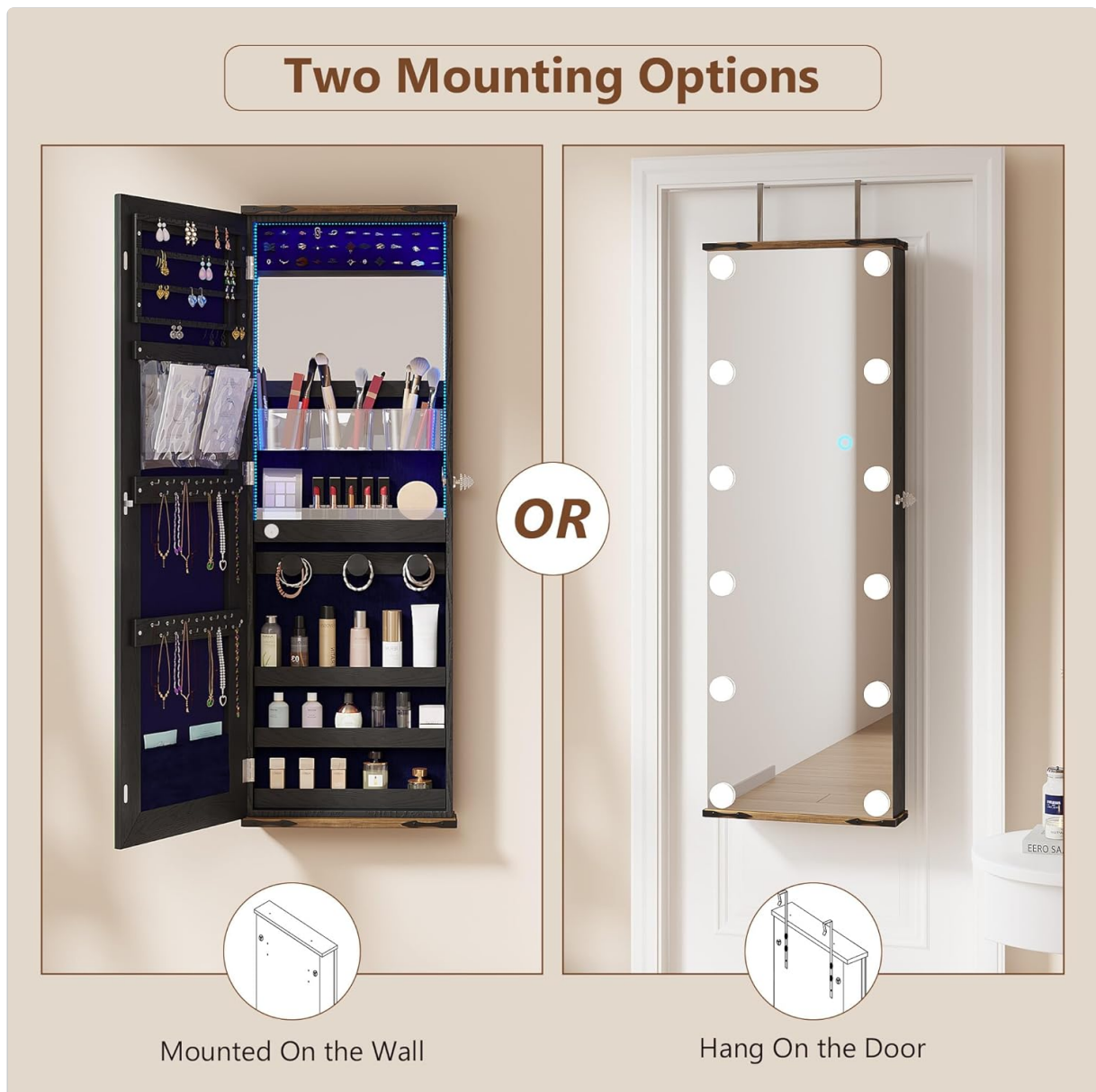
Figure 4.1: Two Mounting Options: Wall-Mounted or Over-the-Door.