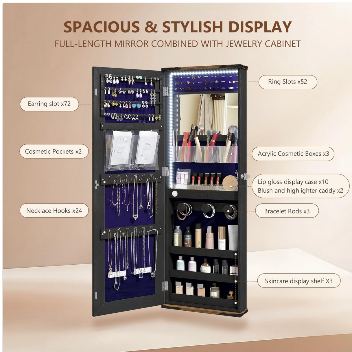
Figure 5.3: Interior Storage Layout.