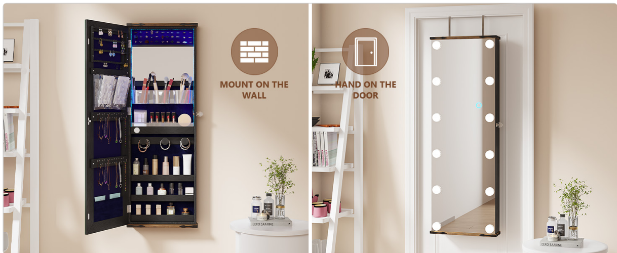
Figure 4.3: Wall Mounting Option.