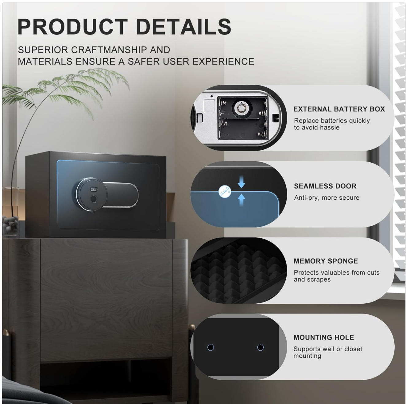
Image: A detailed view of the safe's locking mechanism, illustrating the emergency key insertion point and the battery compartment for 4 AAA batteries.