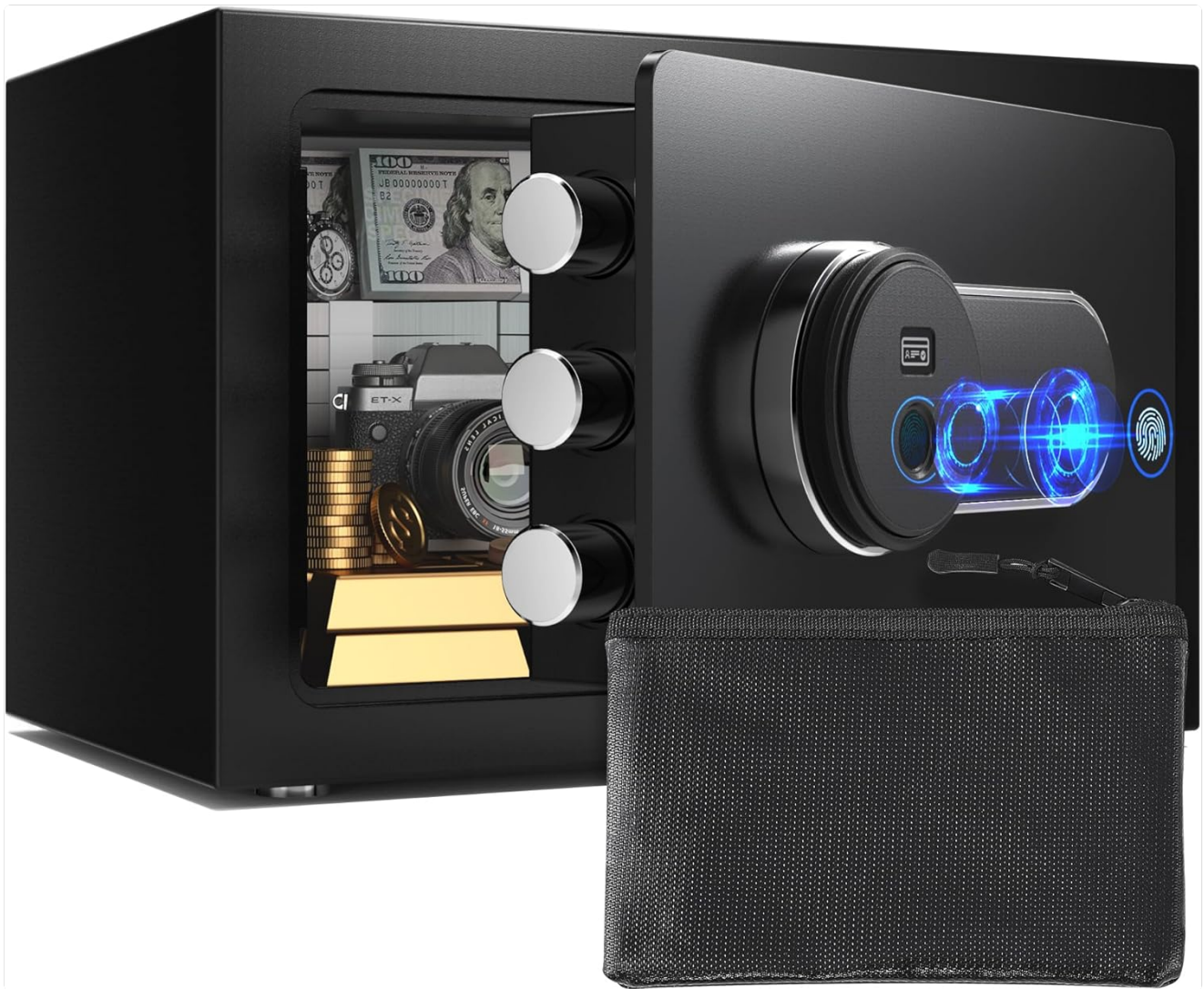
Image: The Marcree Safe Box with its door open, revealing various valuables stored inside, including currency, gold bars, and a camera. A fireproof waterproof bag is shown in the foreground.