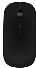
Wireless Mouse x 1