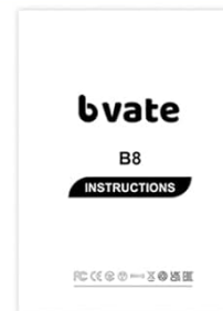
User Manual x 1