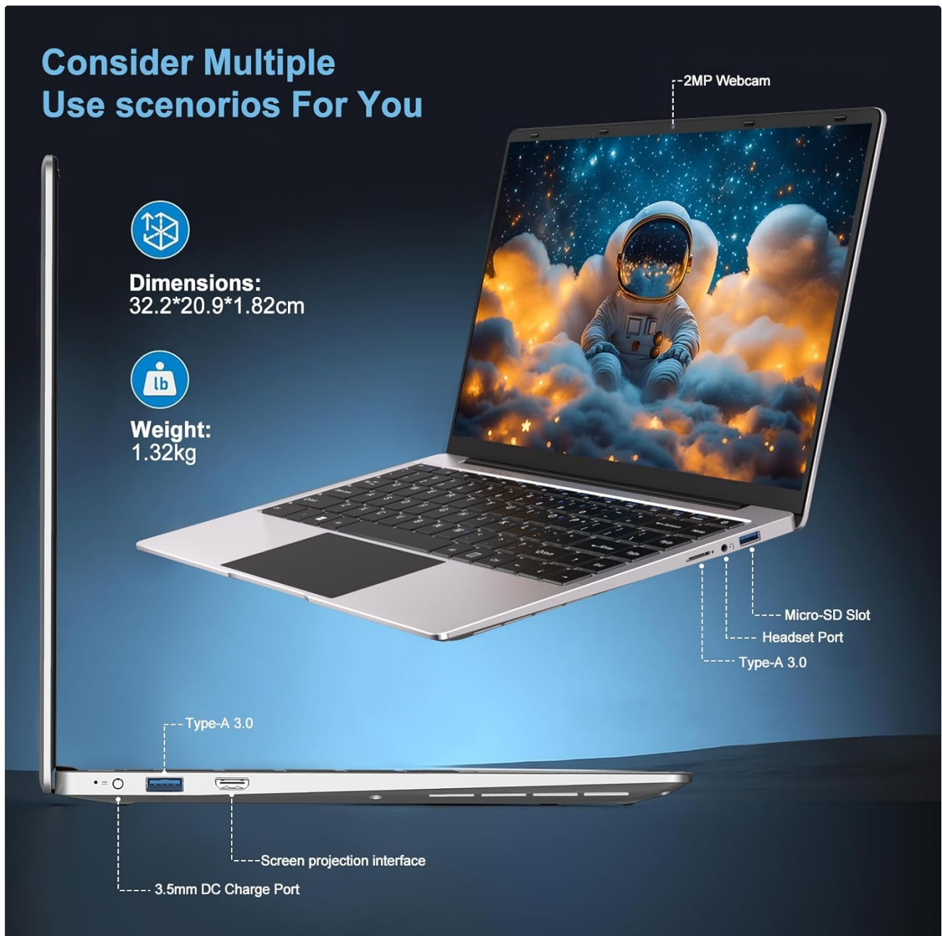
Image: Detailed side view of the bvate B8 laptop, illustrating the location of its various ports and connectors.