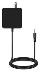
12V/2.5A DC Charger x 1