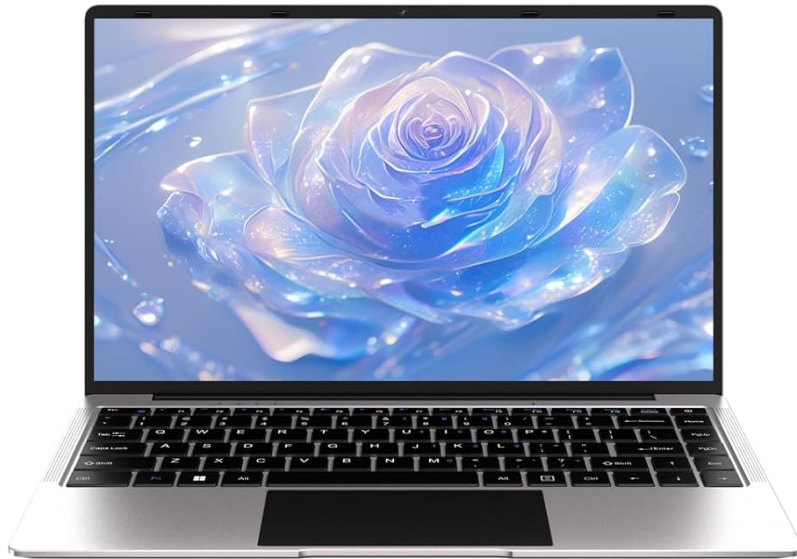
Laptop x 1