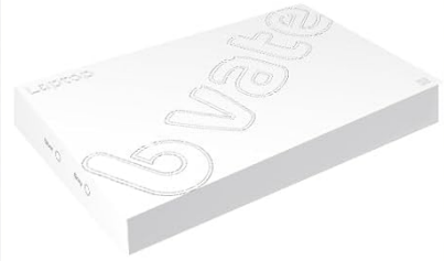
Packaging Box x 1