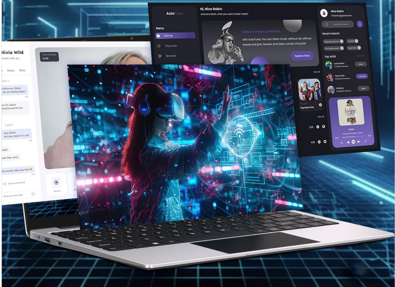
Image: Visual representation of the laptop's 8GB RAM and 256GB SSD configuration, indicating its capacity for smooth operation.