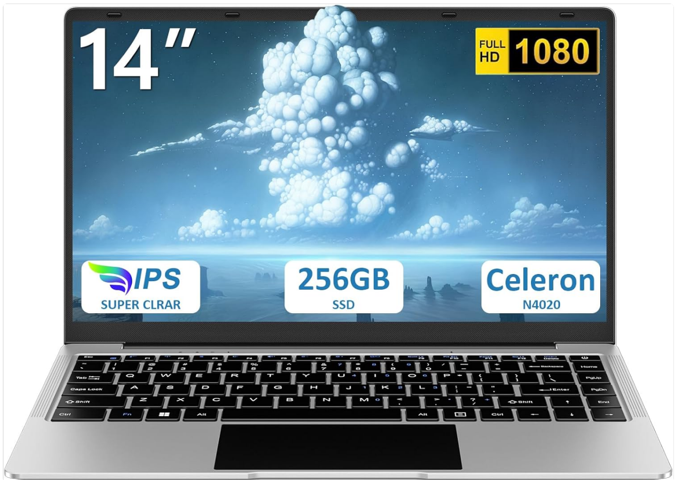
Image: Front view of the bvate B8 laptop, showcasing its 14-inch Full HD display and key specifications like 256GB SSD and Celeron N4020 processor.