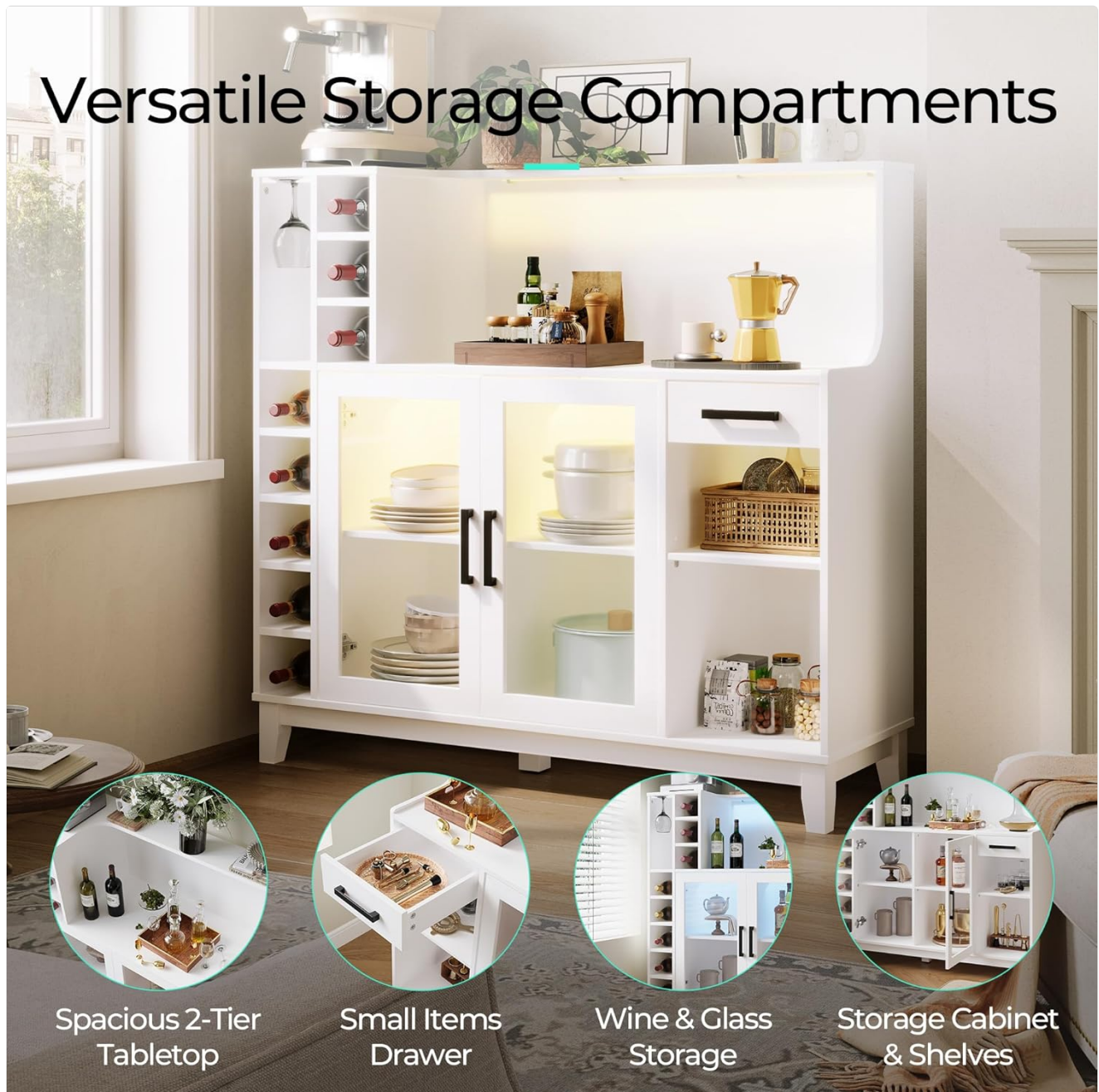
Image 3.2: Detailed view of the cabinet's versatile storage compartments, highlighting the spacious 2-tier tabletop, small items drawer, wine and glass storage, and general storage cabinet with shelves.