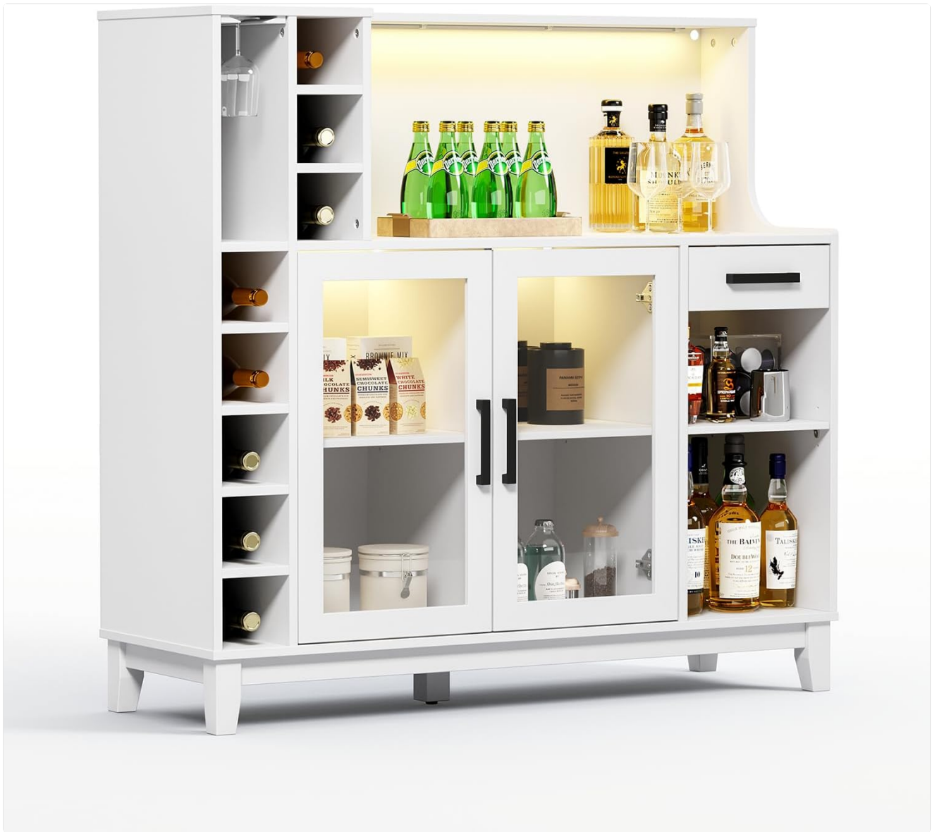
Image 1.1: Front view of the LINSY HOME Wine Bar Cabinet with LED Light. The cabinet is white and features various storage compartments, including wine racks, glass racks, and glass-fronted doors.

The LINSY HOME Wine Bar Cabinet is designed to offer versatile storage and display options for your living room, dining room, or kitchen. It features a durable waterproof countertop, integrated LED lighting, and multiple compartments for wine, glasses, and other bar or coffee essentials.