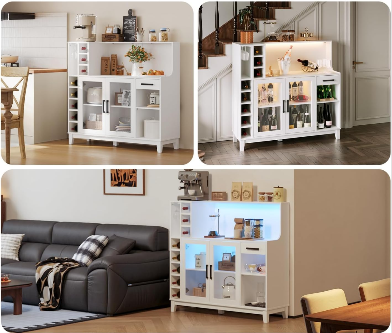
Image 1.2: Examples of the LINSY HOME Wine Bar Cabinet used in different home environments, showcasing its versatility as a wine cabinet, coffee bar, or general storage unit.