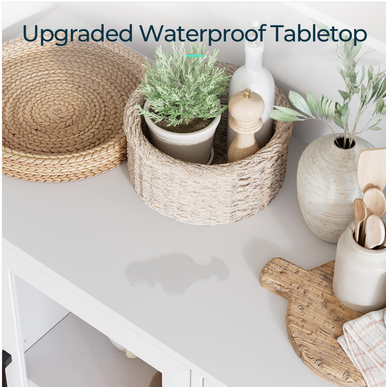
Image 4.1: Close-up view of the upgraded waterproof tabletop, demonstrating its resistance to liquid spills.

The countertop is made of waterproof melamine laminate, designed to resist water penetration. While durable, it is recommended to wipe up spills promptly to maintain its appearance and integrity over time.