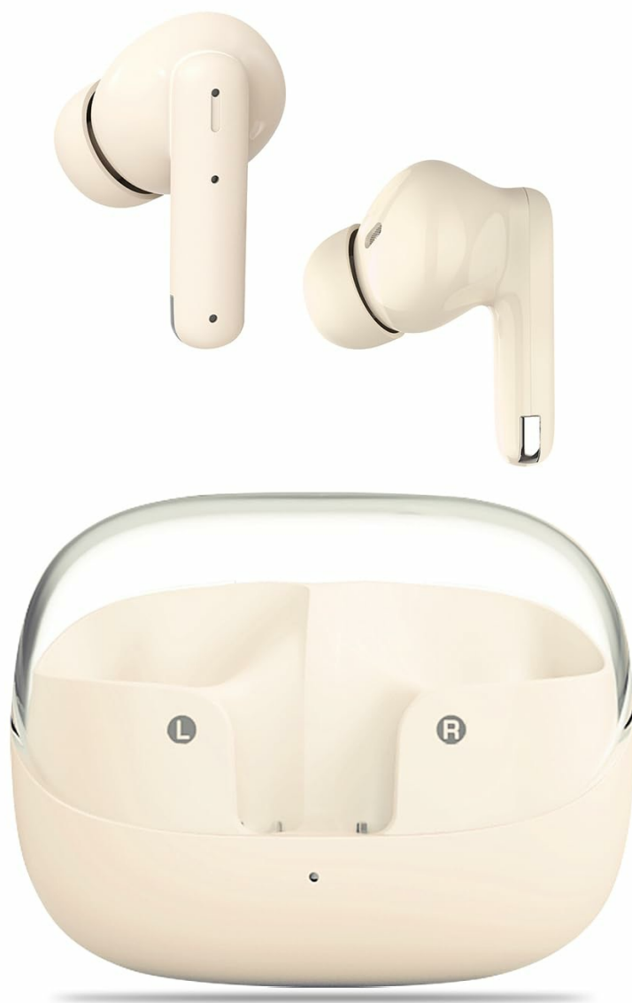
Image 1.1: The SHANLING MTW60 earphones in their charging case, held in a hand, showcasing their compact size.