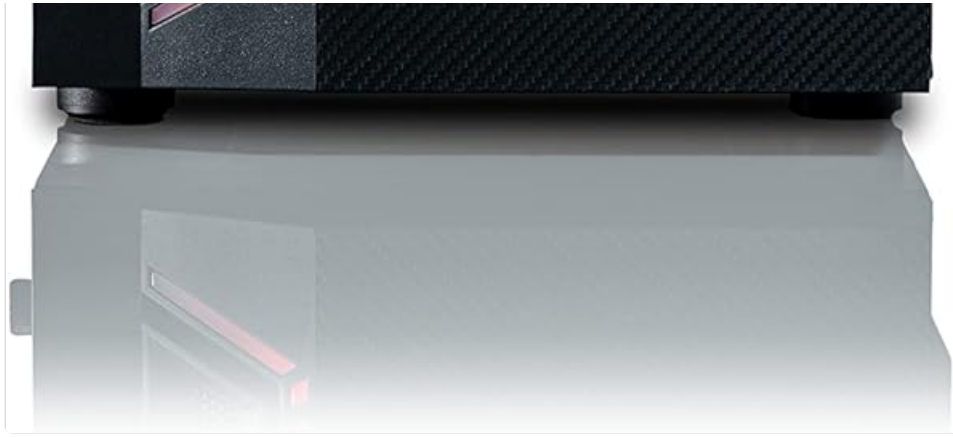
Image: Side view of the BEASTCOM Q3 Gaming PC, highlighting the case design.