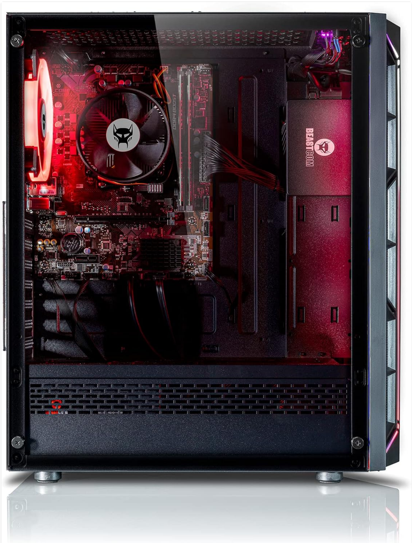
Image: Internal view of the BEASTCOM Q3 Gaming PC, showing the motherboard, CPU cooler, and graphics card.