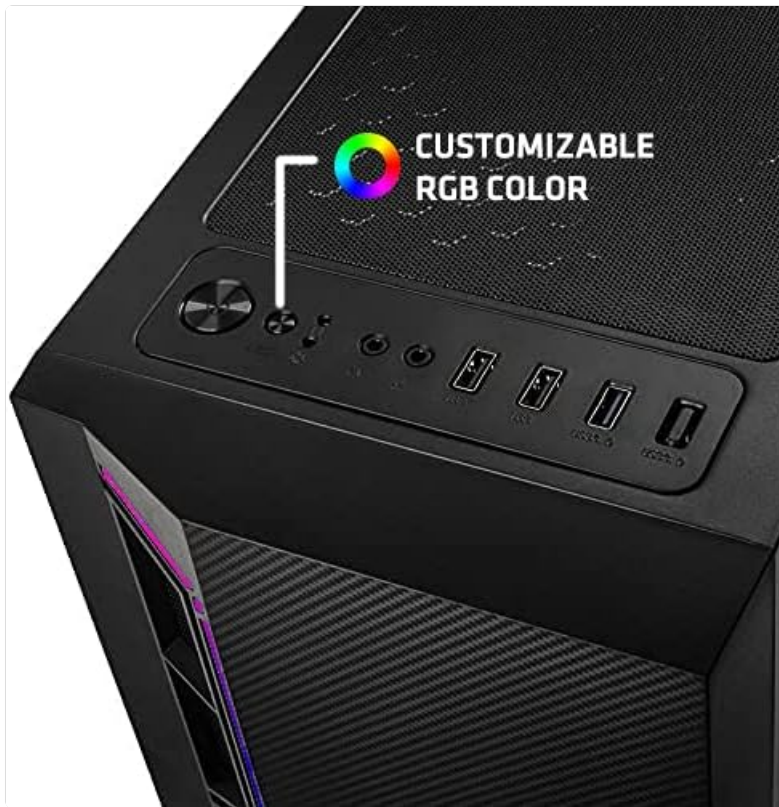
Image: Close-up of the top panel of the BEASTCOM Q3 Gaming PC, showing USB ports, audio jacks, and the RGB control button.