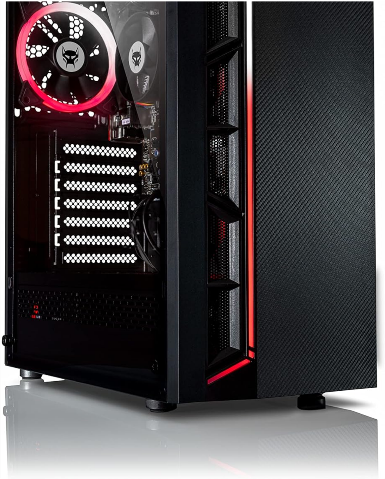
Image: Front-left view of the BEASTCOM Q3 Gaming PC, showcasing its design and internal components.