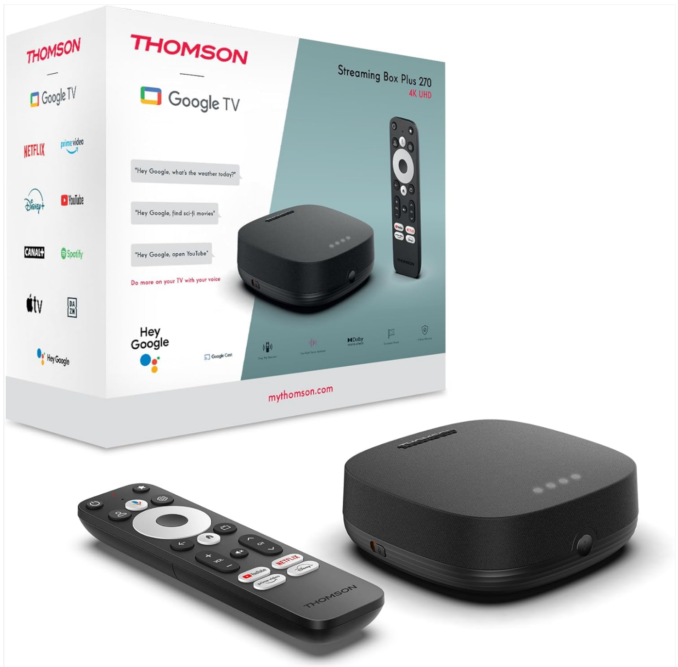
Figure 1: The THOMSON Streaming Box Plus 270, its remote control, and packaging. This image illustrates the main components included in the product package.