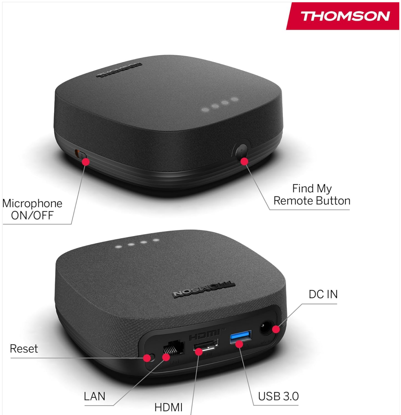
Figure 4: Detailed view of the THOMSON Streaming Box Plus 270, highlighting its ports and buttons. These include DC IN for power, HDMI for TV connection, LAN for wired internet, USB 3.0 for external storage, a Reset button, a Microphone ON/OFF switch, and a "Find My Remote" button.