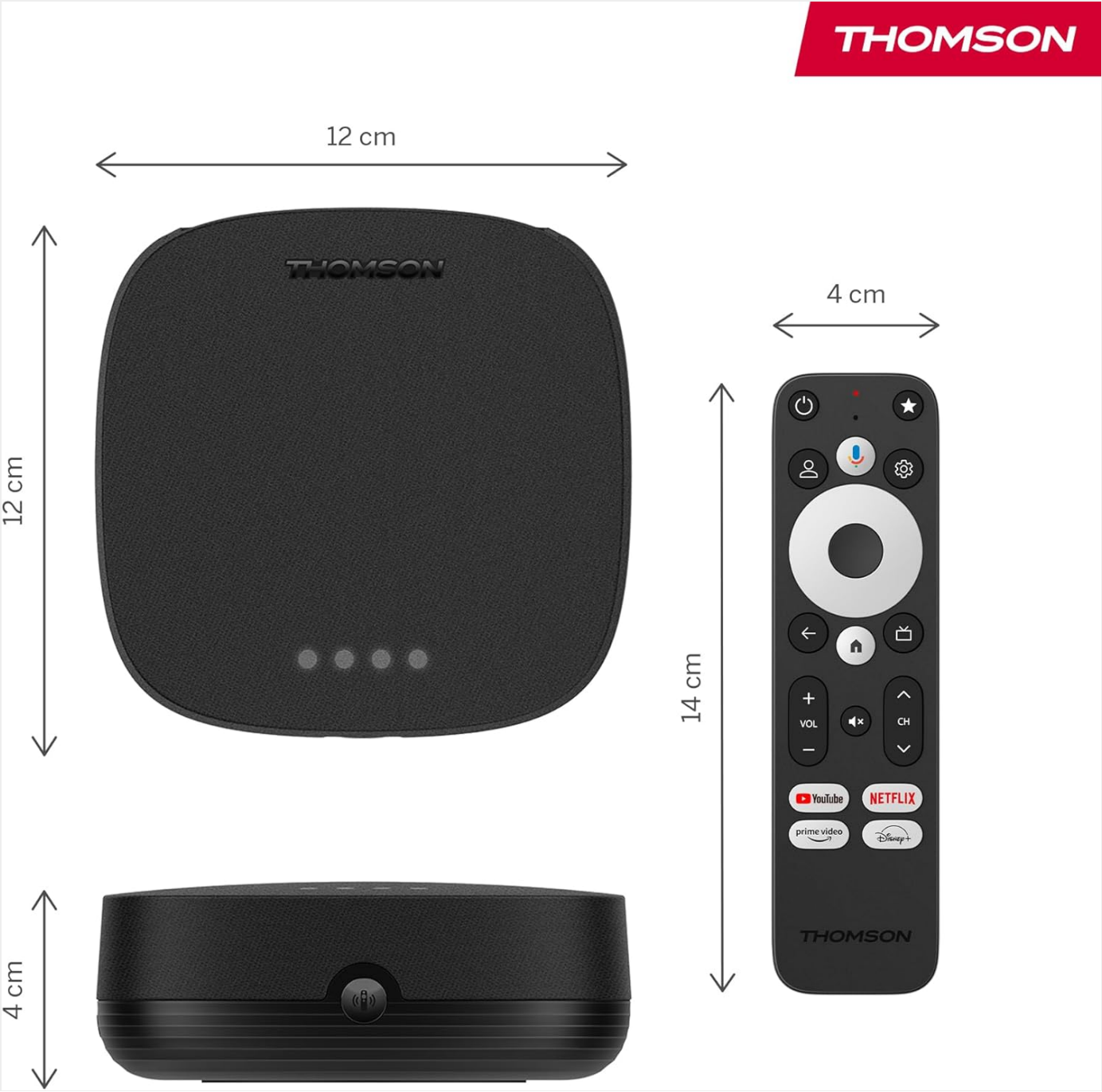
Figure 9: Technical drawing showing the approximate dimensions of the THOMSON Streaming Box Plus 270 (12 cm x 12 cm x 4 cm) and its remote control (14 cm x 4 cm).