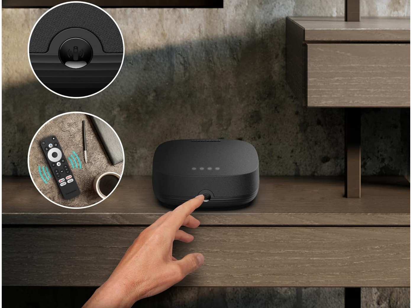
Figure 8: A hand pressing the "Find My Remote" button on the Streaming Box. An inset shows a close-up of the button. The remote control is depicted with sound waves emanating from it, indicating it is emitting a sound to be found.

Press the Find My Remote Button and locate your remote with a buzzer sound