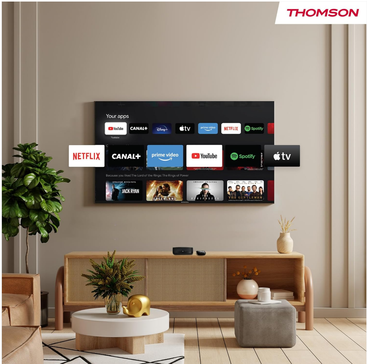
Figure 2: A television screen displaying the Google TV interface with various streaming applications such as YouTube, Canal+, Disney+, Apple TV, Netflix, Prime Video, and Spotify. This illustrates the wide range of entertainment options available.