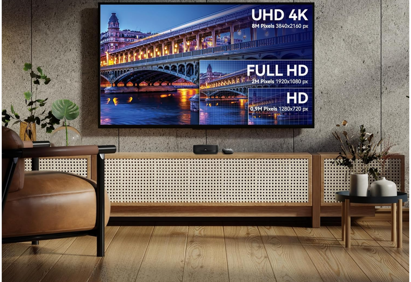
Figure 3: A visual comparison demonstrating the difference in clarity and detail between HD (1280x720 px), Full HD (1920x1080 px), and 4K UHD (3840x2160 px) resolutions on a television screen. The Streaming Box Plus 270 supports up to 4K UHD.

Supports all the latest resolutions up to 4K UHD