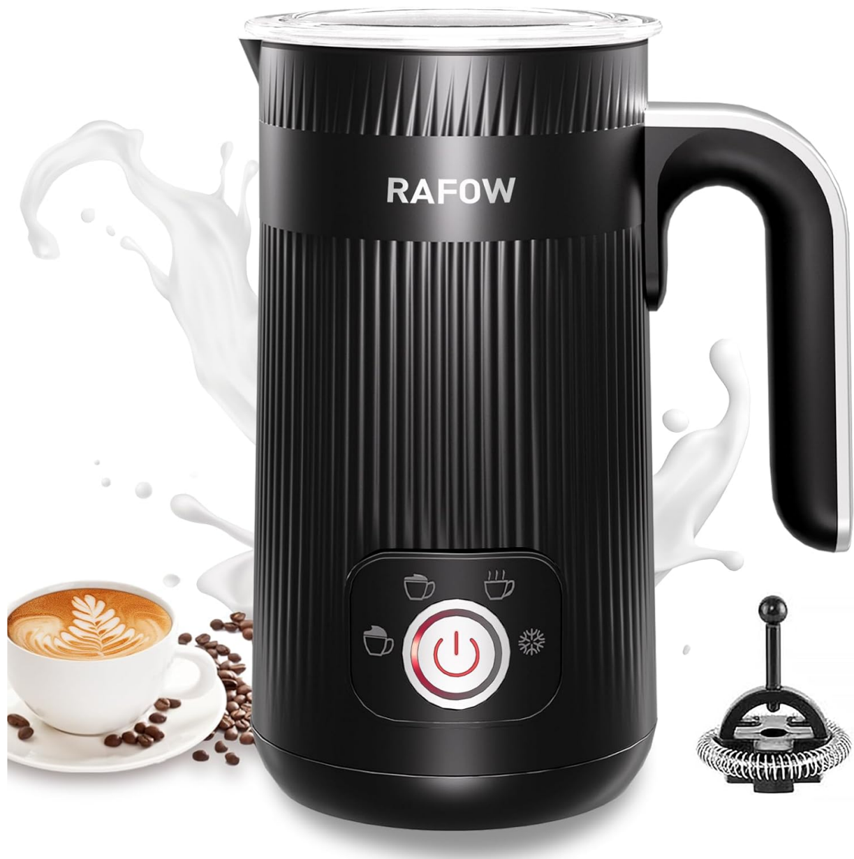
The Rafow 4-in-1 Electric Milk Frother, ready for use.