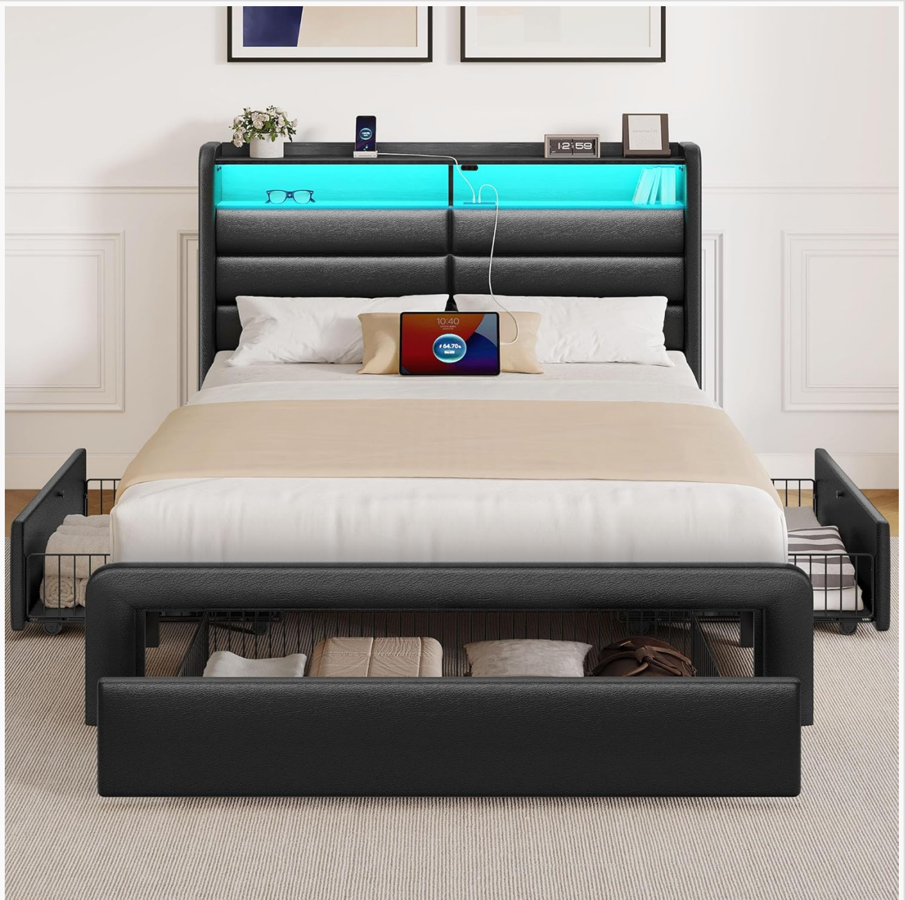
Figure 1: Seventable Twin Size Bed Frame (Black Twin)