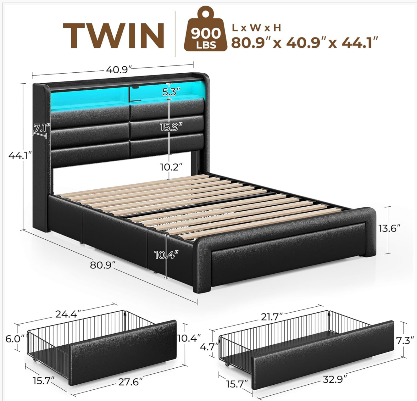
Figure 2: Twin Size Bed Frame Dimensions

Assembly can typically be completed in under 90 minutes. It is recommended to have two people for certain steps to ensure ease and safety.