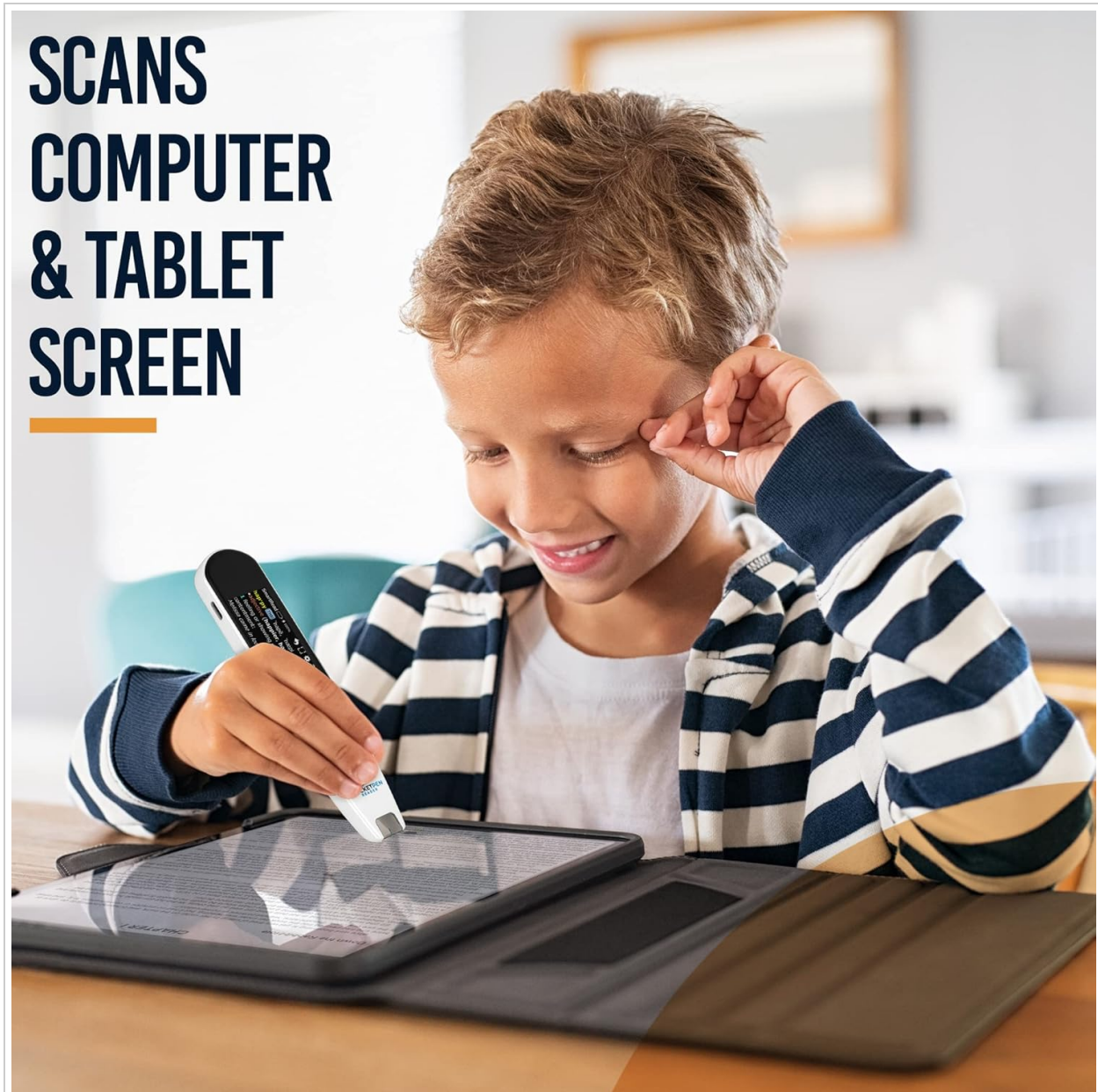
Image 4.1: A child using the RocketPen Reader to scan text from a tablet screen. This demonstrates the device's capability to read digital content.

To scan text, gently glide the scanning tip of the RocketPen Reader across the desired text. Ensure the tip maintains contact with the surface and move it smoothly and consistently. The device can scan both printed documents and digital screens.