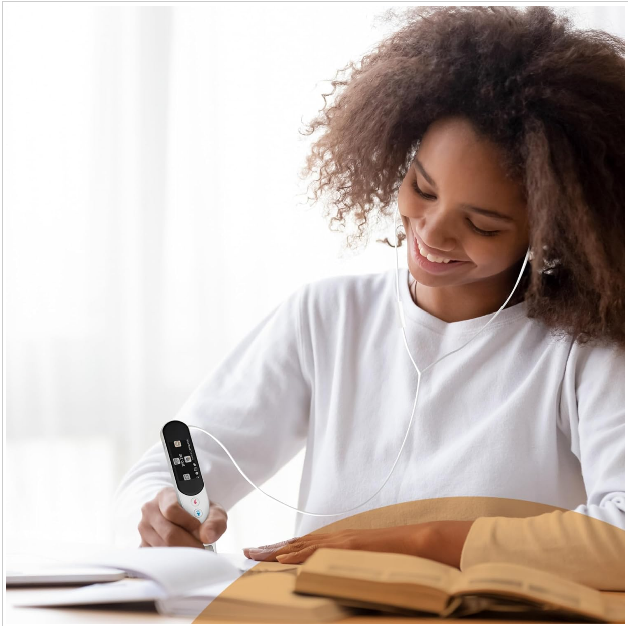
Image 4.2: A person using the RocketPen Reader while wearing headphones, scanning text from a physical book. This highlights the device's portability and private listening feature.

For private listening or in noisy environments, connect headphones to the RocketPen Reader's audio jack. This allows for focused audio output without disturbing others.