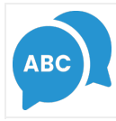
Icon 5.1: Spelling Assistance.