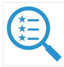
Icon 5.3: Phrase Verb Search.