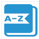
Icon 5.7: Vocabulary Development.