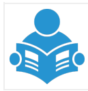
Icon 5.6: Word Highlighting.