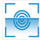
Icon 5.8: Versatile Scanning.

available for individual user preferences.