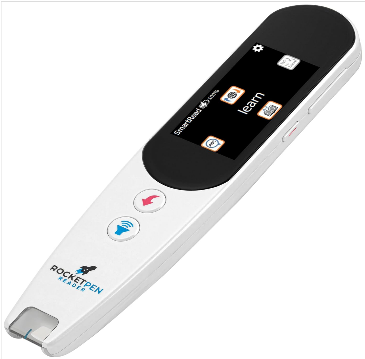
Image 1.1: The SmartPens 4U RocketPen Reader. This image displays the sleek, white design of the RocketPen Reader, featuring a small screen, control buttons, and the scanning tip.