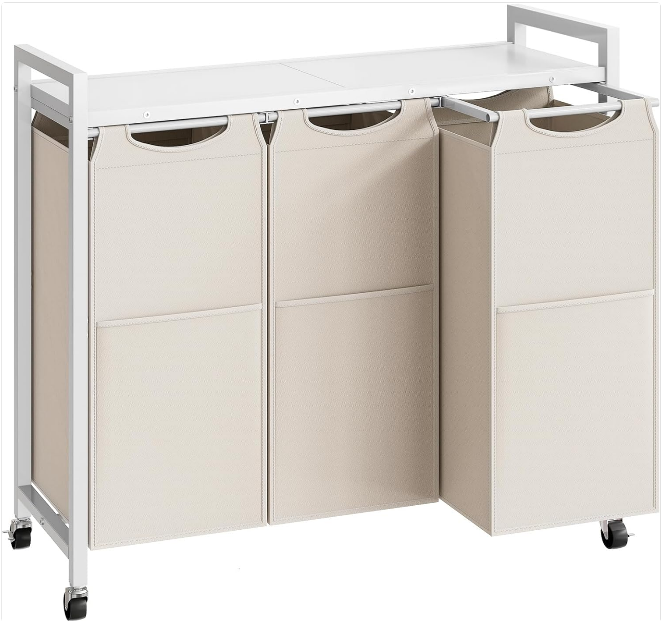
Image: Front view of the HOOBRO WG76XY01 3-Section Rolling Laundry Sorter in white and gray.