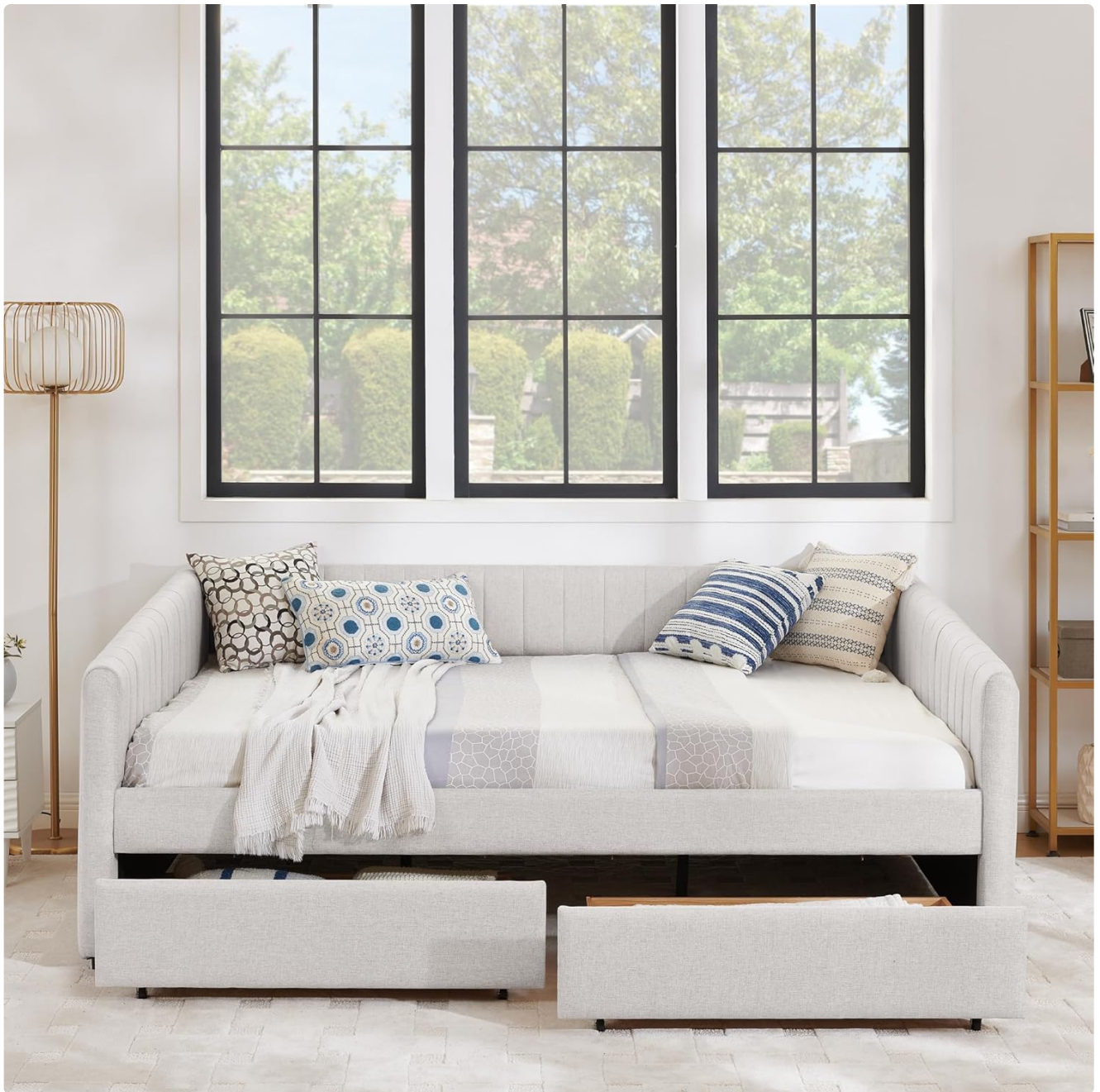
Image 1.1: The Polibi Queen Size Daybed in Linen Beige, showcasing its design and two pull-out storage drawers.