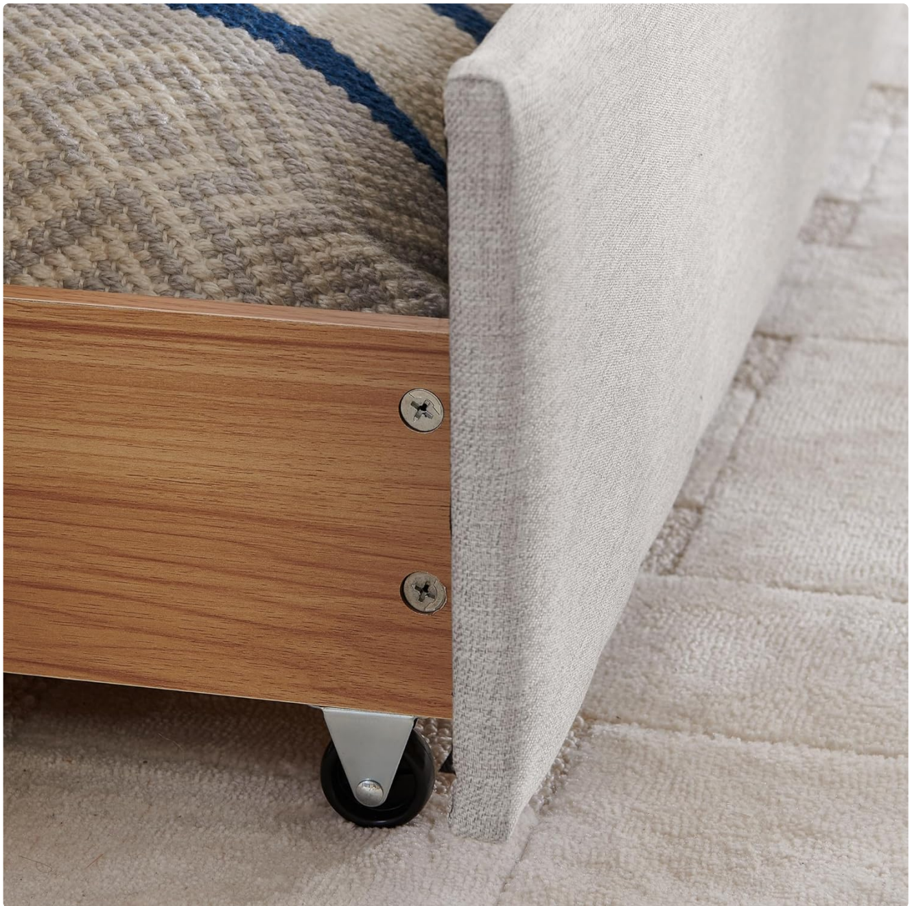
Image 5.2: A close-up view of the drawer's roller mechanism, highlighting its design for smooth operation.