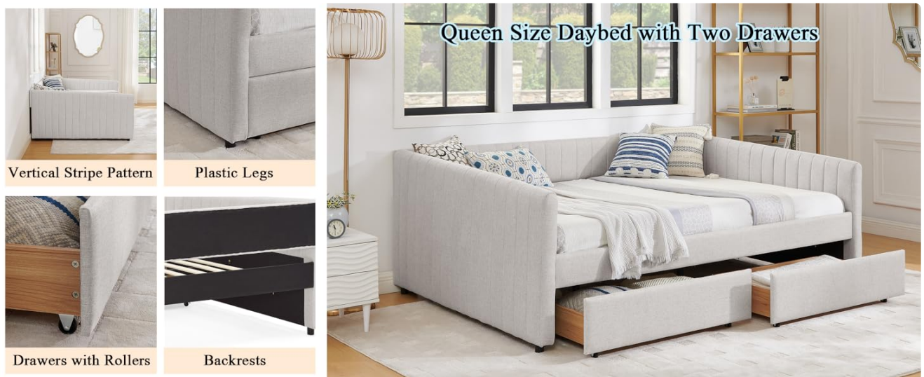
Image 3.1: Visual representation of key components including vertical stripe pattern, plastic legs, drawers with rollers, and backrests.