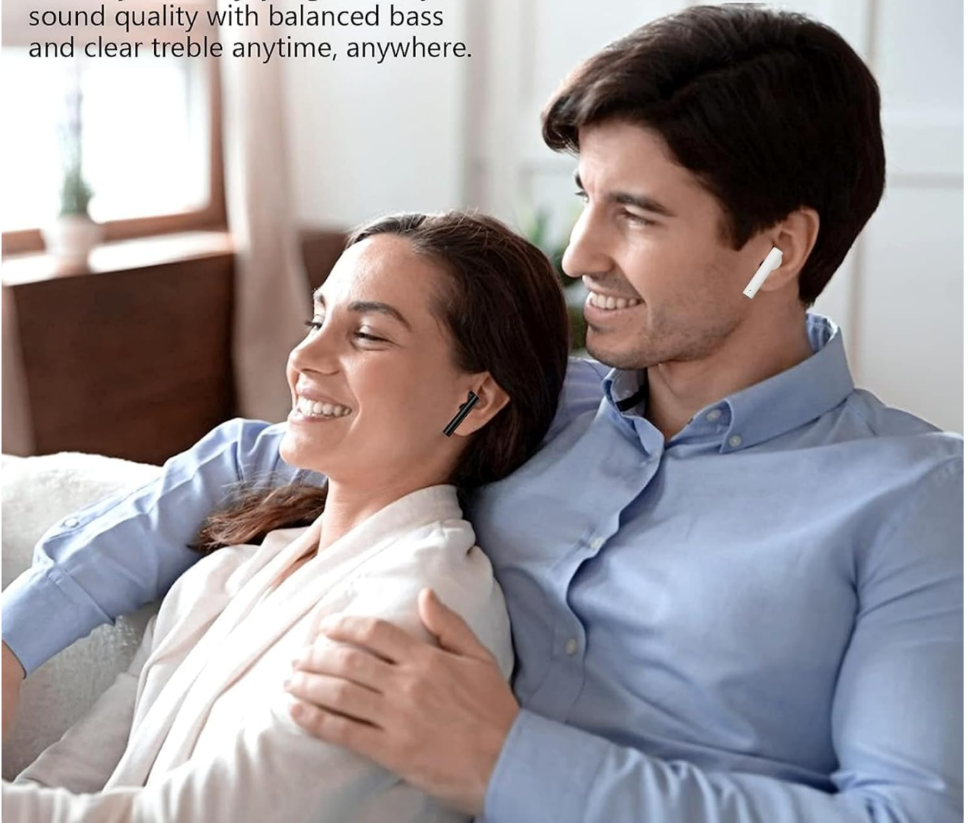
Figure 6: Stereo Sound Quality. This image shows two people enjoying music with the earbuds, illustrating the high-fidelity sound experience with balanced bass and clear treble.

Allows you to enjoy high-fidelity sound quality with balanced bass and clear treble anytime, anywhere.